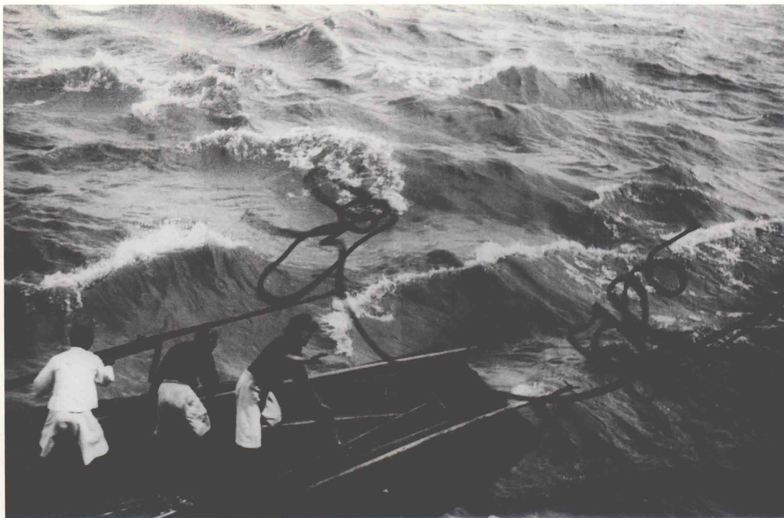
力挽狂澜。（1935年摄于湖北黄冈附近长江江心的轮船 上）（张印泉 摄）

The picture shows a boat on the Yangtze River near Huanggang of central China's Hubei Province in 1935. (Photo by Zhang Yinquan)