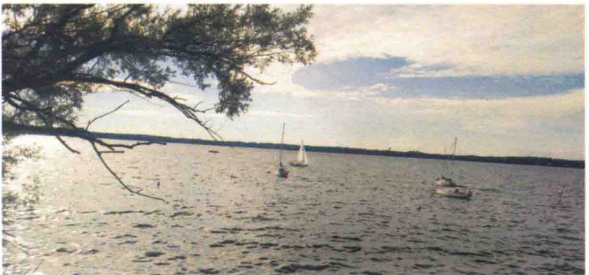
Picture 9 Lake Monona