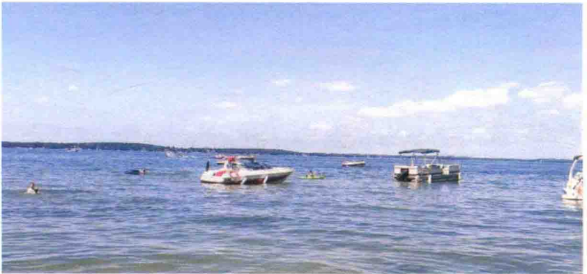
Picture 8 Lake Mendota