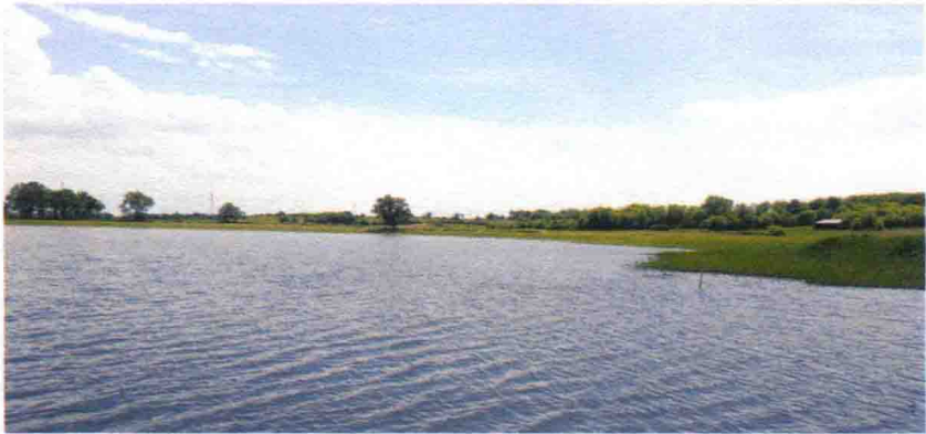
Picture 11 Lake Waubesa