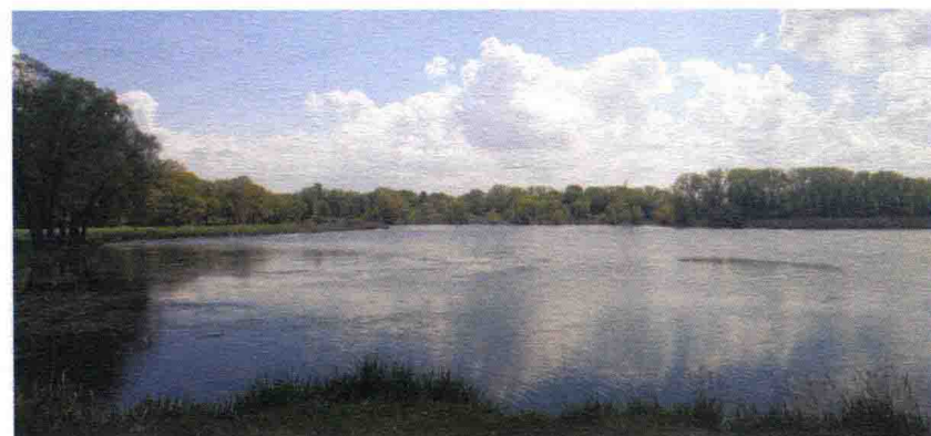
Picture 15 Walner Park