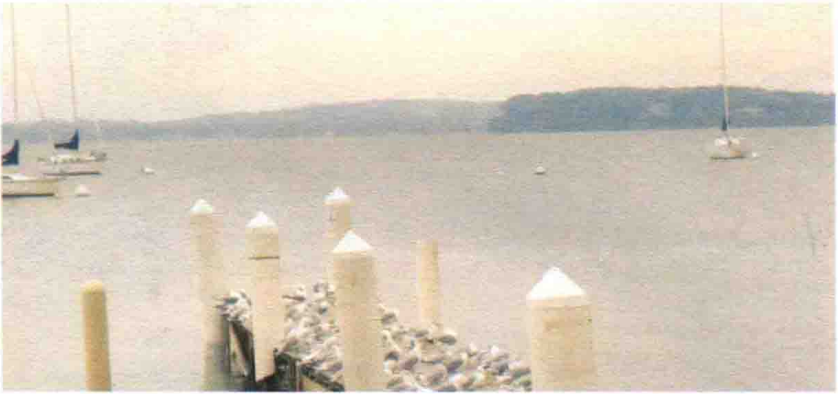
Picture 10 Lake Wingra