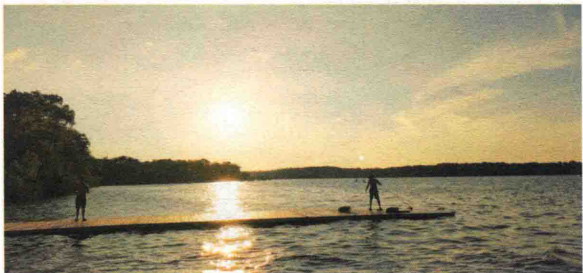
Picture 3 Fishing