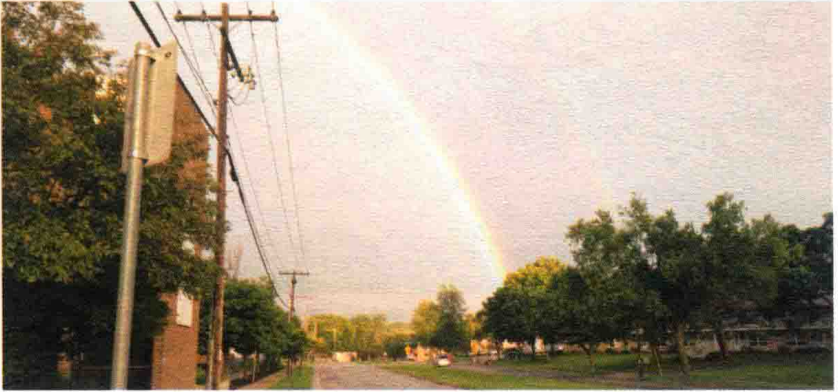
Picture 1 Rainbow