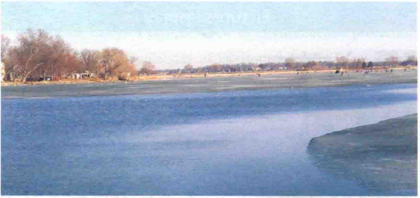
Picture 4 The Early Spring of Madison