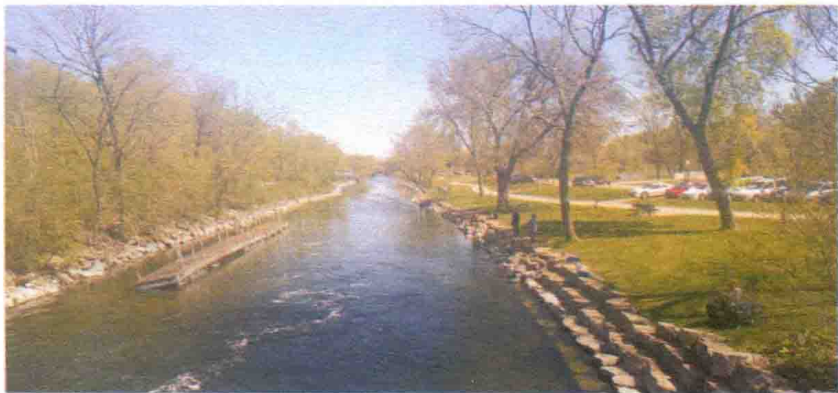
Picture 12 The Yahara River