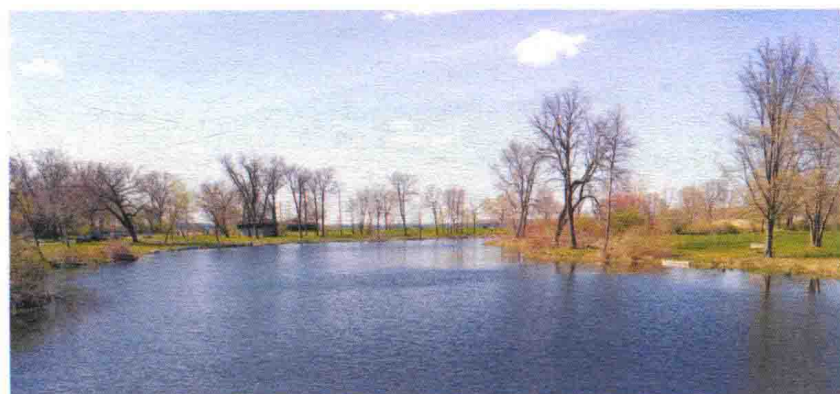
Picture 14 Tenny Park