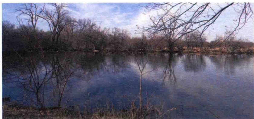
Picture 13 Wingra Creek