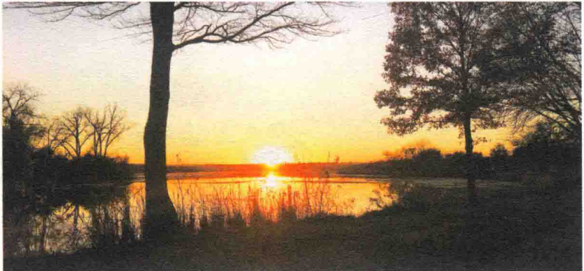
Picture 2 The Sunset