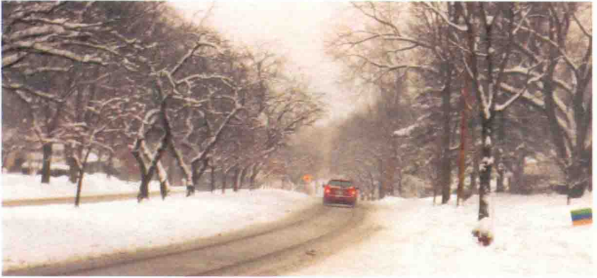
Picture 7 Madison in Winter