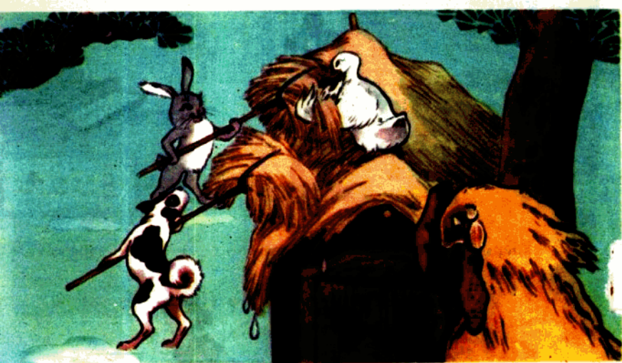
«How the Cock Got His Red Face»