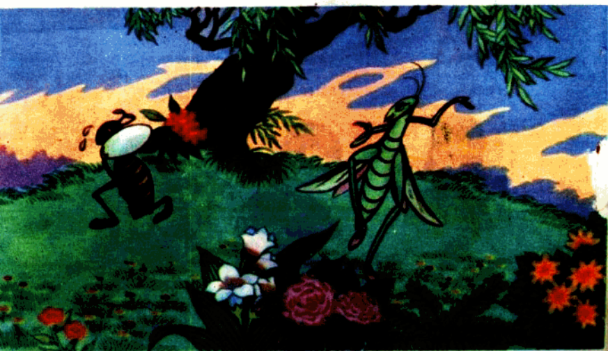
«The Ant and the Grasshopper»