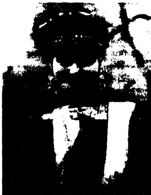
An American girl in traditional chinese costume (服装)