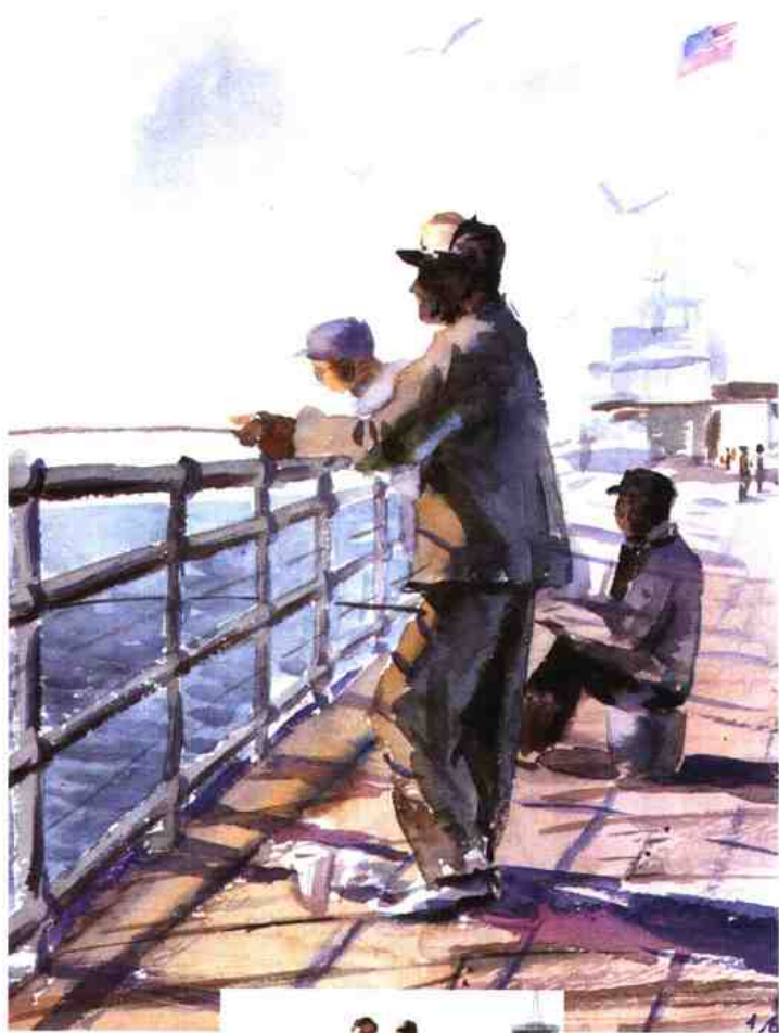
上 洛杉矶海 滨栈桥上的垂 钓者