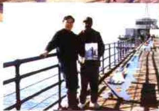
左 作者与上 图中模特儿 (右)的合影。