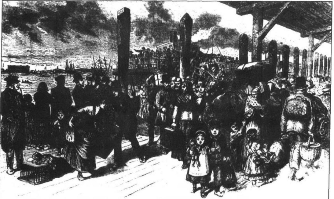
Ten million eager immigrants entered the U.S. between 1860 and 1890.