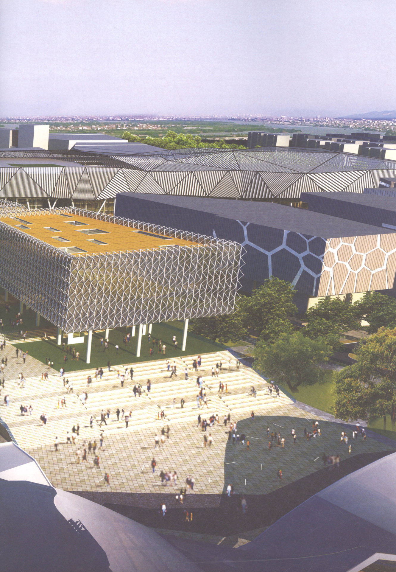
Partial airspace 局部鳥瞰圖