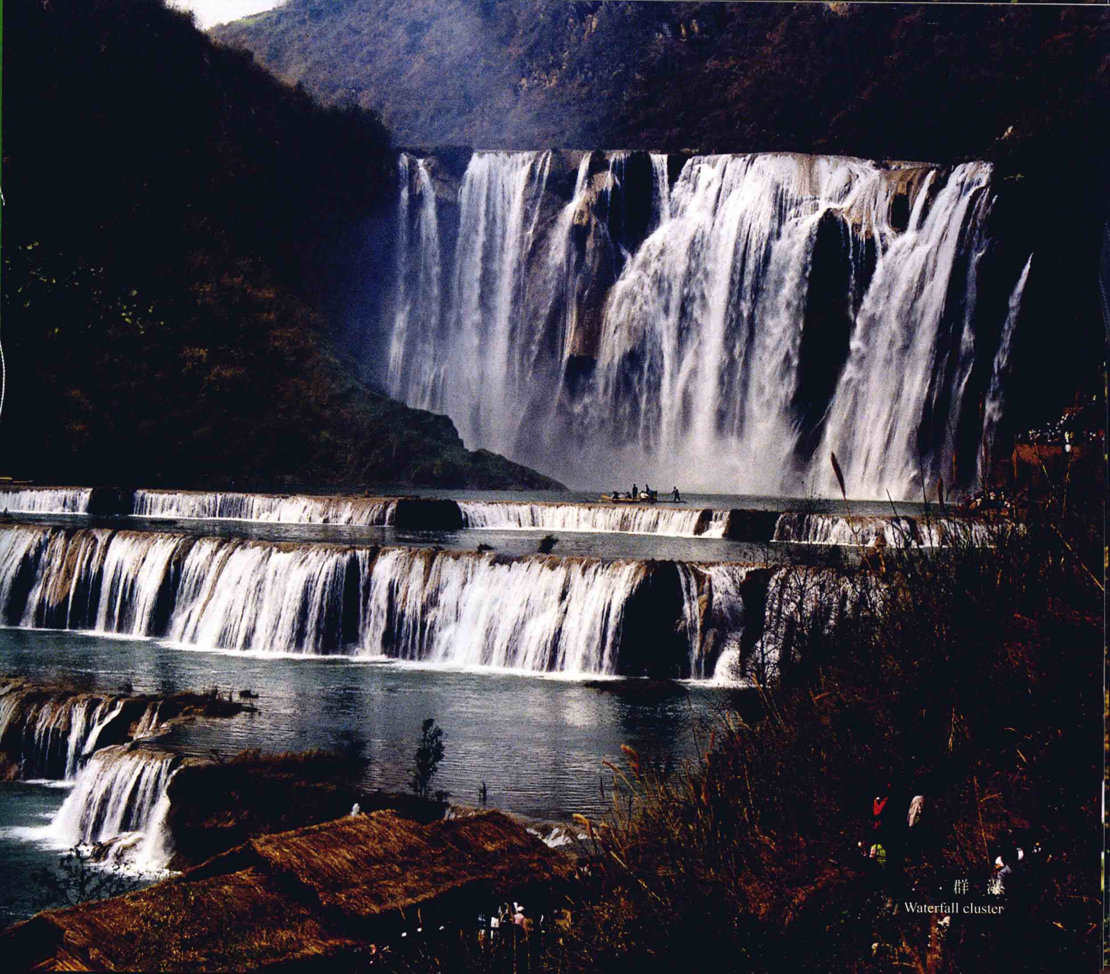
· 群 瀑 · Waterfall cluster