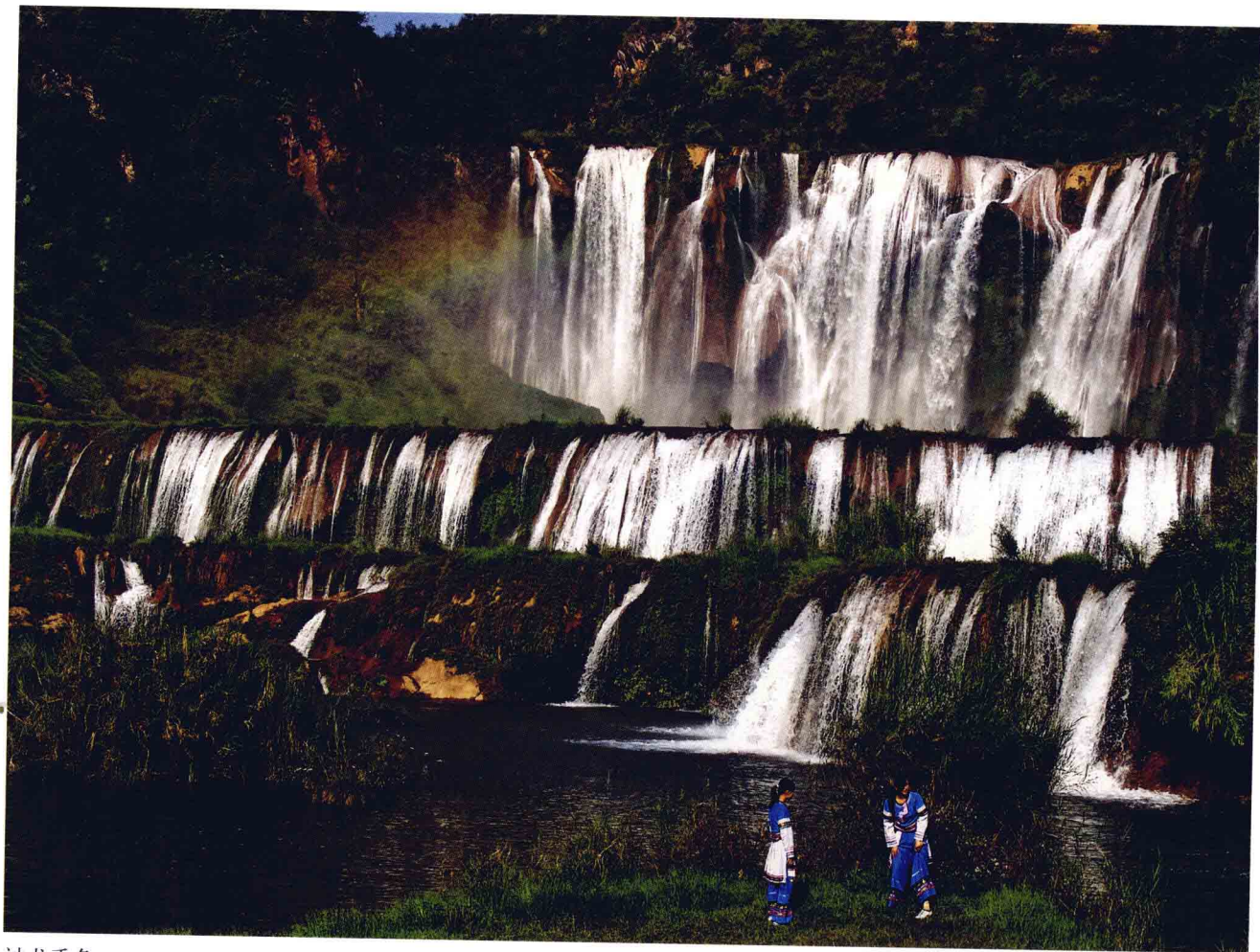
神龙秀色 Beauty of the divine dragon