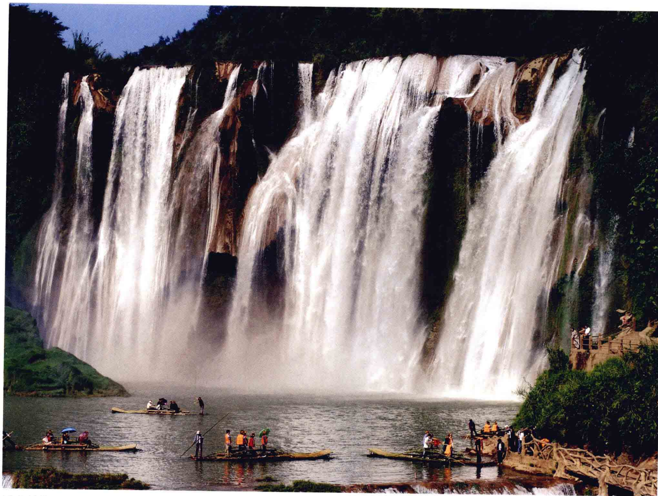
神龙放筏 Rafting of the divine dragon