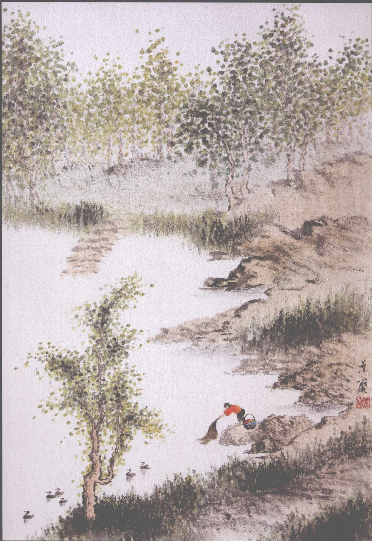
江南春韵 The Charming Spring in Jiangnan 68×48cm