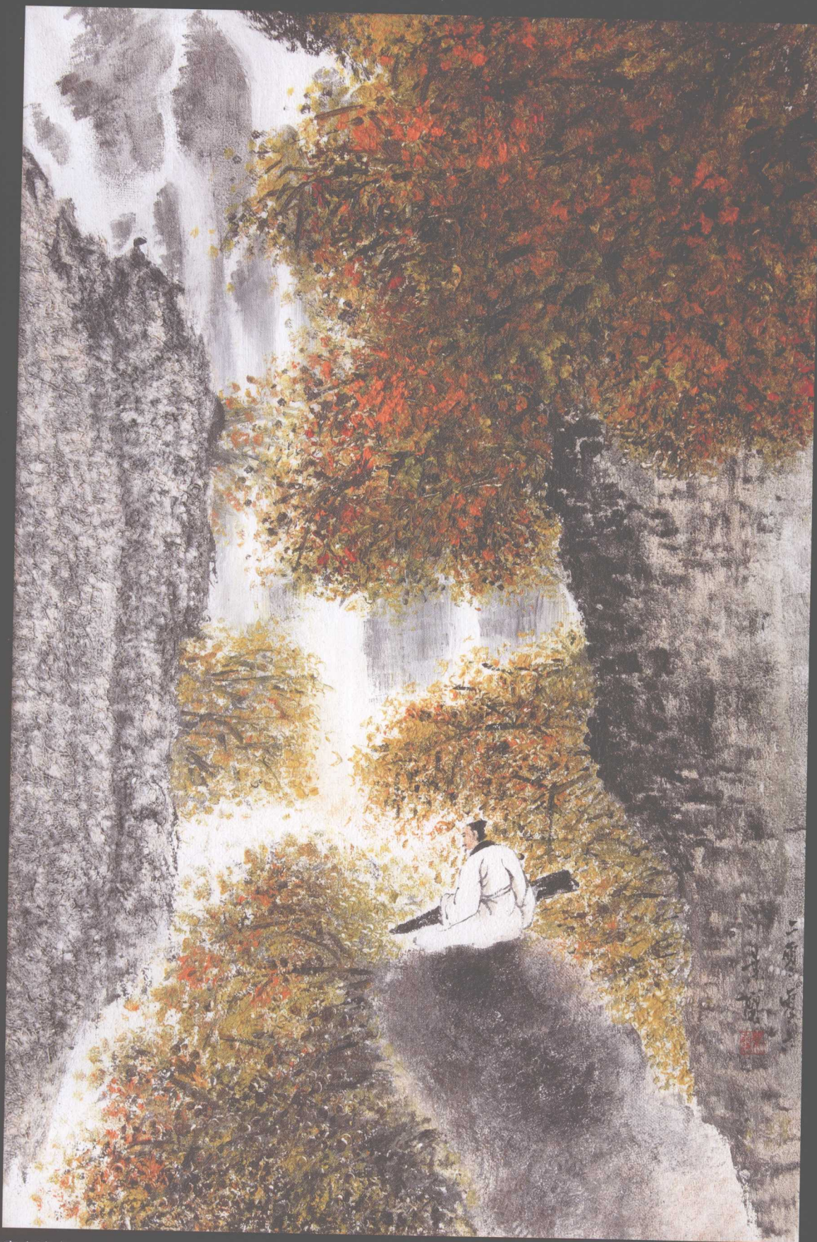
高山流水 A Mountain Stream 68×48cm