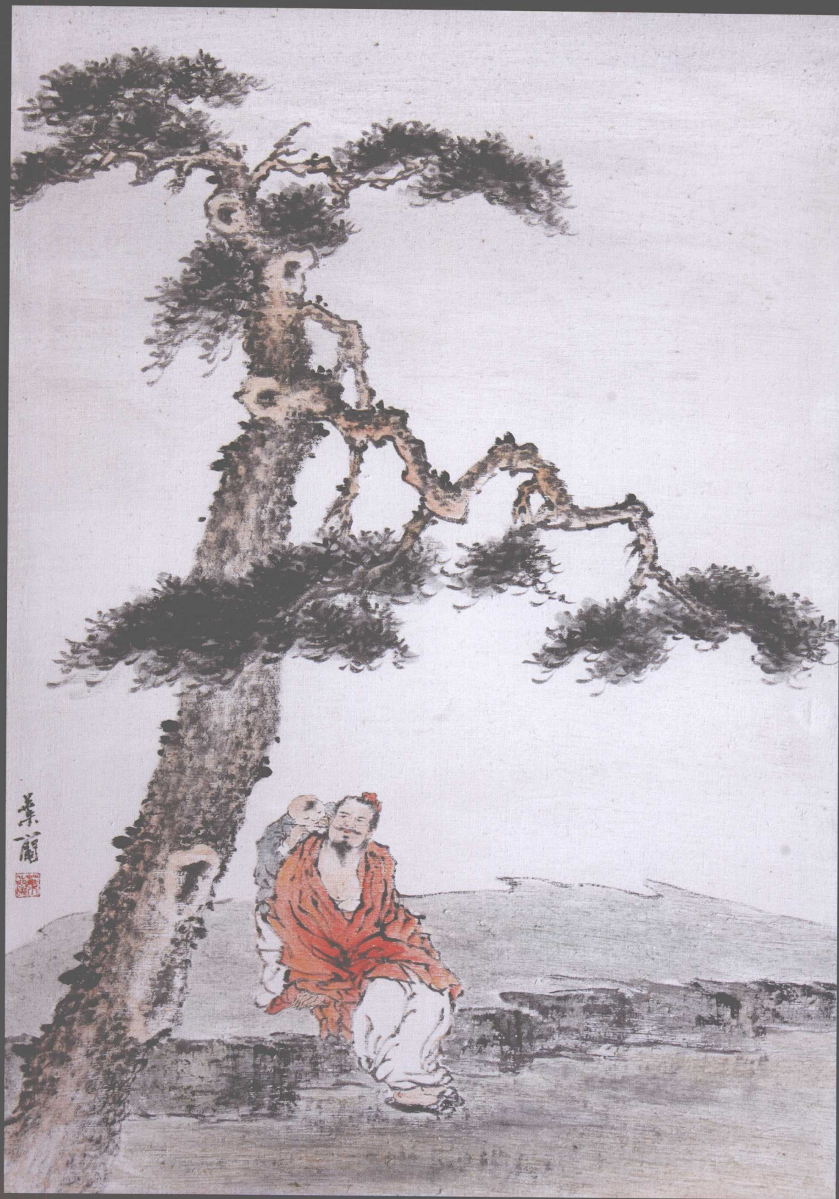
春趣图 Spring's Fun 68×48cm