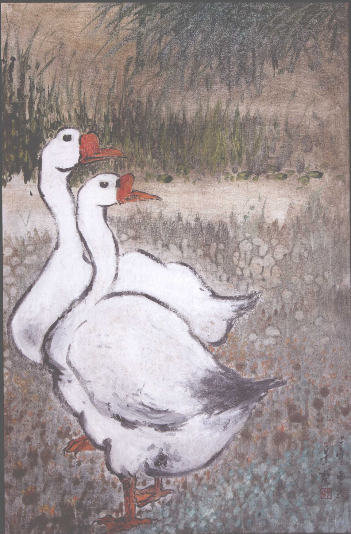
双鹅图 Two Geese 68×48cm