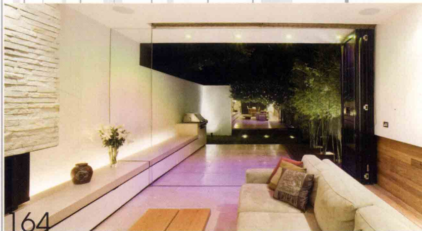
198 Benedict Canyon Residence, California Griffin Enright Architects