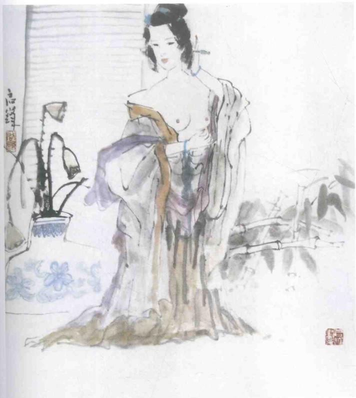
仕女 Lady 68cm × 68cm