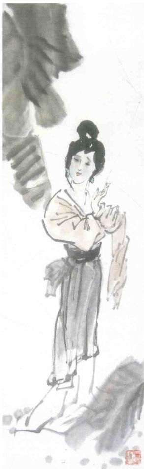
苗圃仕女 Lady by the Platoon 34cm x 80cm