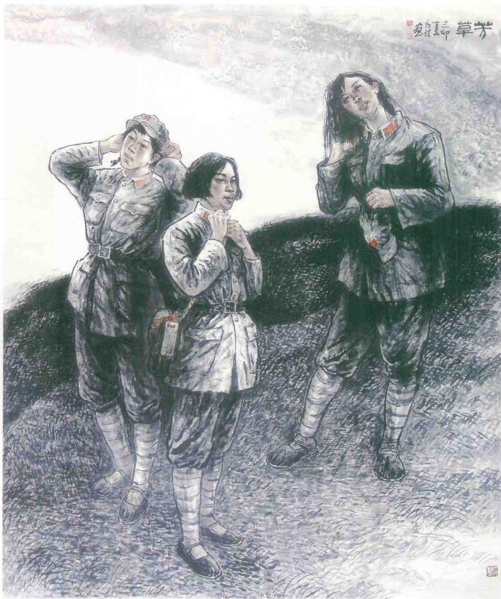
芳草 Splendor in Grass 150cm × 180cm 获江西省第十一届美展二等奖