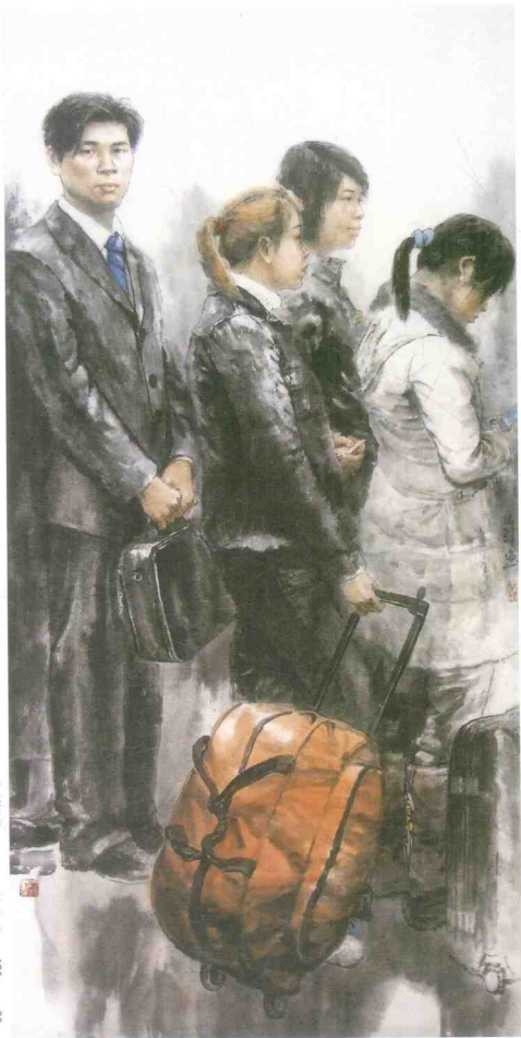
春天约会 A Date with Spring 180cm x 90cm