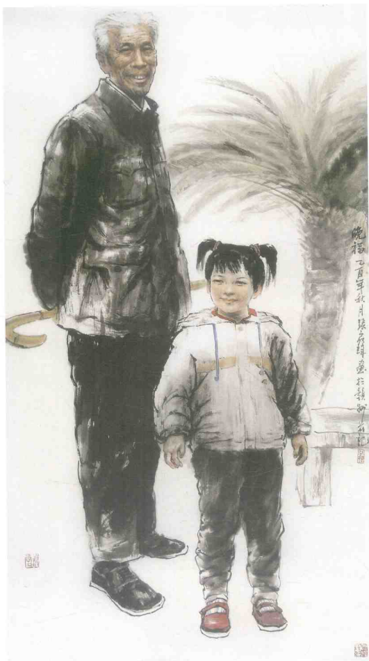
晚福 Bliss 180cm x 97cm