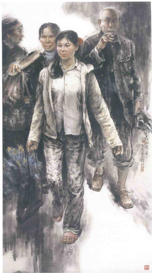
春到赣南 Coming Spring in Gannan 180cm x 97cm