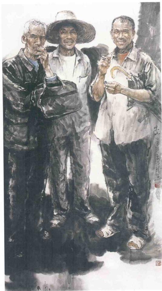
田山 Out of the Mountain 180cm x 97cm 入选「长江」全国中国画提名展