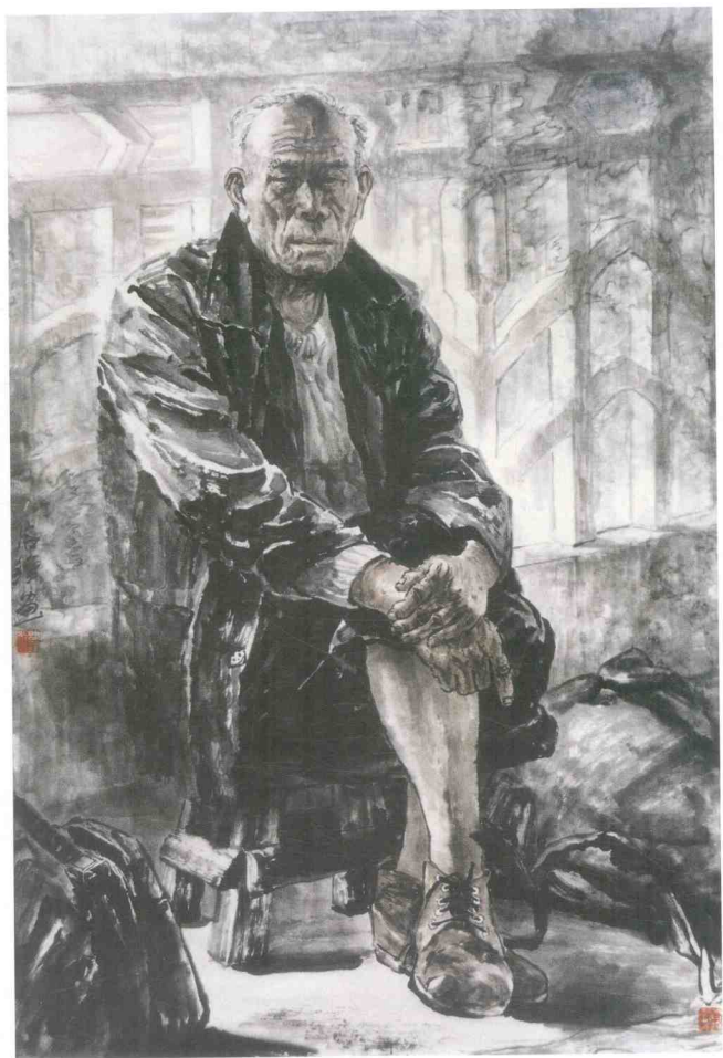
徐晓都 Old Cousin 150cm × 97cm 入选2004年全国中国画展