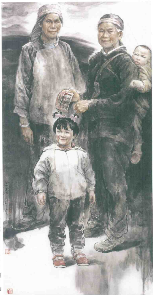
陈彦彦 早期春天 Early Spring in Ganna 180cm x 97cm