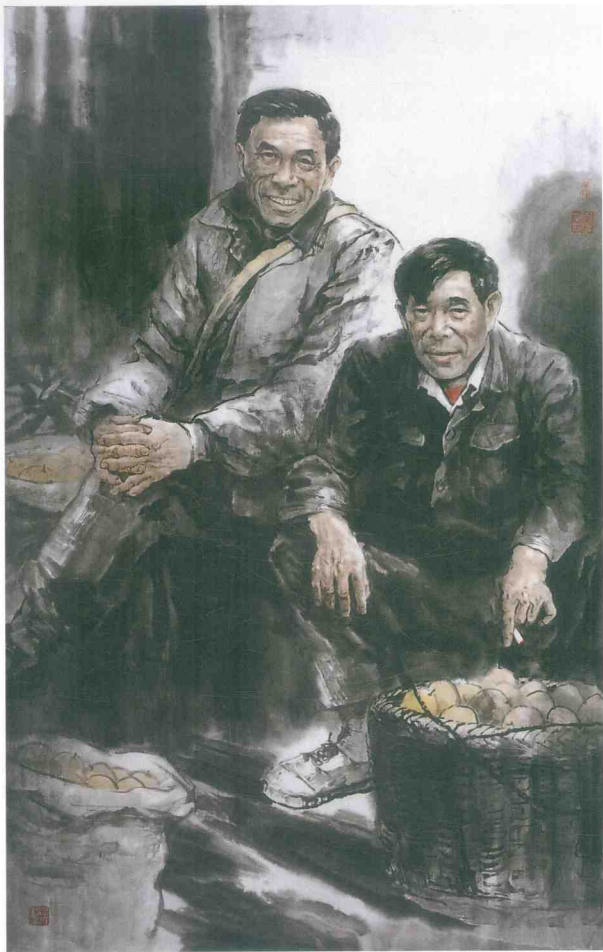
樊南 樊南 樊南 Market Day of Gannan 180cm x 97cm 入选「太湖情」全国中国画提名展