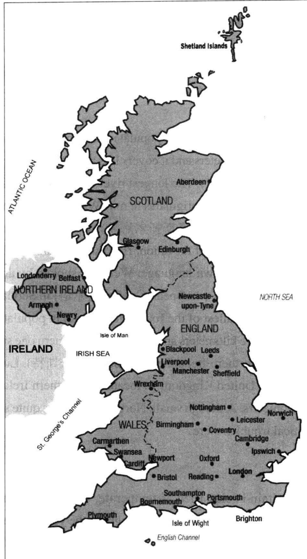
Map of the United Kingdom of Great Britain and Northern Ireland 注

注：本书内所有地图均经过国家测绘局地图技术审查中心审核，审图号为：GS (2007) 771号。