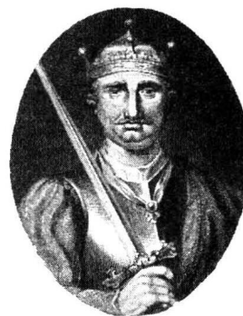
William the Conqueror

In the early part of this period, French, spoken by the Normans, replaced English as the official language in England, while English was only used by the lower class. Numerous French words came into the English vocabulary. One interesting phenomenon was that the animals began to have different names from their meat because they were