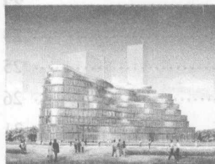
Buildings Covered with Plants