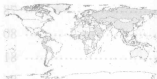
Bird Flu Broke Out in the World