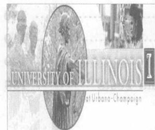
University of Illinois