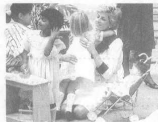
People's Princess Diana