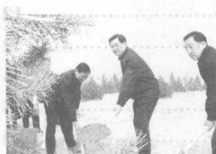
President Hu Is Planting Trees