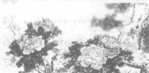
Chinese Painting: Peony Flowers