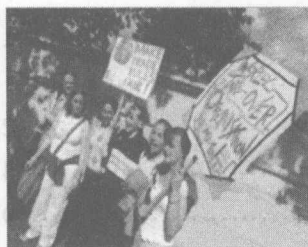
People Are Calling for Fair Trade