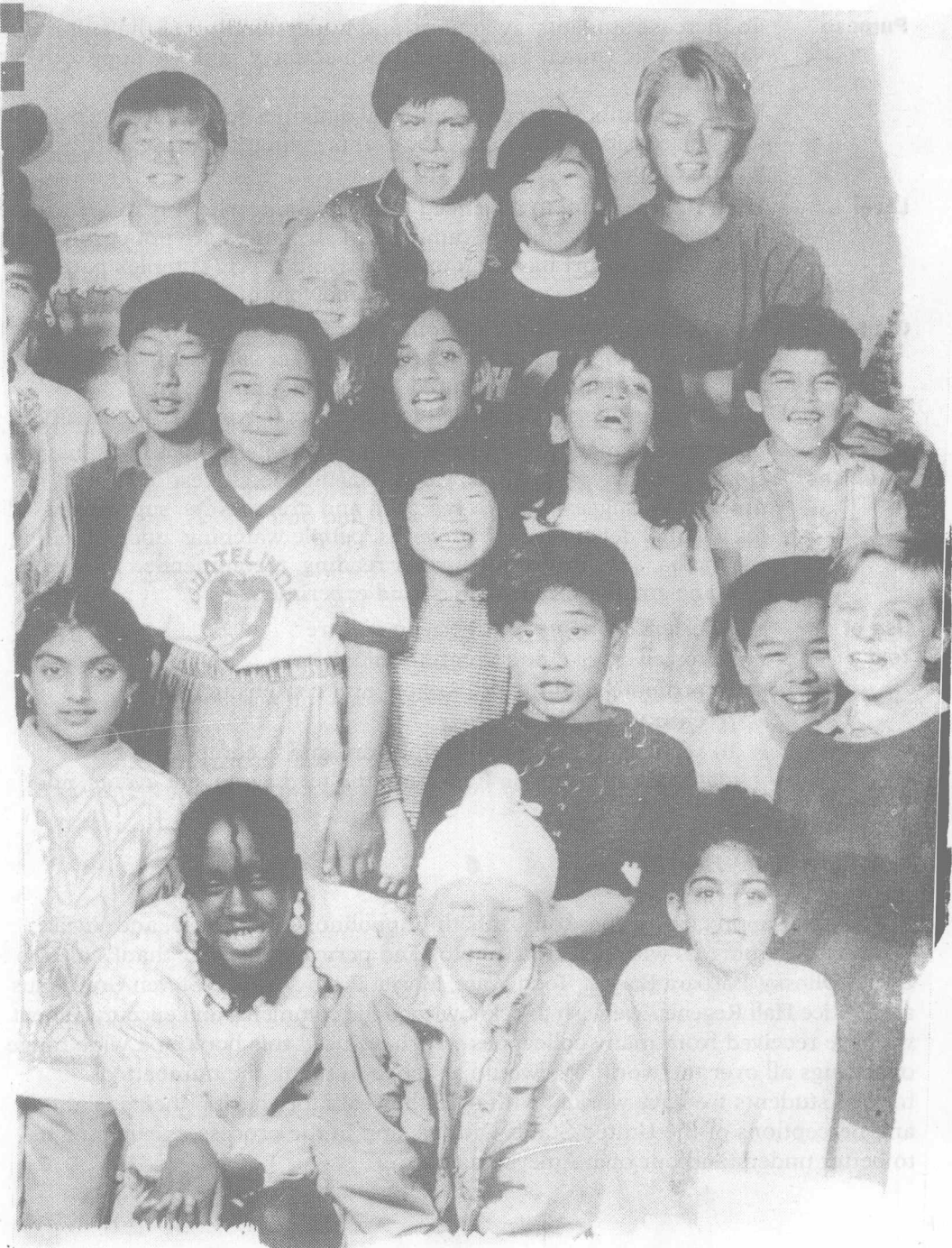
American mosaic: Beyond the "melting pot"