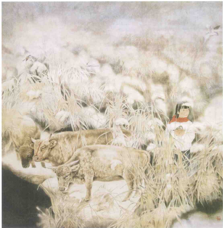
家园 Homestead 170cm × 170cm