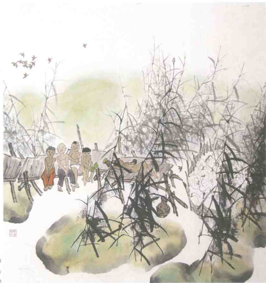
十里闻鸭声 Hearing Duck from Ten Li Away 95cm × 95cm