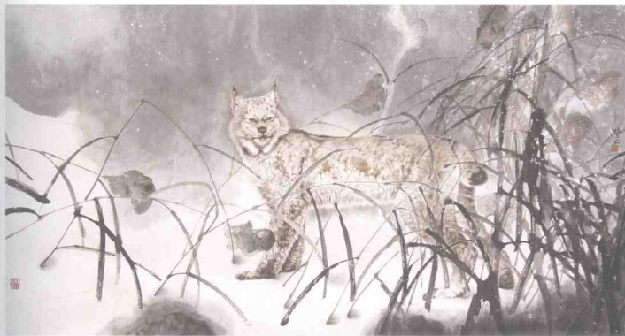
残雪 Unmelted Snow 96cm × 182cm