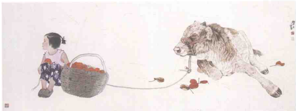
秋歌 Spring Song 67cm × 182cm

With a special interest in oxen, Liu Xuemin has created different images of oxen that are either working or taking a leisure time, but all looking very vivid with a sense of human touch and honesty. The loyalty of oxen and the fact that that are always determined to work for human beings without asking for payback just symbolize the characters of the artist as being benign, mild, tolerant and sincere. He has undergone frustrations and obstacles on the path in pursuit of art, but not once did any trouble weaken his enthusiasm at art. Rather, troubles only made him stronger and more energetic. Therefore, there is no affectation to be found in his works, but only frankness and simplicity that elicit truth and beauty. With his gift and diligence, he will sure be able to have an even broader sky of his own in the colorful Chinese art circles.