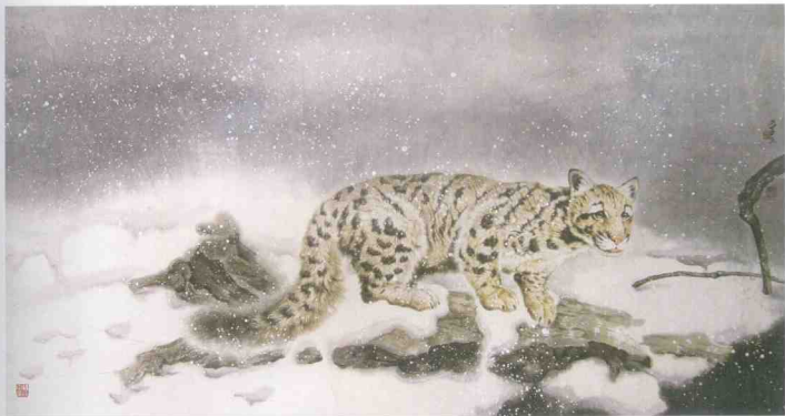
寒凝大地 Frozen Land 95cm × 186cm