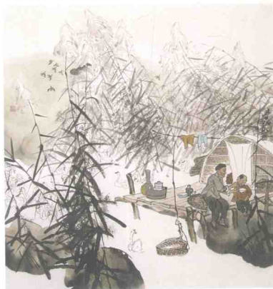
家居天水间 96cm × 96cm