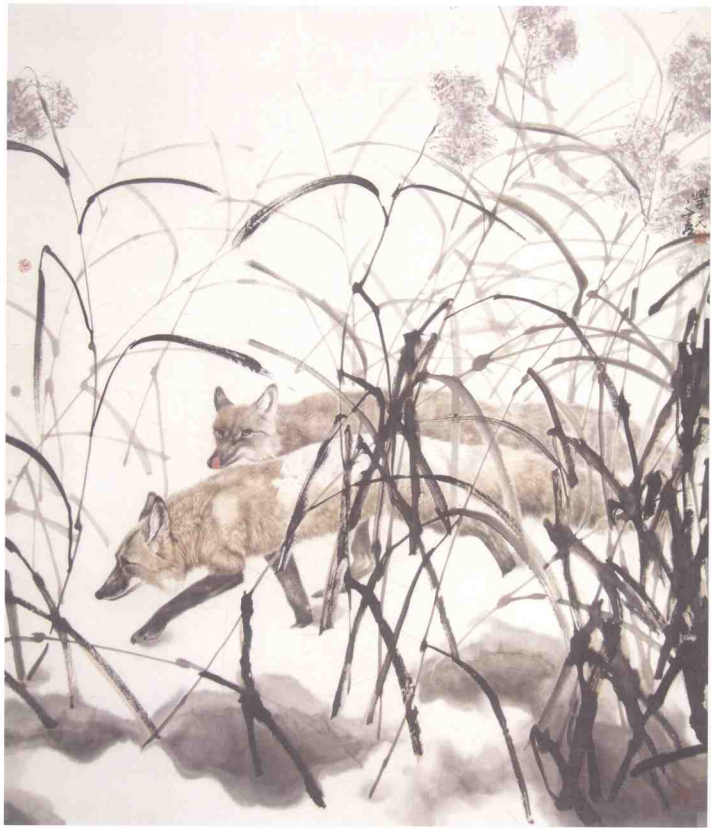
月痕 Moon Trace 105cm × 123cm