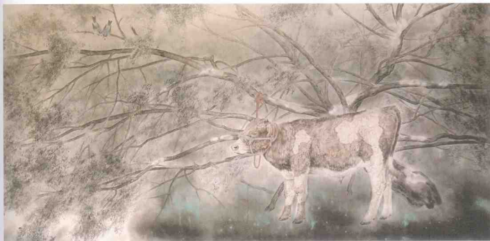
春风初起 Early Spring Breeze 123cm × 238cm