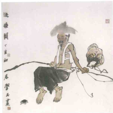
渔乐图 Pleasure of Fisherman 68cm × 68cm