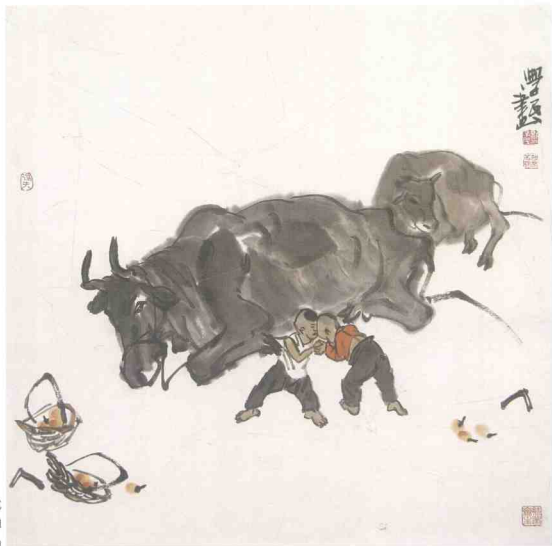
童子无忧 Carefree Child 68cm × 68cm