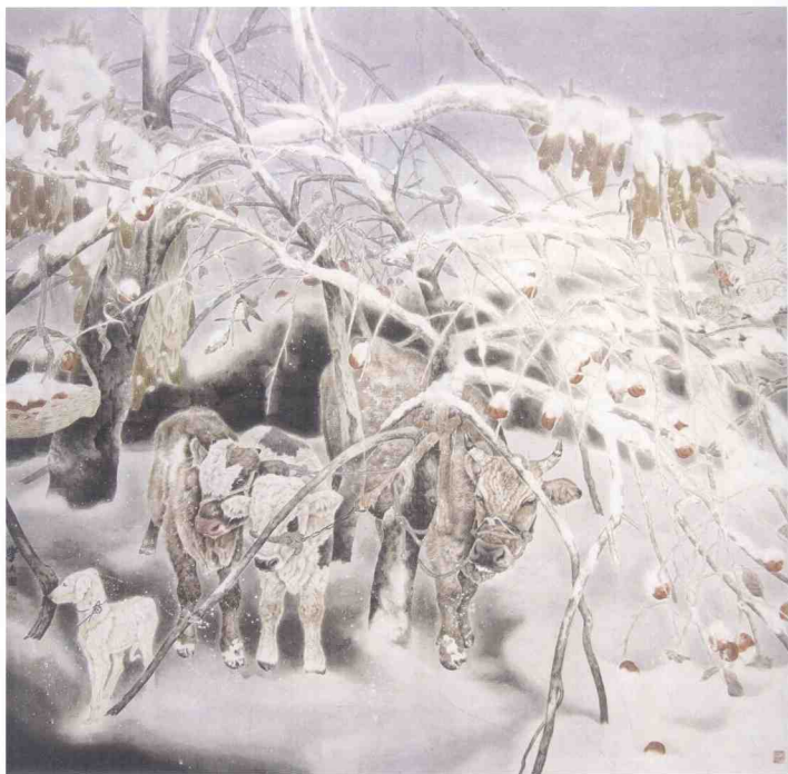
冬 Winter 180cm × 178cm