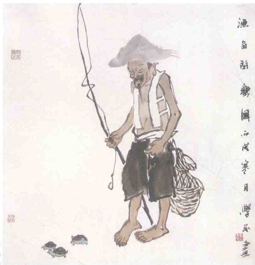
渔翁闲乐图 Pleasure of Fisherman 68cm × 68cm