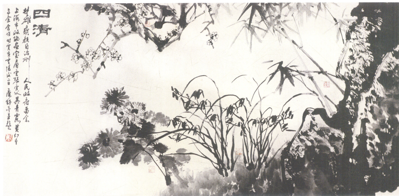
● 当代著名画家唐云、应野平、黄幻吾、张雪父、吴青霞 楚雄题画