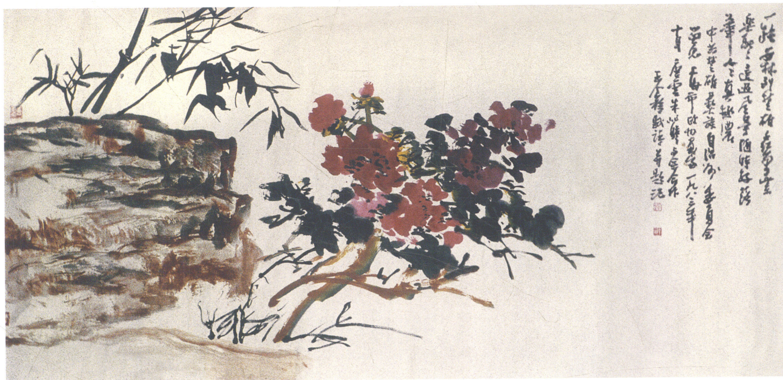
● 当代著名画家朱屺瞻、唐云、王个簪 楚雄题画