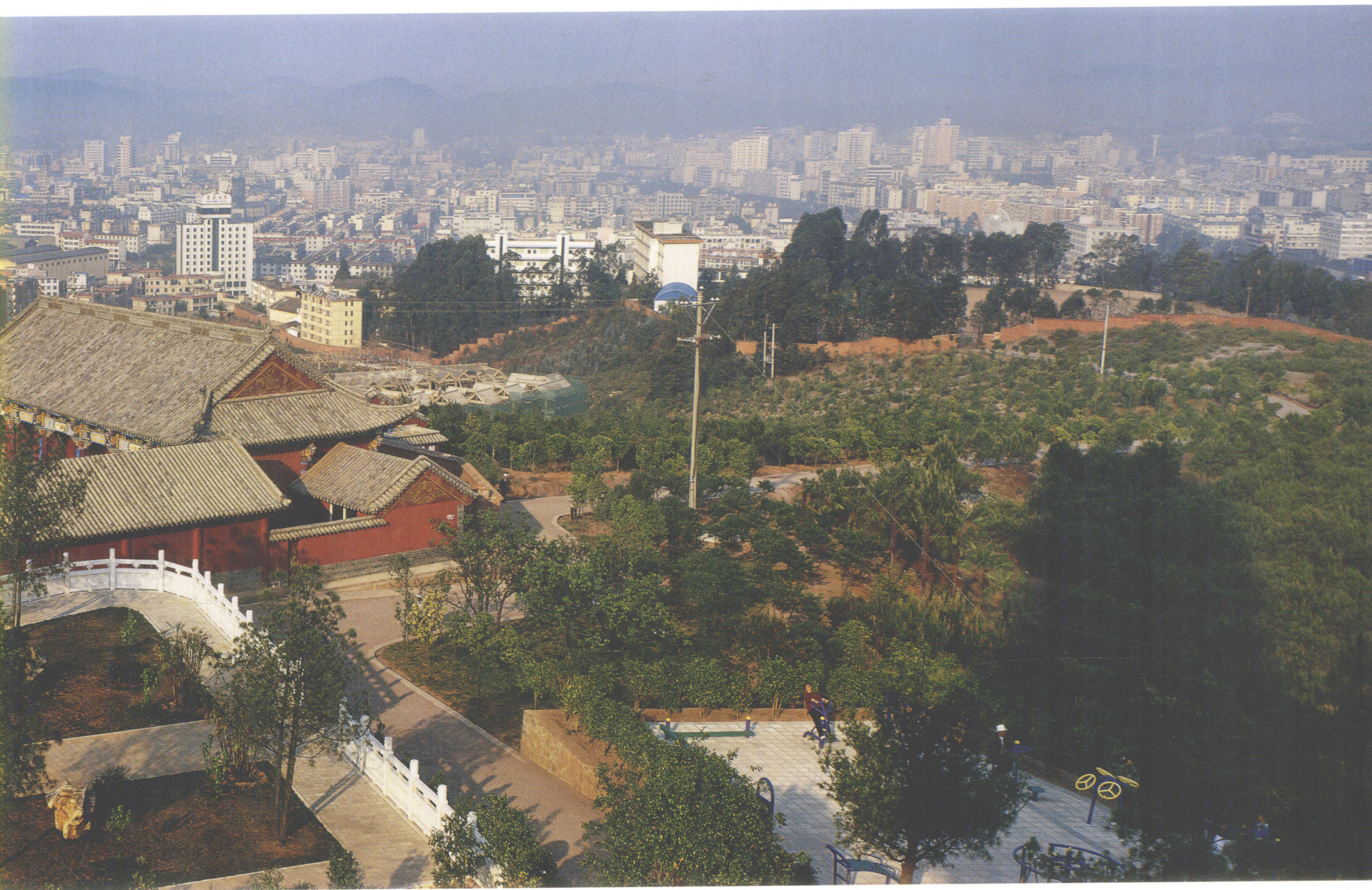
● 云南省楚雄彝族自治州地处滇池、洱海之间，自古为省垣屏障，滇中走廊，川滇通道。东西最大横距 175 公里，南北最大纵距 247.5 公里，乌蒙山虎踞东部，哀牢山盘亘西南，百草岭雄峙西北，构成三山鼎立之势。金沙江、元江水系形成二水环流之态，境内多山，素有“九分山水一分坝”之称。图为楚雄彝族自治州州府所在地。