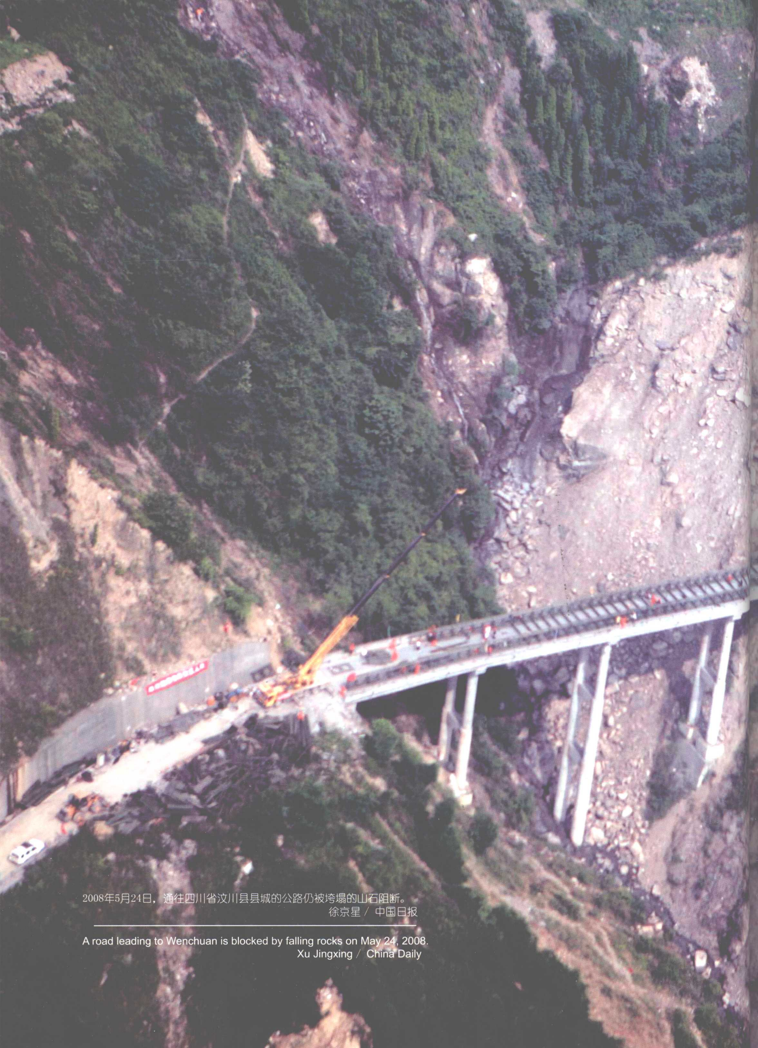
2008年5月24日，通往四川省汶川县县城的公路仍被垮塌的山石阻断。

A road leading to Wenchuan is blocked by falling rocks on May 24, 2008.