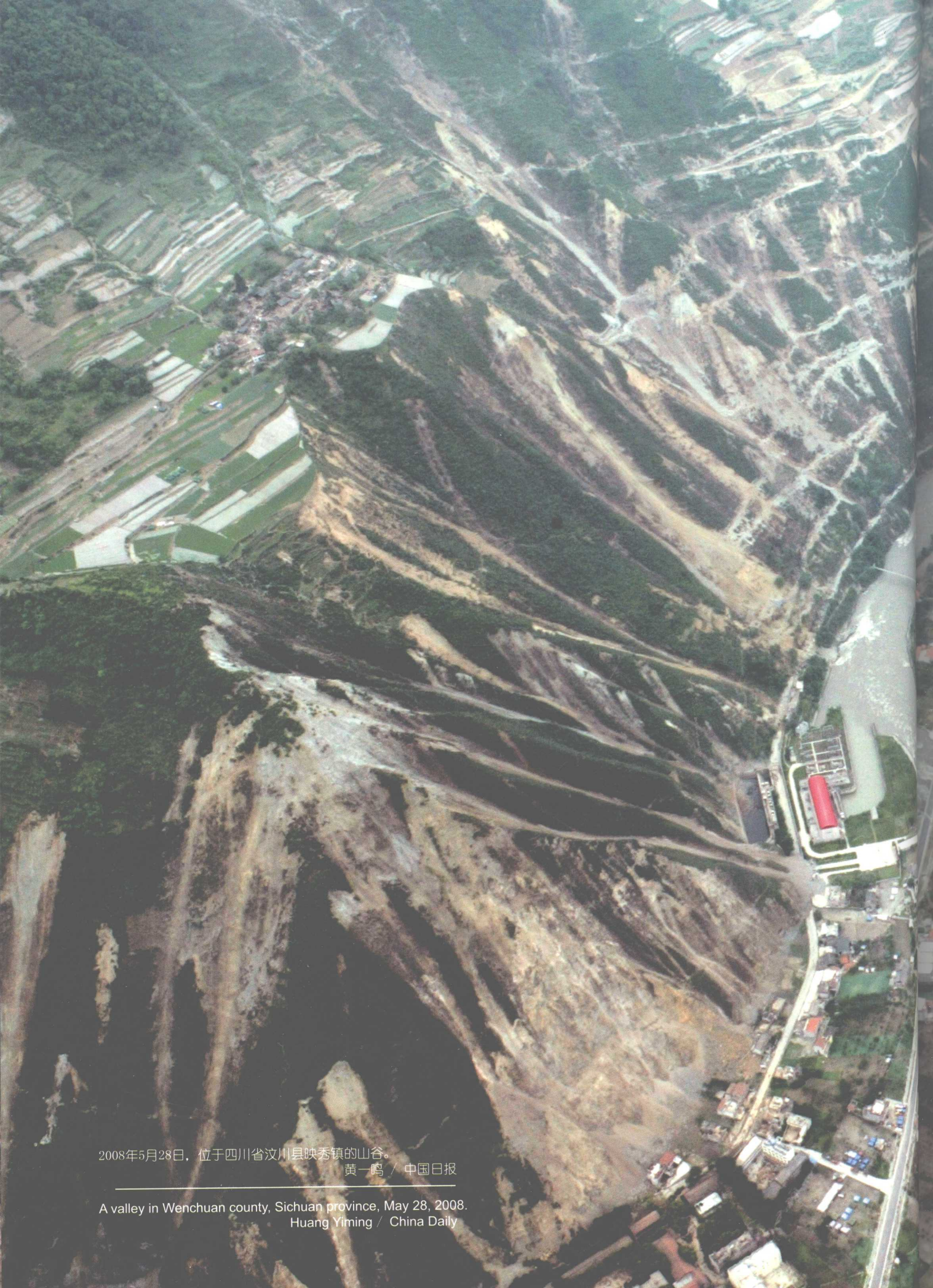
2008年5月28日，位于四川省汶川县映秀镇的山谷。

A valley in Wenchuan county, Sichuan province, May 28, 2008.