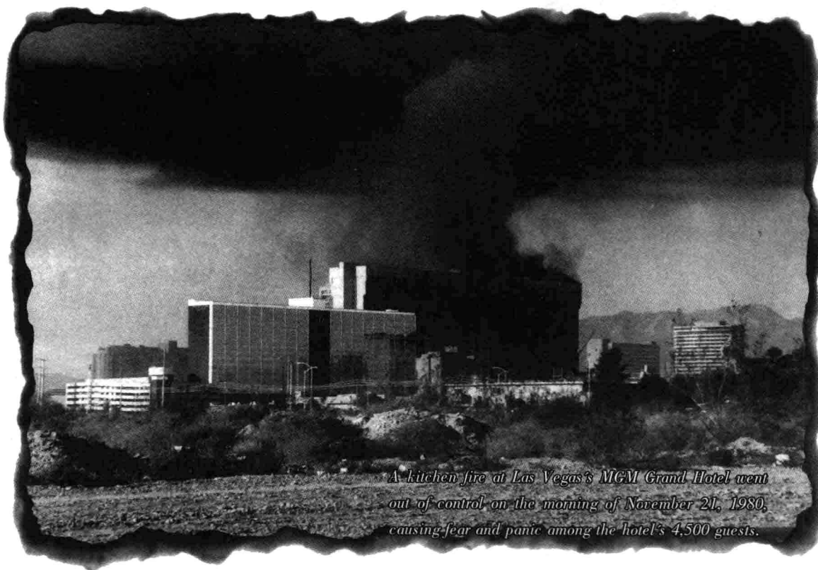
A kitchen fire at Las Vegas's MGM Grand Hotel went out of control on the morning of November 21, 1980, causing fear and panic among the hotel's 4,500 guests.