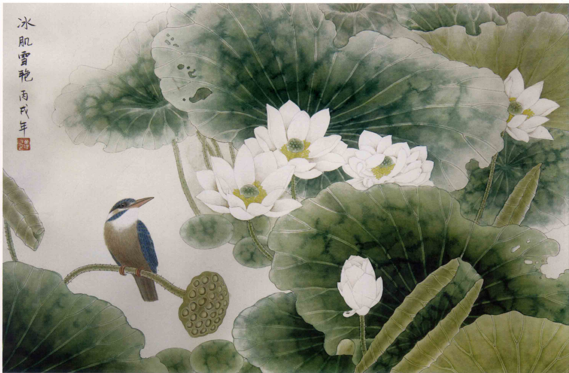
冰肌雪艳 A Bird and Lotus