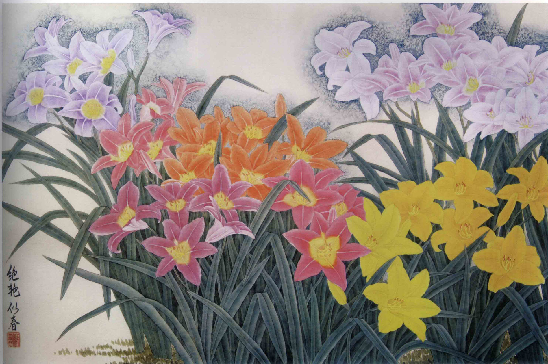
绝艳似春 The Picture of Day lily