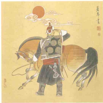
黄驃马 Strong Horse 68cm × 68cm