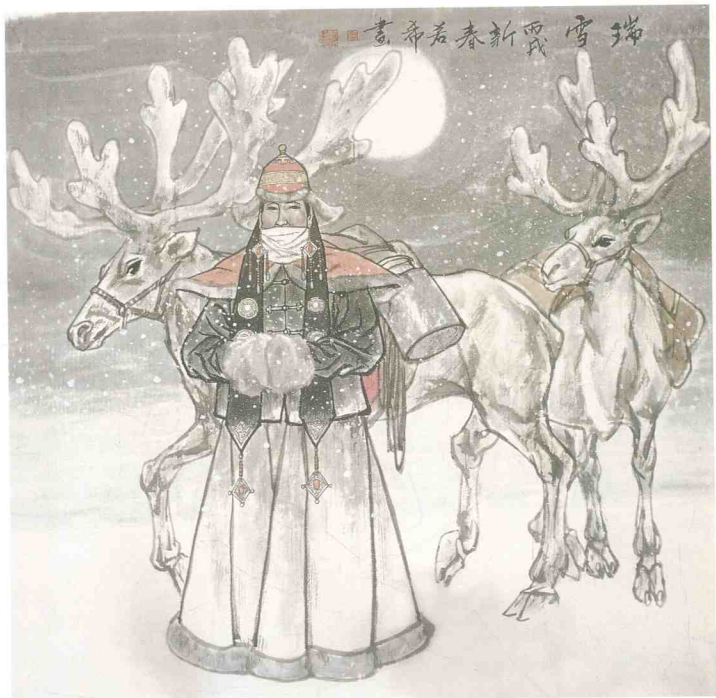
瑞雪 Timely Snow 100cm × 100cm