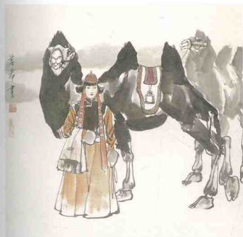
驼乡情 Region of Camels 68cm × 68cm