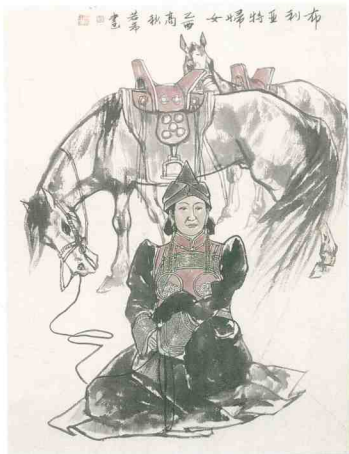
布利亚特妇女 Women of Bu Li Ya Te 100cm × 90cm