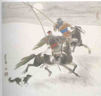
马杆子 Horse Pole 92cm × 92cm