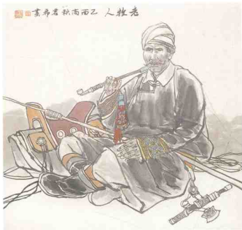
老牧人 Old Shepherd 68cm × 68cm