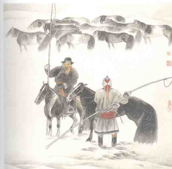
阿都沁 Shepherd 92cm × 92cm