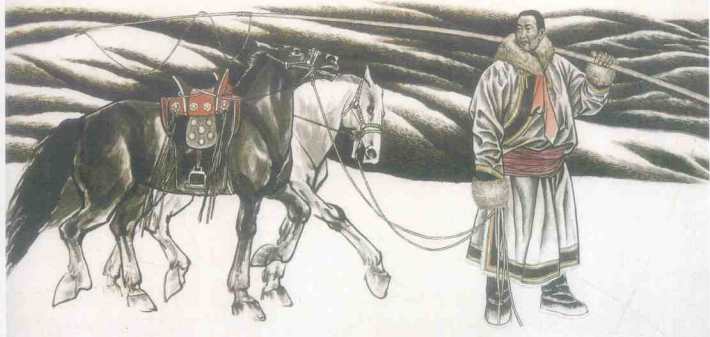
乌珠穆沁三月 March in Wu Zhu Mu Qin 96cm × 180cm