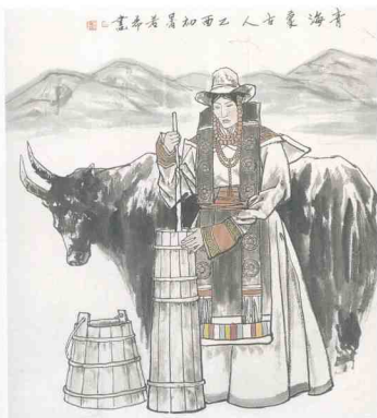
高原蒙古人 People on the Mongolian Plateau 100cm × 95cm