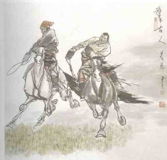
赛马图 Horse Race 68cm × 68cm