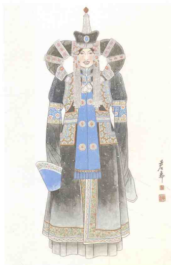
喀尔喀盛装 Attire 105cm × 65cm