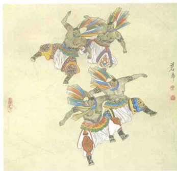
雄鹰展翅 Eagle Flying 68cm × 68cm