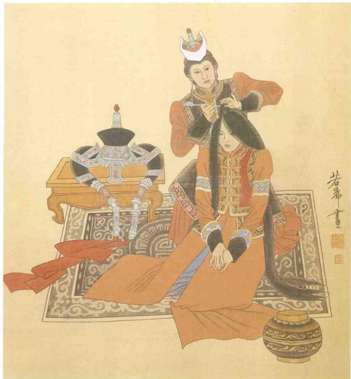
梳妆图 Dressing Up 72cm × 68cm