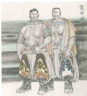
双雄图 The Powerful 100cm × 95cm