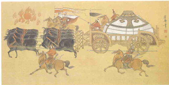
出征图 Going out for Battle 92cm × 126cm