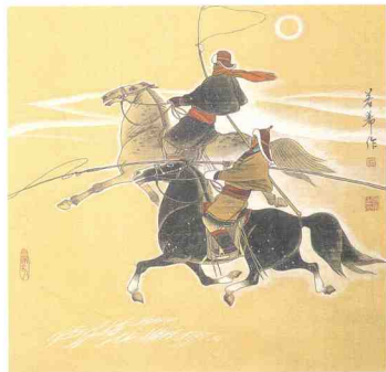
乌珠穆沁人 Mongolians 68cm × 68cm