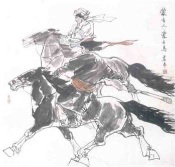
蒙古人 蒙古马 Mongolian and Horse 100cm × 100cm