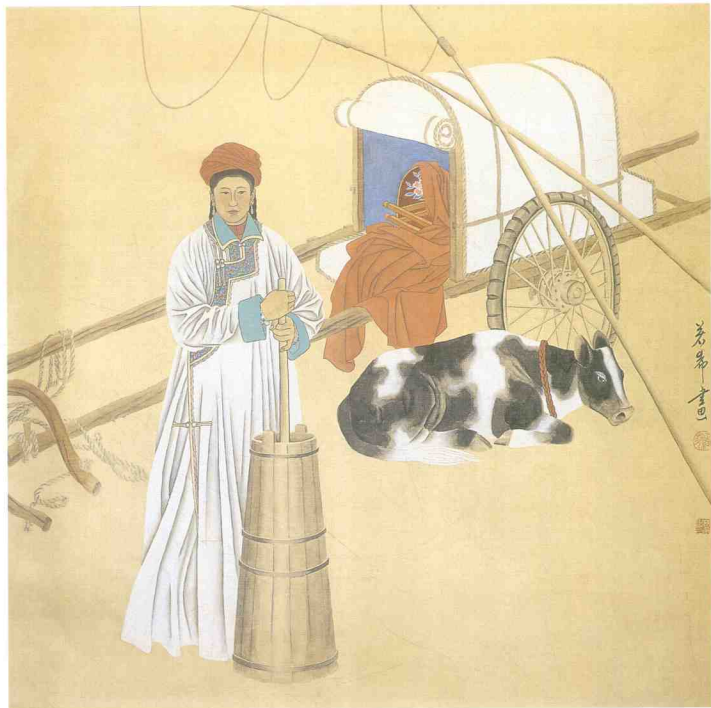
吉祥·乌珠穆沁 Good Luck 120cm × 120cm