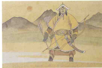
成吉思汗的童年 (连环画选页) Young Genghis Khan 38cm × 26cm × 4