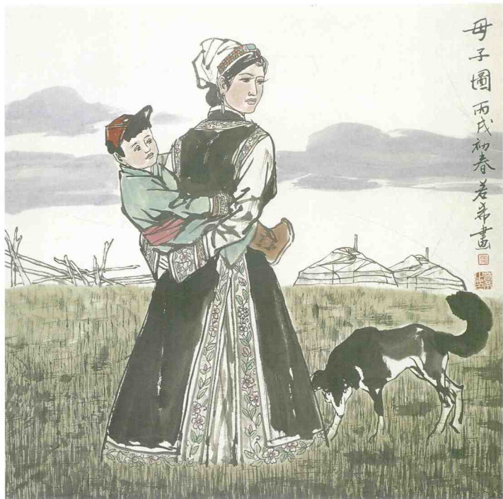
母子图 Mother and Son 68cm × 68cm