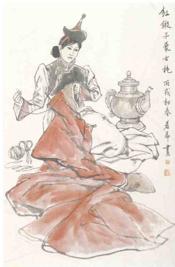
红缎子蒙古袍 Red-silk Mongolian Robe 100cm × 68cm