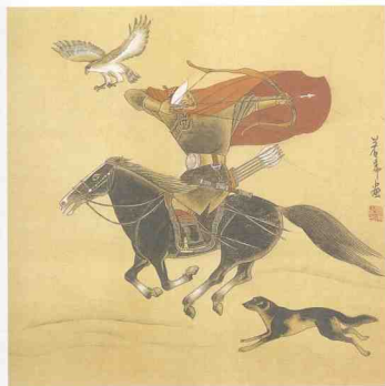
射箭图 Arrow Shooting 68cm × 68cm