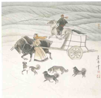
蓝色的蒙古高原 Blue Mongolian Plateau 92cm × 92cm