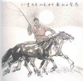
马背上的歌 Song on the Horse Back 100cm × 100cm