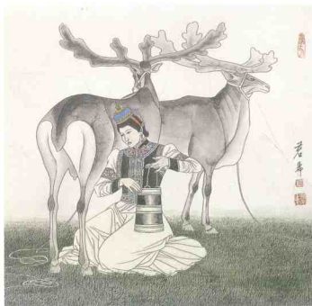
驯鹿人 Deer Tamer 92cm × 92cm