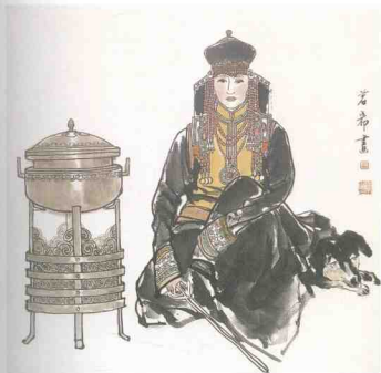
察哈尔妇女 Women of Cha Ha Er 68cm × 68cm