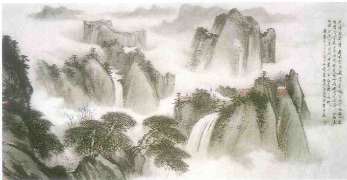
山中飞瀑图 Waterfall in the Mountain 70cm × 138cm