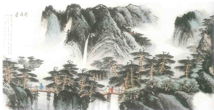
行吟图 Traveling 70cm × 138cm