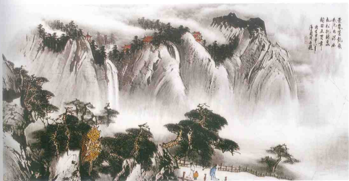
宋·程颢诗意图·秋 Song Dynasty · Poem by Cheng Hao · Autumn 96cm × 186cm