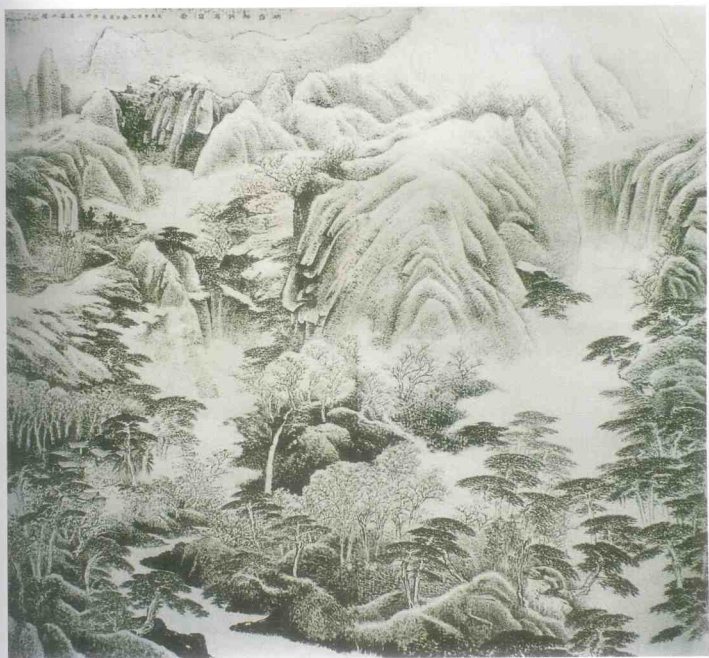
烟云神洲高洁图 Winter Mountain in Holy White 186cm × 210cm