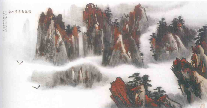
浩气长存黄山秋 Everlasting Beauty of the Autumn in Yellow Mountain 70cm × 138cm