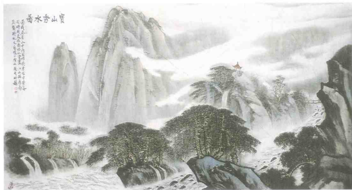
宝山秀水 Precious Mountain, Elegant River