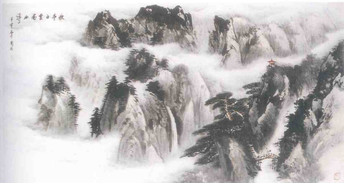
敬亭白云满山诗 Pavilion, Cloud and Poem 70cm × 136cm