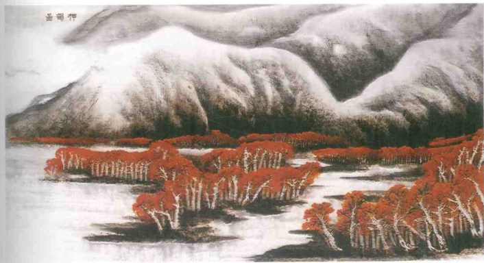
神韵图 Charm 96cm × 186cm