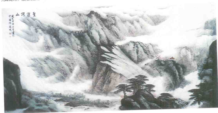
圣洁河山 Marvelous Land (2004 年为中南海怀仁堂绘制)