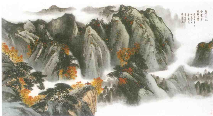
碧涧红叶图 Red Leaf, Green Water 96cm × 186cm