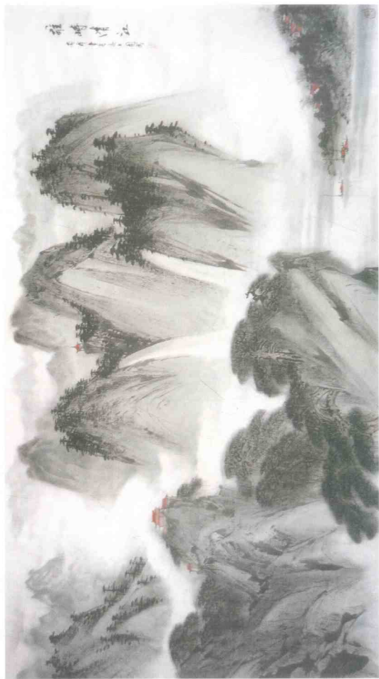
雄峙清江 Great River, Great Mountain 96cm × 180cm