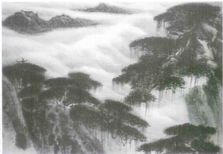
黄山松云 Pine Tree and Cloud of Yellow Mountain 60cm × 96cm