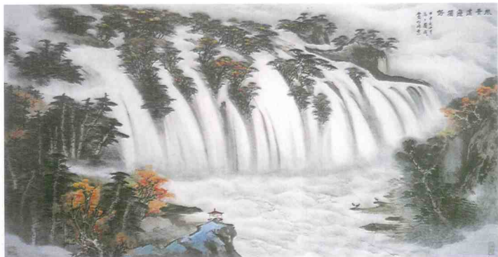
风景这边独好 The Scenery here is the finest 96cm × 186cm