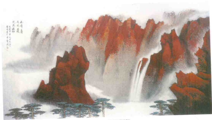
九峰高天外 霞光满山红 Nine Peaks in red sunglow (2004 年为中南海怀仁堂绘制)