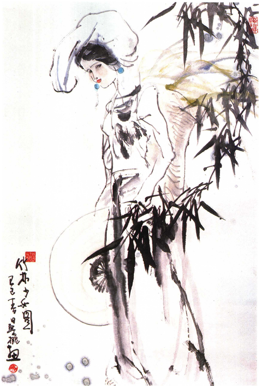
竹林少女 A Girl in Bamboo Groves.