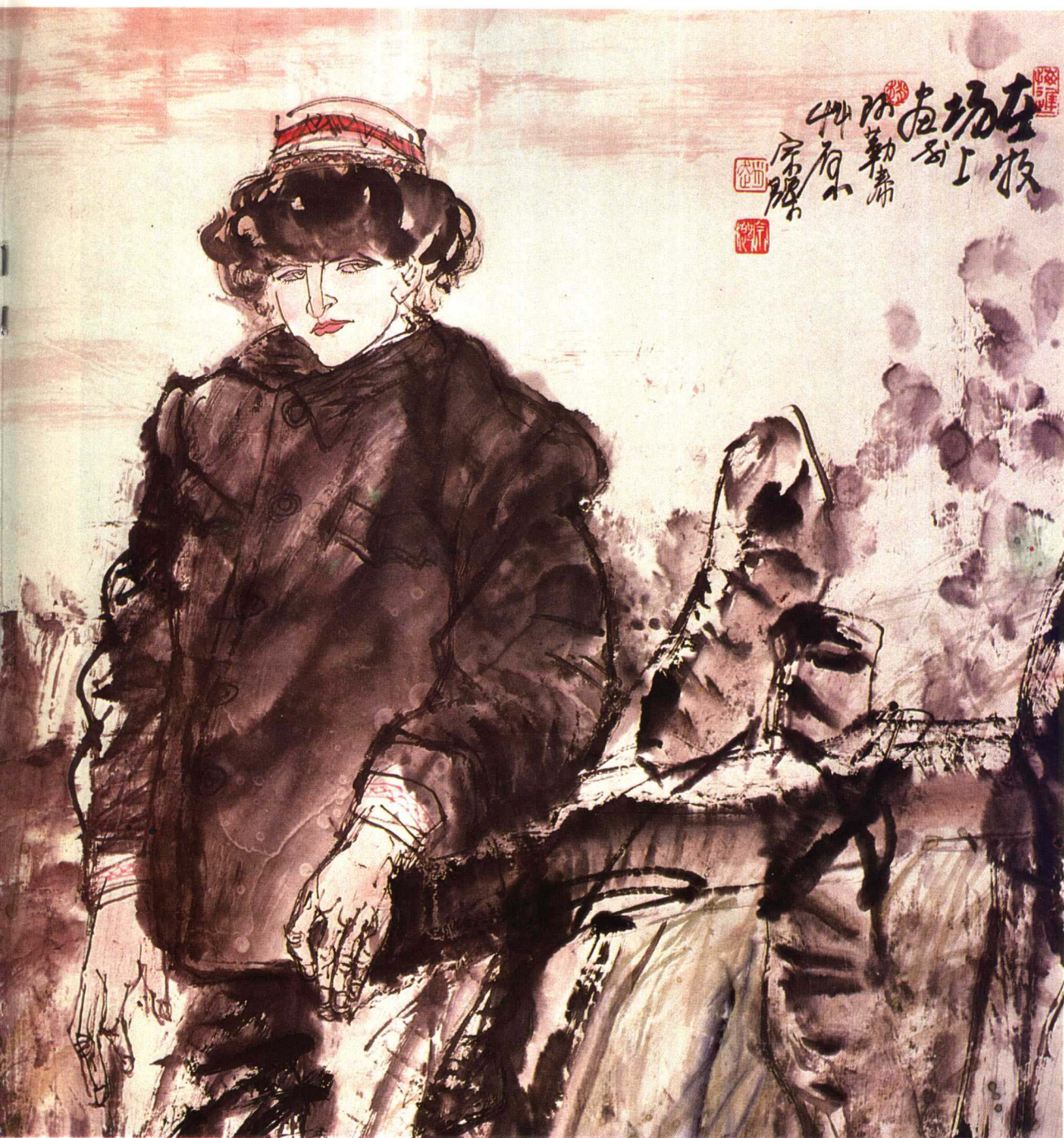
在牧場上 On the Pastureland.