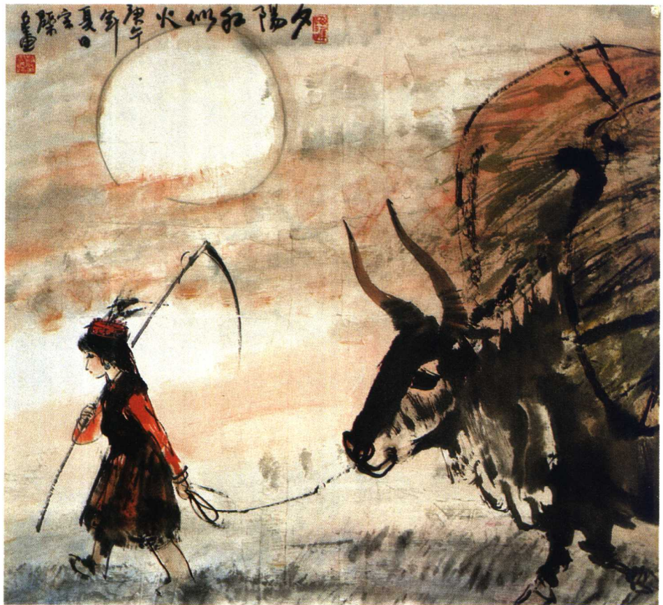
夕陽紅似火 Fiery Evening Glow.