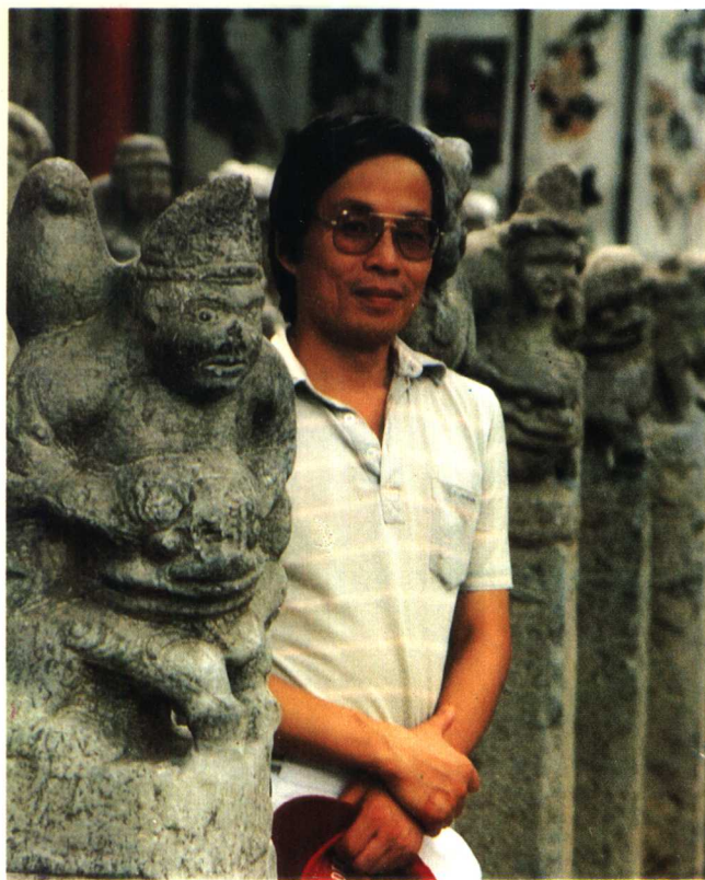
畫家像 Zhao Zonggai