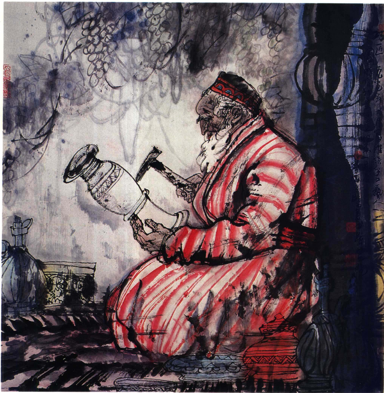
巧匠 Skillful Craftsman.