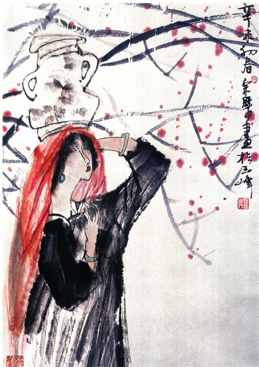
頂罐女 The Woman with a Jar on the Top of her Head.