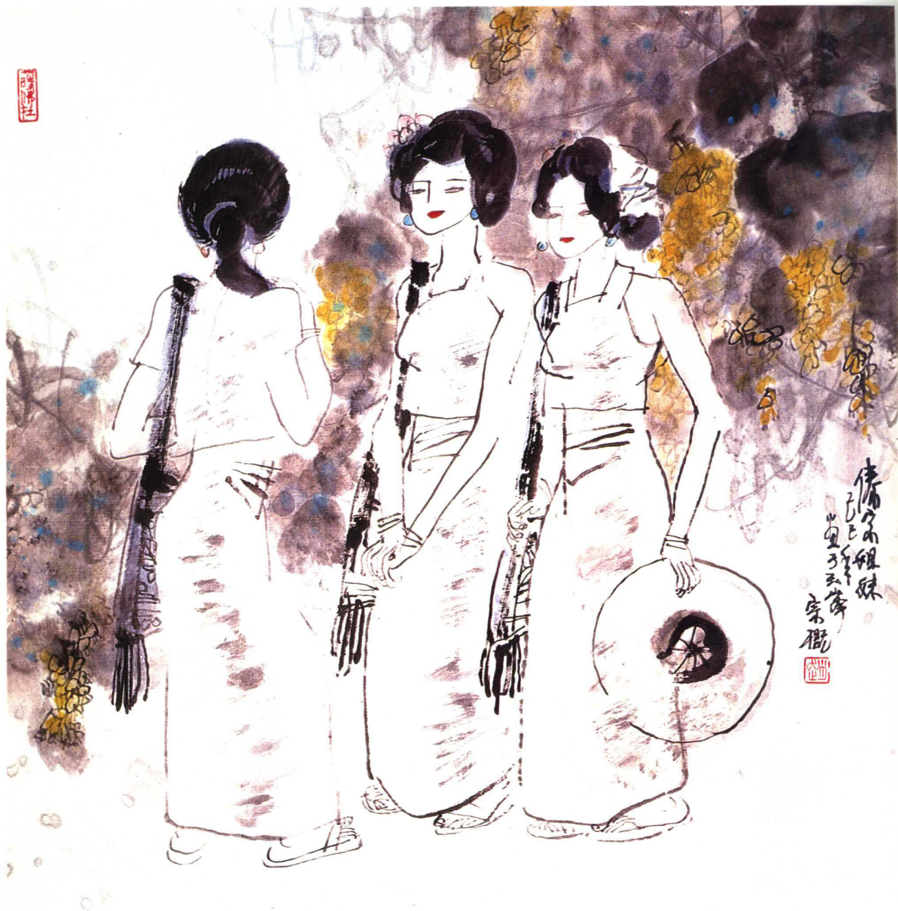
傣家姐妹 Dai Sisters.