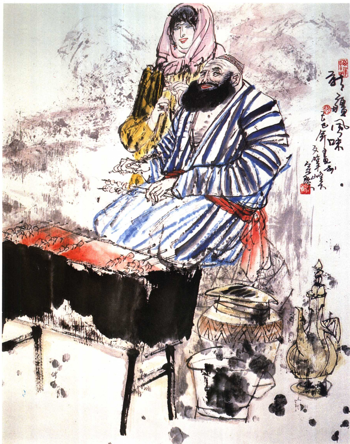
新疆風味 Xinjiang Flavor.