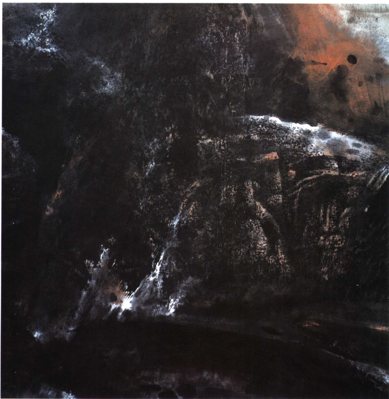
積墨山水 (19.5×19.5cm) 1991年 Landscape.