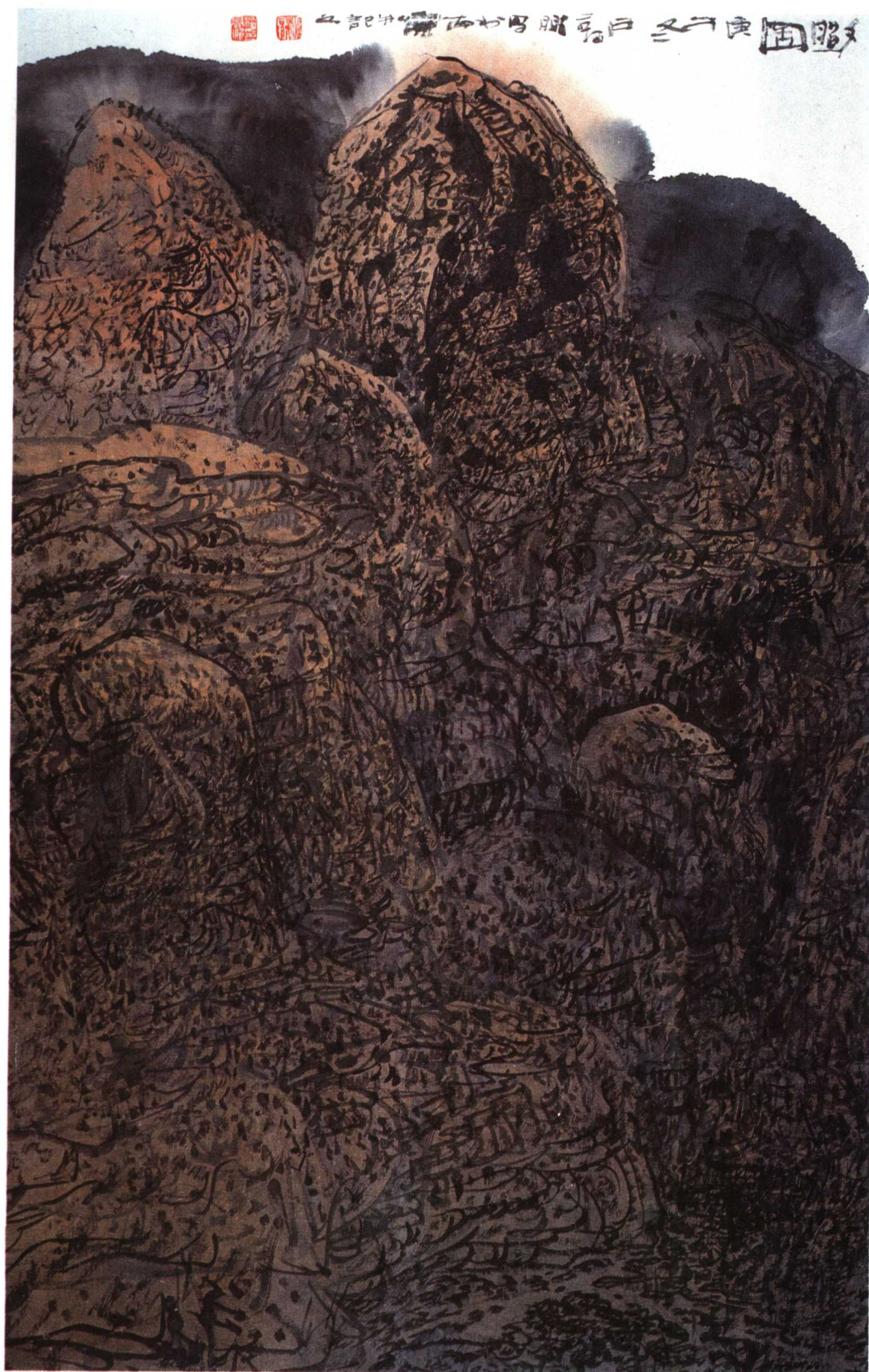
夕照圖 (17×26 cm) 1990年 Evening Glow.