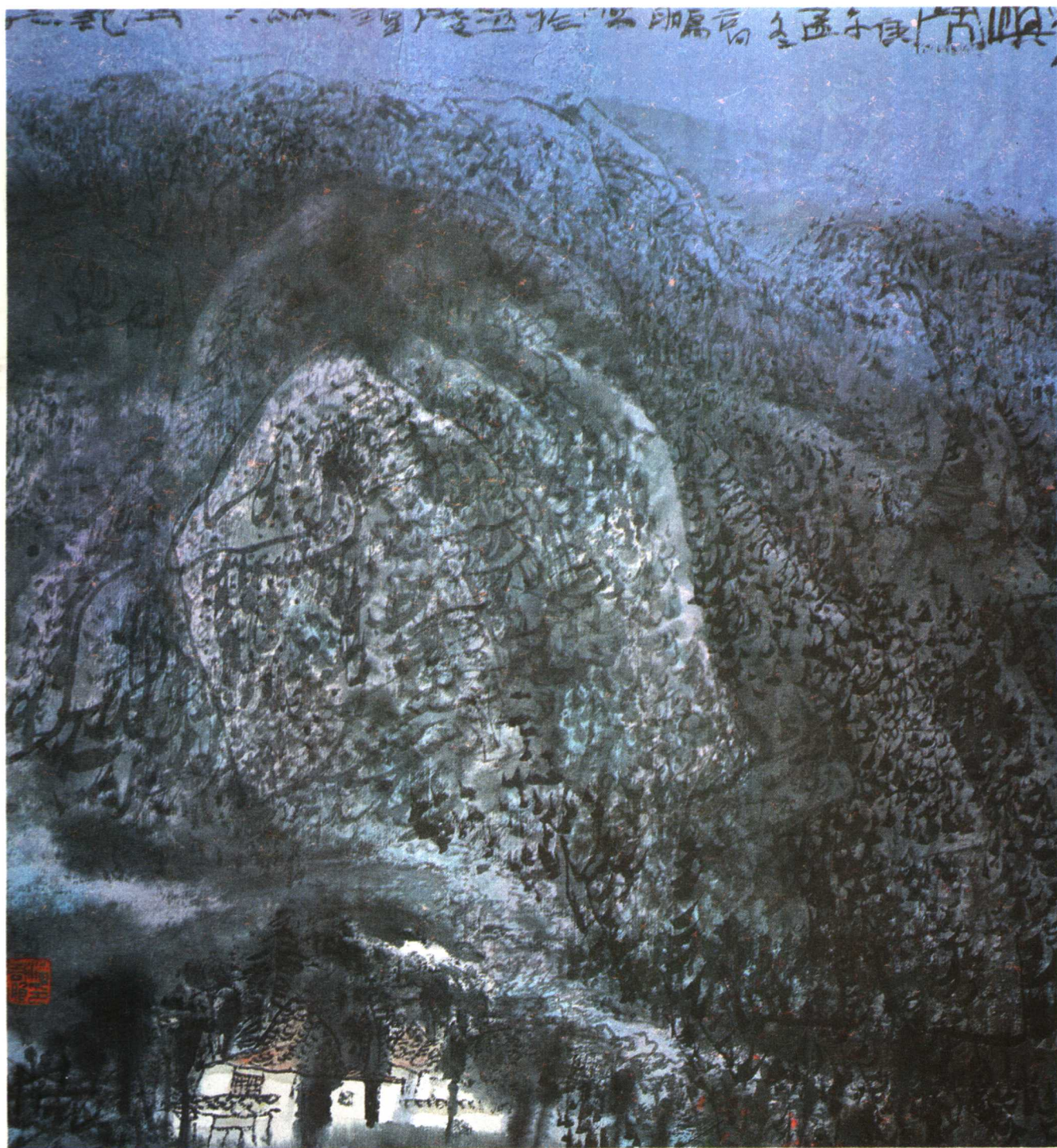
晨興圖 (19.5×20cm) 1990年 Delight in the Morning.