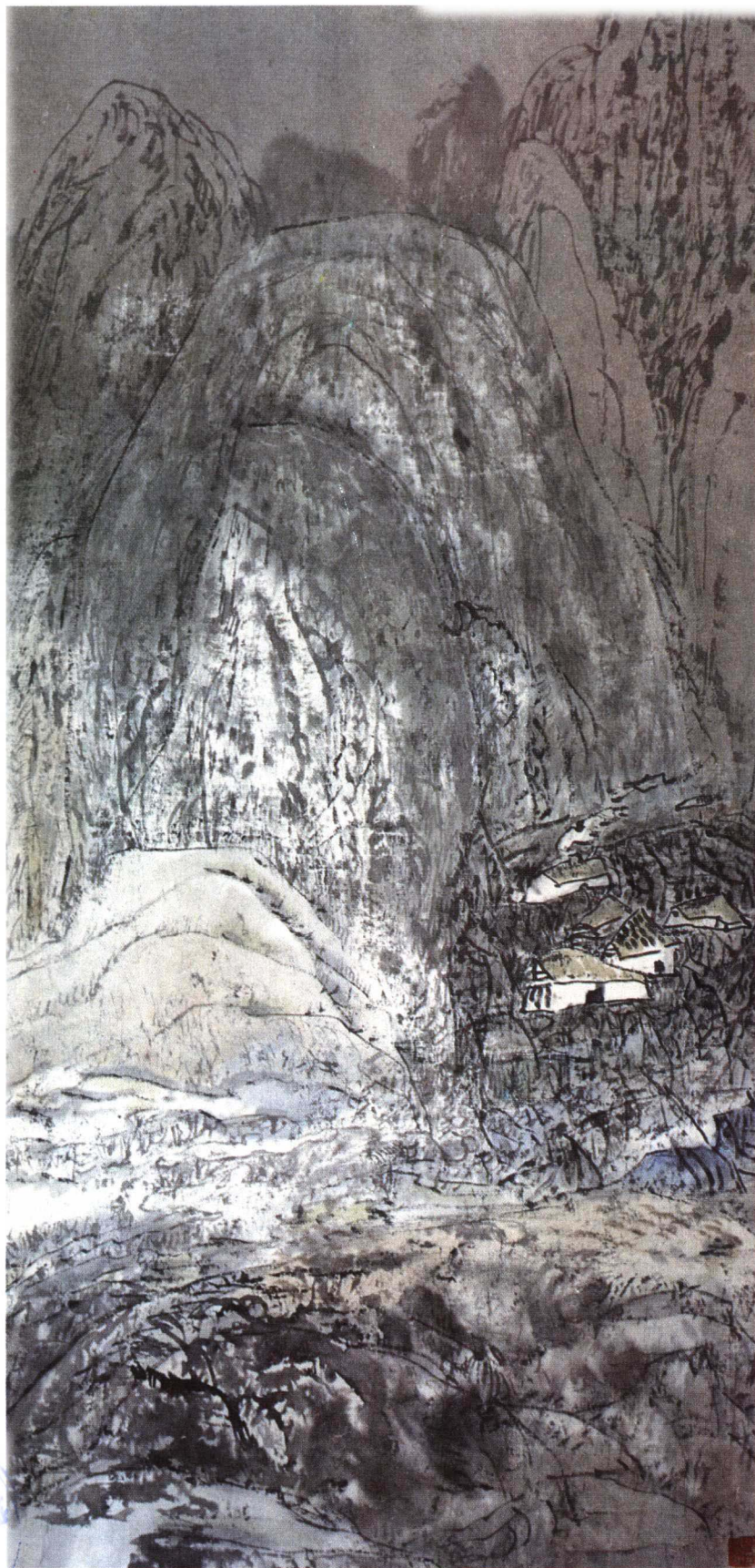
春山積雪圖 (13.8×26cm) 1990年 Spring Mountain.