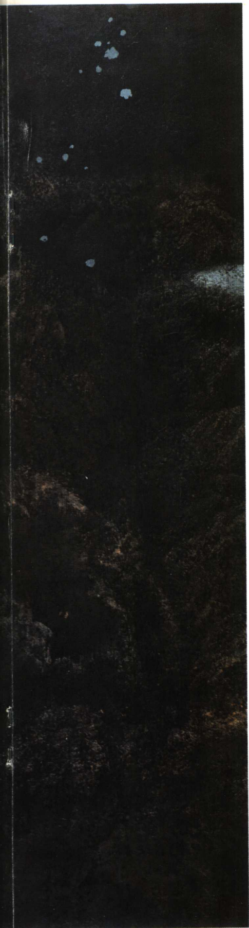
千秋雪 (25.7×26cm) 1991年 Snow.