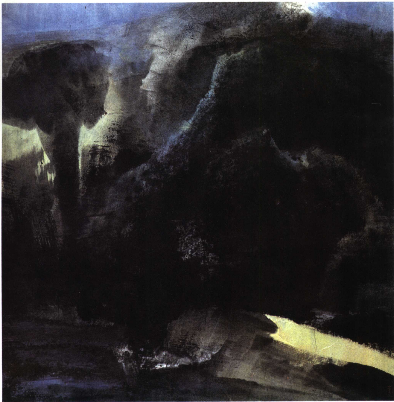
山韵 (19.5×19.7cm) 1991年 Mountain Mood.