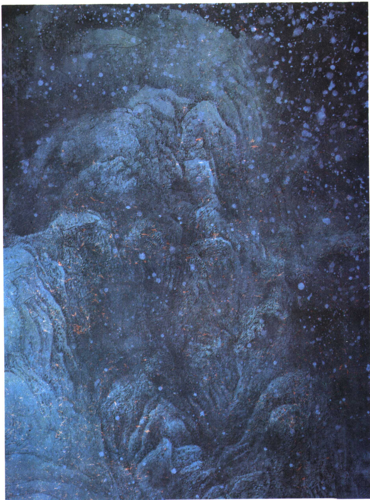
瑞雪 (18.9×26cm) 1991年 Timely Snow