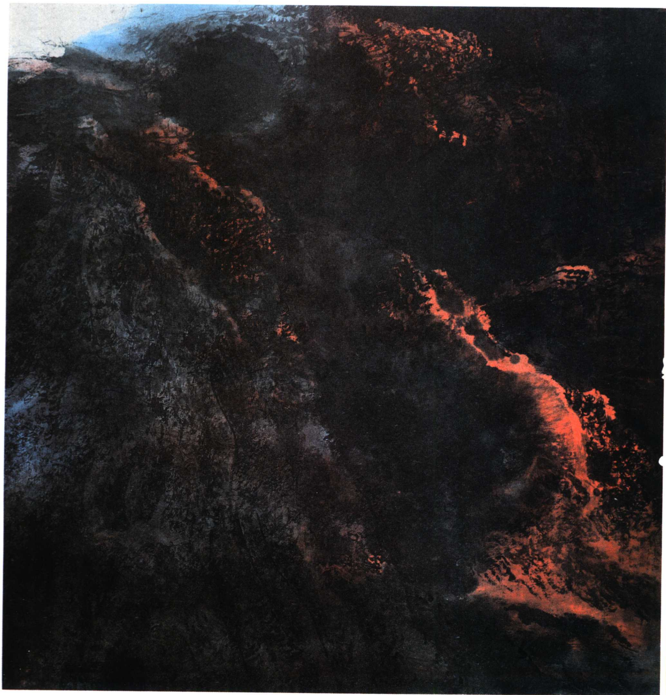
山谷初曉 (19.5×19.5cm) 1991年 Mountain Valley Before Dawn.