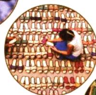
草编 Straw crafts