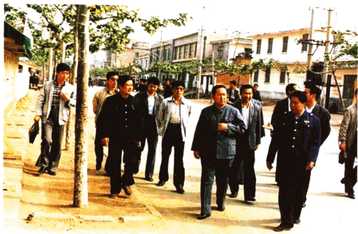
原山东省委书记姜春云（前右二）来郯城指导工作 Jiang Chunyun (second right front), former Secretary of Shandong Provincial CPC Committee inspects Tancheng.