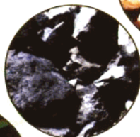
煤矿 Coal mine