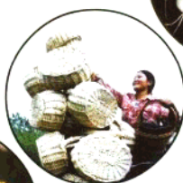
柳编 Willow articles