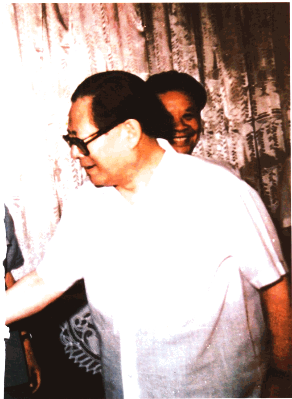
g Committee of the People's Congress of Tancheng County and General Manager of Tanhua Group.