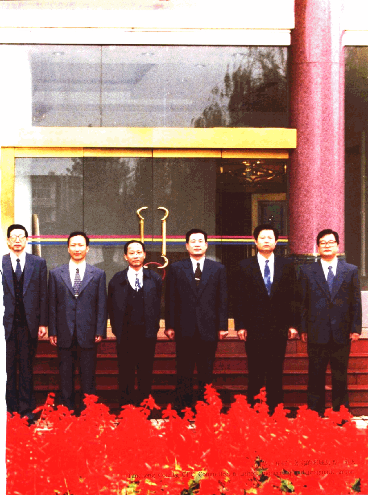
团结、开拓、务实的郟城县委一班人 Tancheng County CPC Committee, a united, pioneering and pragmatic group.