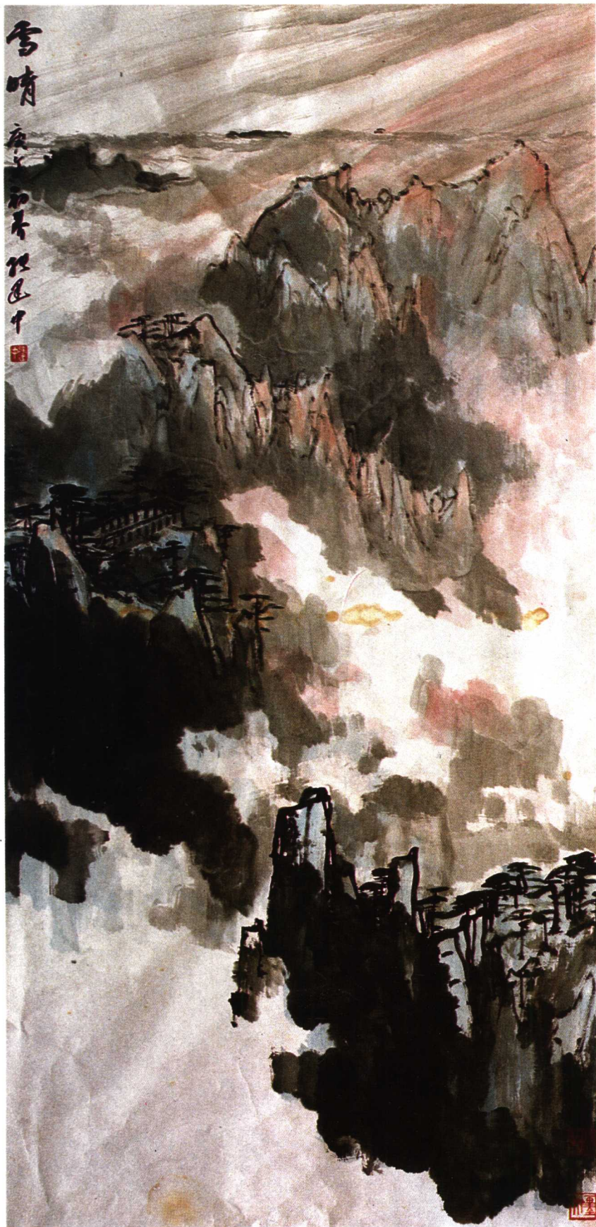
雪晴 After Snow.