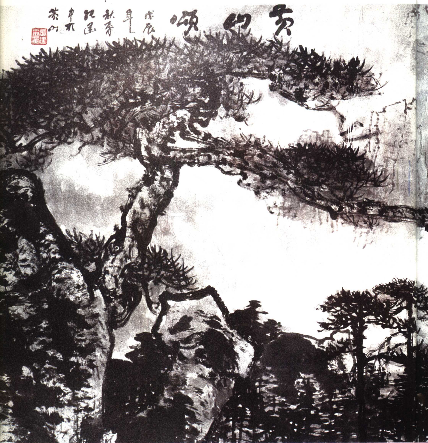
黄山頌 Ode to Huangshan Mountain.