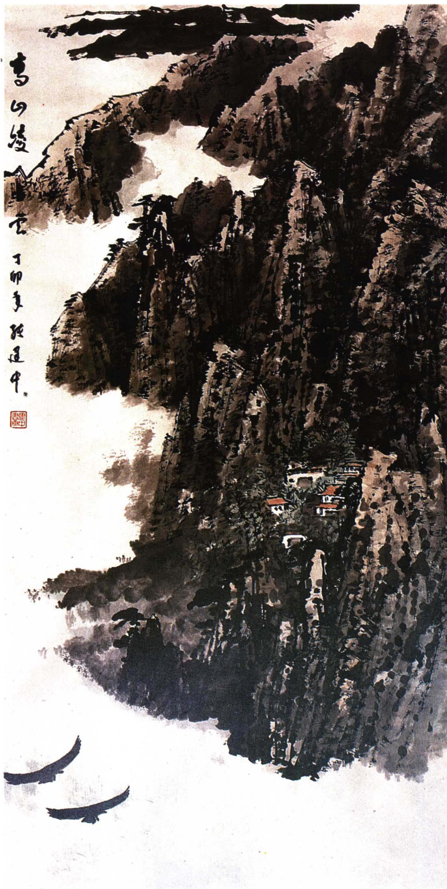
高山凌雲 Lofty Mountain.