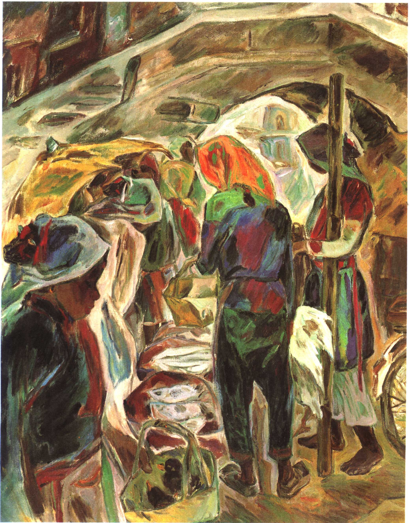
姑蘇城外 (92×73cm) 1986年 Outside the Suzhou City. (1986)