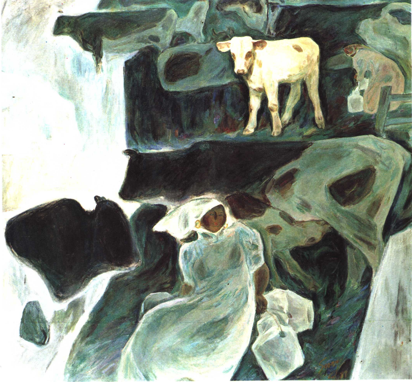
呼倫貝爾夜 (140×150cm) 1987年 Night of Hulun Buir.