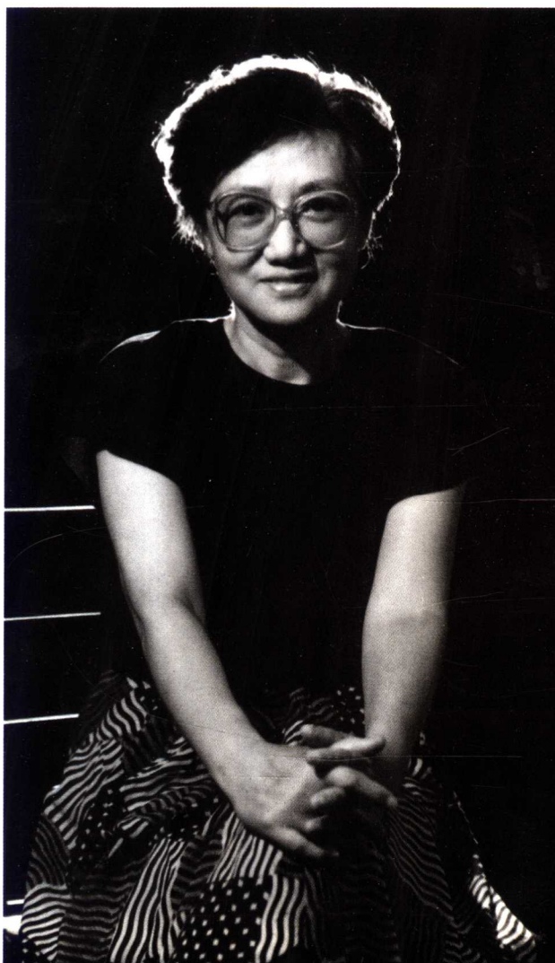
畫家像 Song Xianzhen