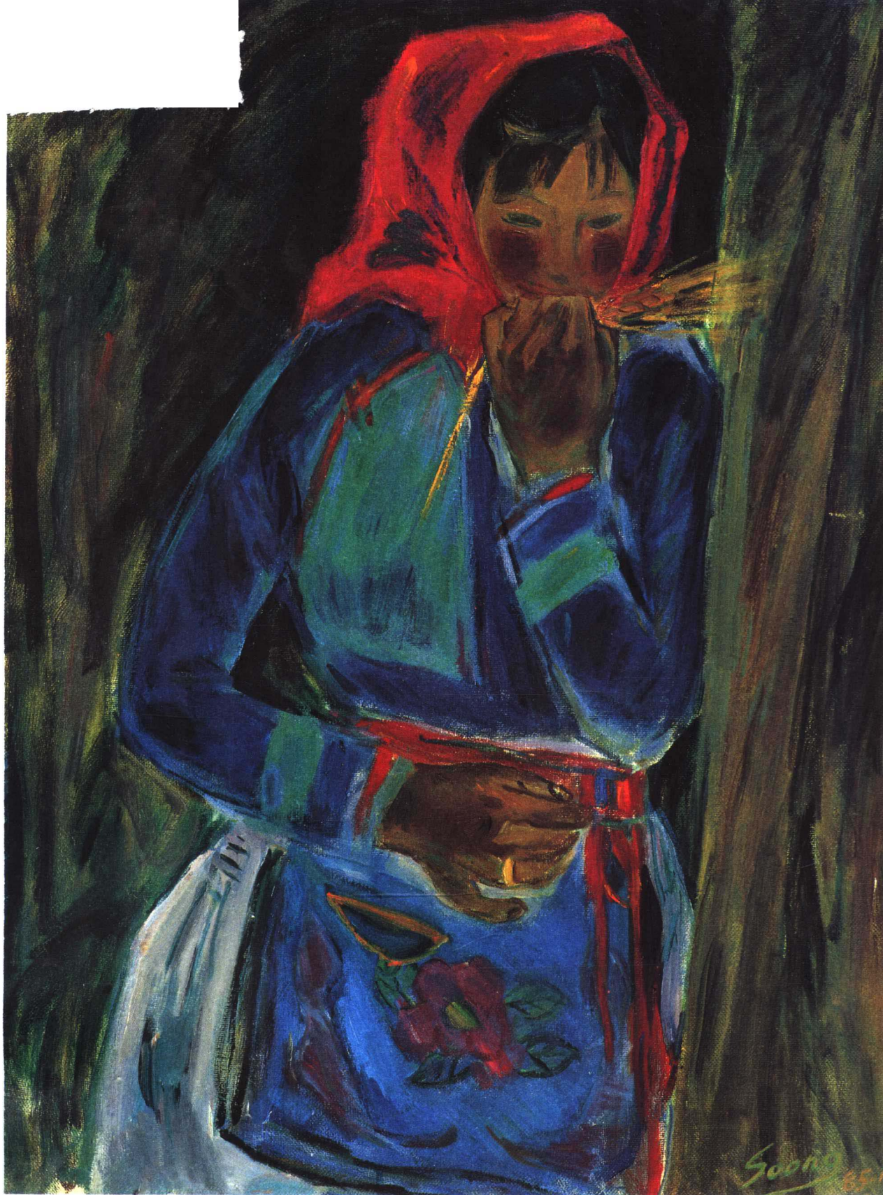
春花 (73×54cm) 1985年 "Chun Hua" (1985)