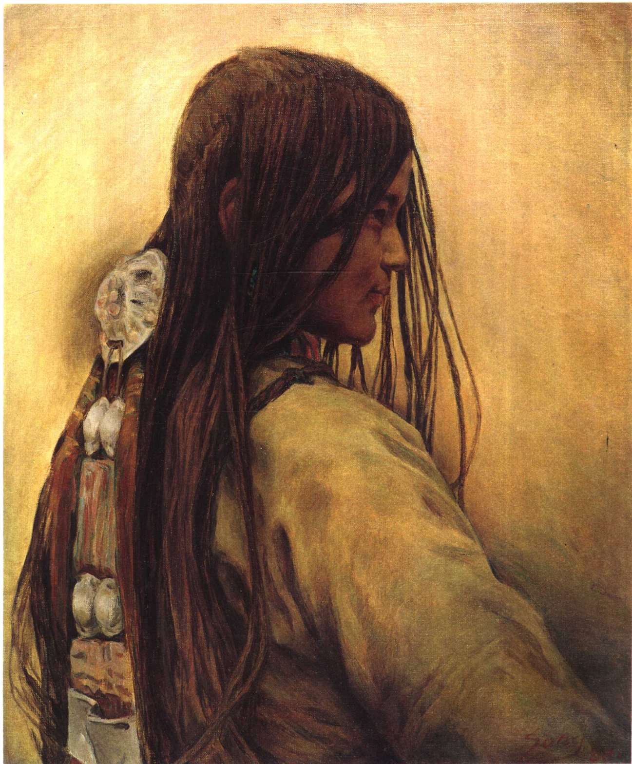
茫茫草原 (61×50cm) 1988年 A Girl from Grassland. (1988)