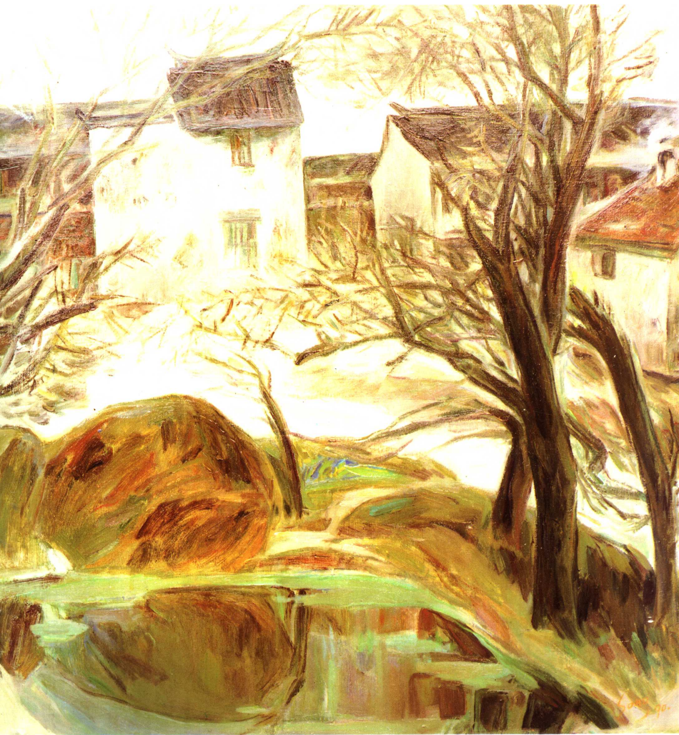
早春 (72×70cm) 1989年 Early Spring. (1989)