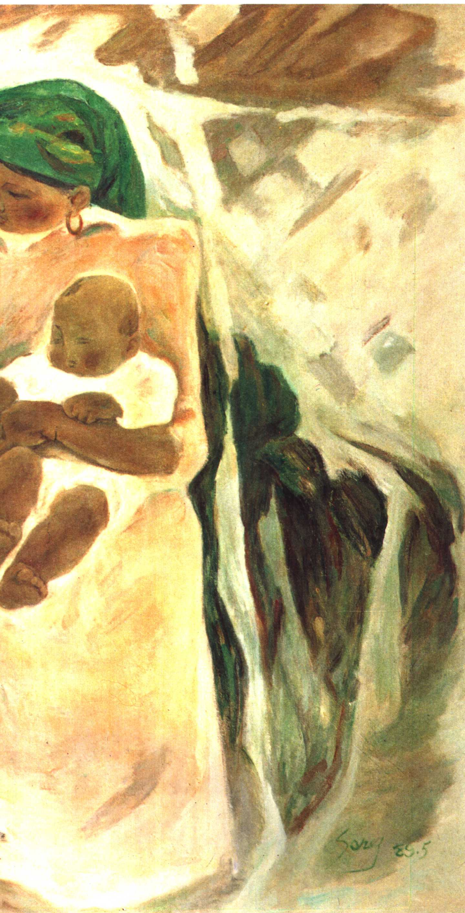
布里亞特女人 (120×153cm) 1989年 Buryat Women.