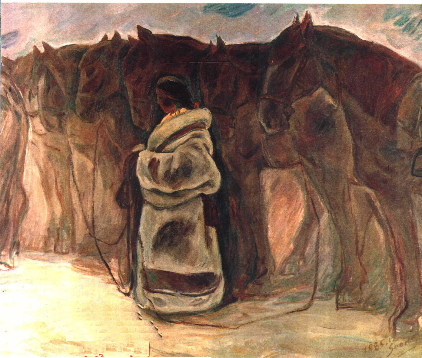
牽馬的少女 (72×92cm) 1985年 The Girl Who Leads Horses.