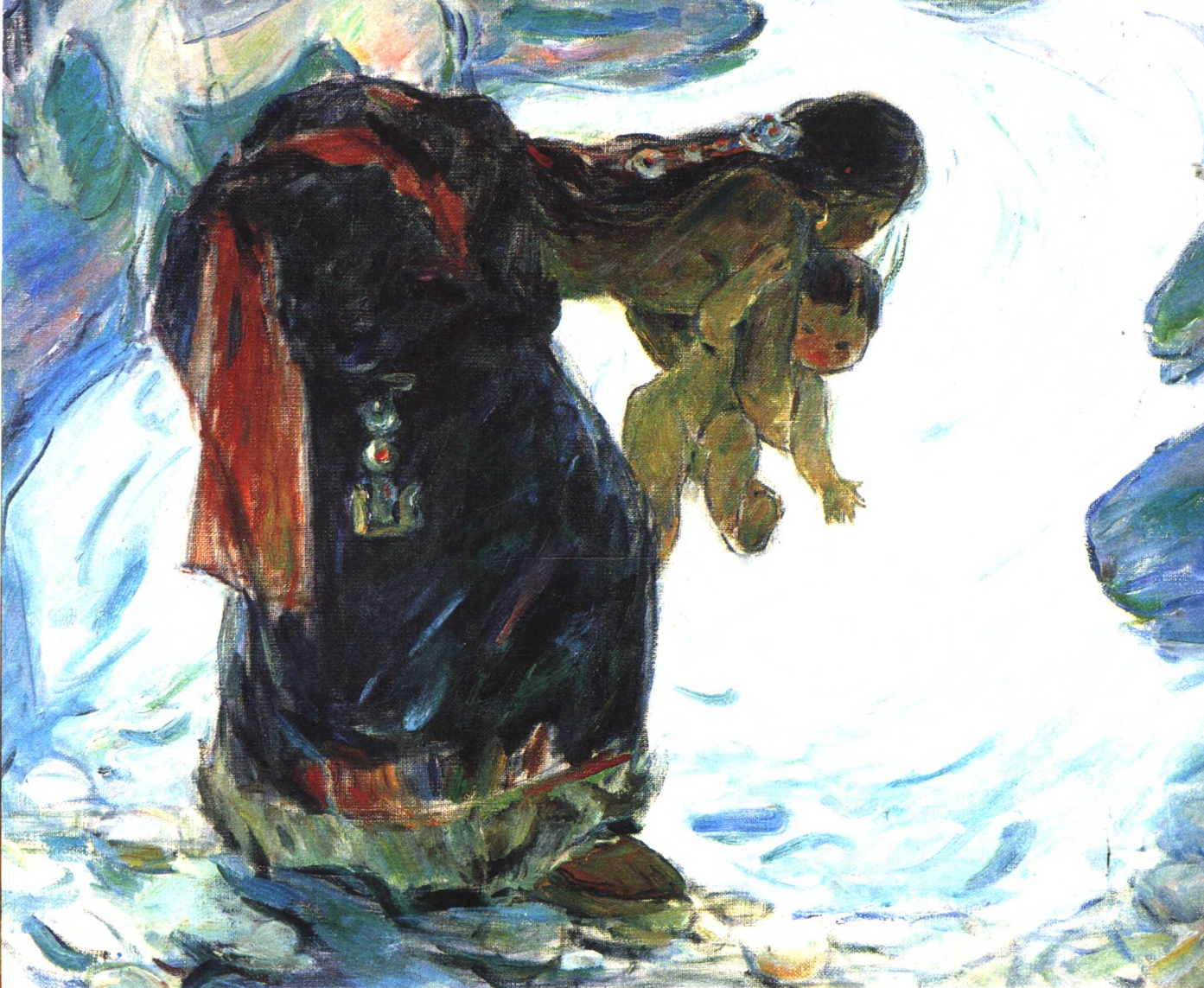
泉 (60×73cm) 1987年 Spring Water.