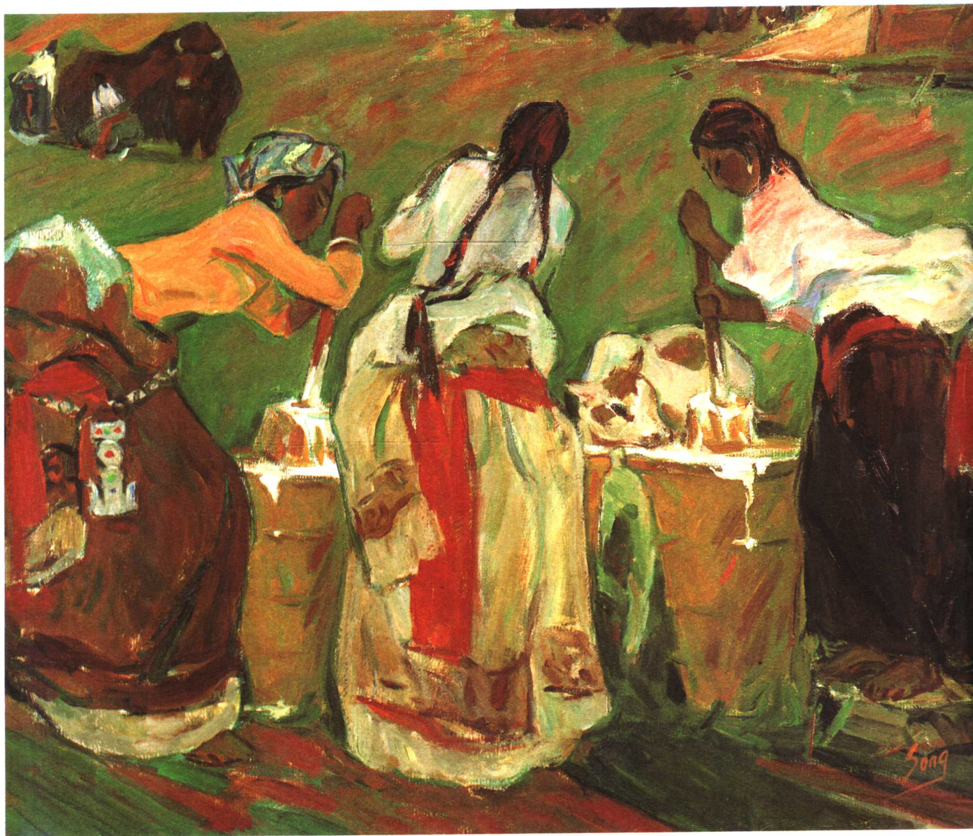
十里奶香 (60×73cm) 1986年 The Scent of Milk Wafted by the Breeze. (1986)