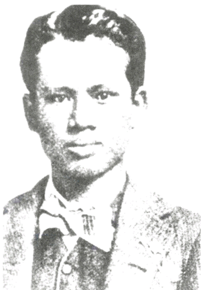
在美國讀書時的宋耀如 Song Yaoru during his study in America