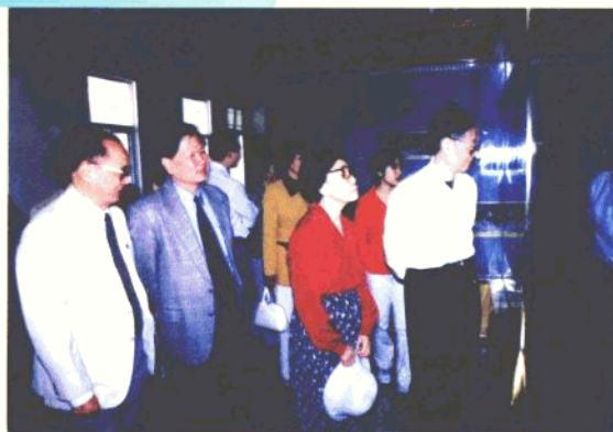
全國政協副主席馬萬祺參觀宋氏祖居。 Vice present of the Chinese People's Political consultative Conference Ma WuanQi visits Song Family ancestor home.