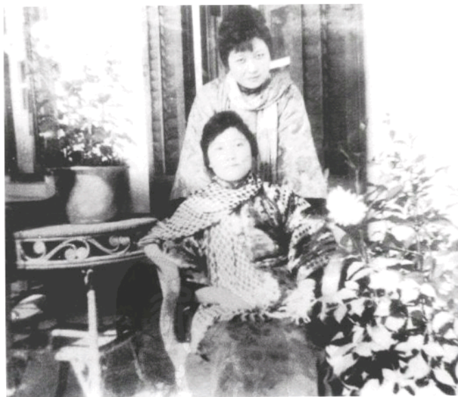
宋慶齡與宋美齡在一起 Song Qingling and Song Meiling

1910 Song Meiling studied in American Wesley women school