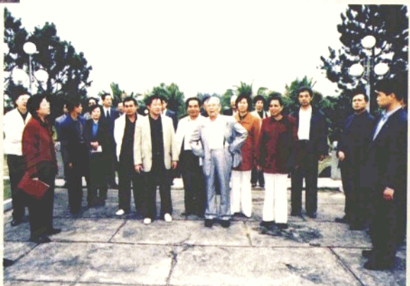
一九九九年十二月前國務院副總理，全國人大副委員長黃華參觀宋氏祖居。 Dec. 1999 Vice-premier, vice president of National People's Congress Huang Hua visits Song Family ancestor home.