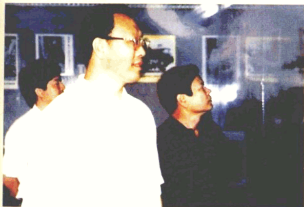
原海南省委書記杜青林參觀宋氏祖居 The former Secretary of Hainan Provincial Committee, CPC, Du Qinglin visiting the Song Family Ancestral House

15th/Sep, 2001 the secretary of Hainan Provincial Party committee Bai Keming (first one on the right) visits Song Family home.