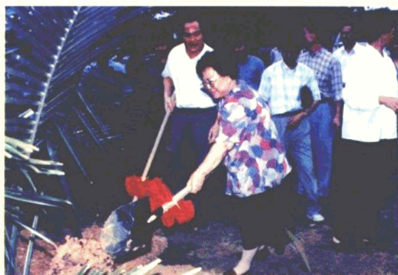
1997年5月24日彭佩雲副委員長在宋氏祖居栽種椰子樹。 24th/May, 1997 the vice chairman of the Central Committee plants the coconut tree in Song Family ancestor home