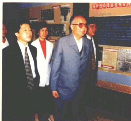
華國鋒同志參觀宋氏祖居 Comrade Hua Guofeng visiting Song Family Ancestor home