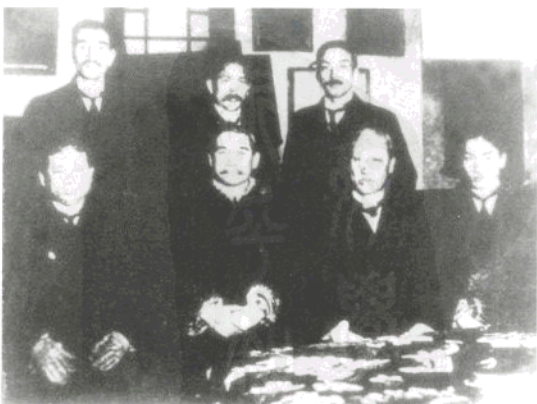
宋耀如在日本與孫中山等合影。前排左一為宋耀如 Song Yaoru (front row left first one) and Sun Zhongshan in Japan