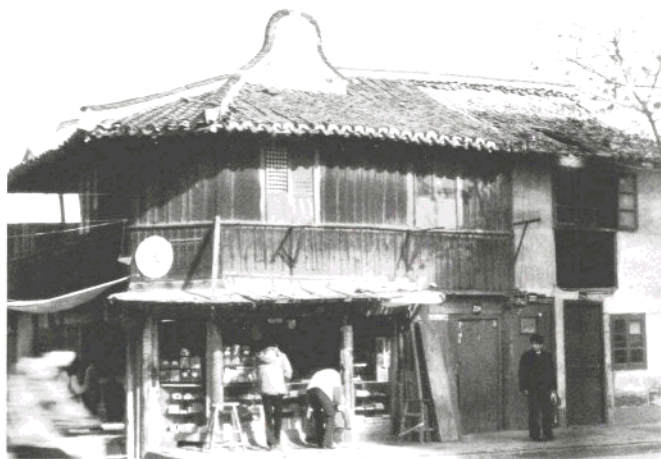
宋耀如在上海的故居 The old house of Song Yaoru in Shanghai