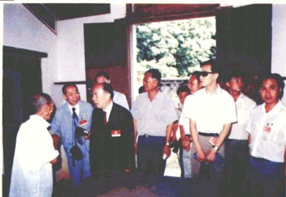
全國政協副主席周光召參觀宋氏祖居。 Vice present of the Chinese People's Political consultative Conference Zhou Guangzhou visits Song Family ancestor home.