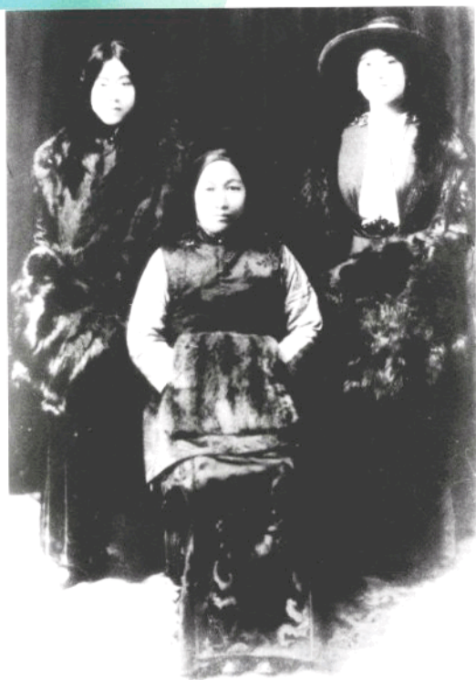
宋靄齡、宋慶齡與母親倪桂珍 Song Ailing, Song Qingling and mother Ni Guizhen