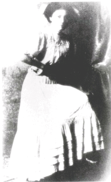
在美國留學時的宋慶齡 Song Qingling during studied in America