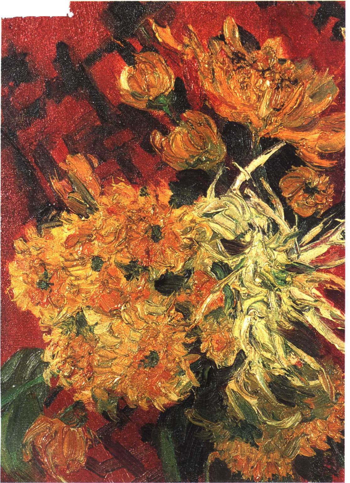
菊花 (43×33cm) 1974年 Chrysanthemum.