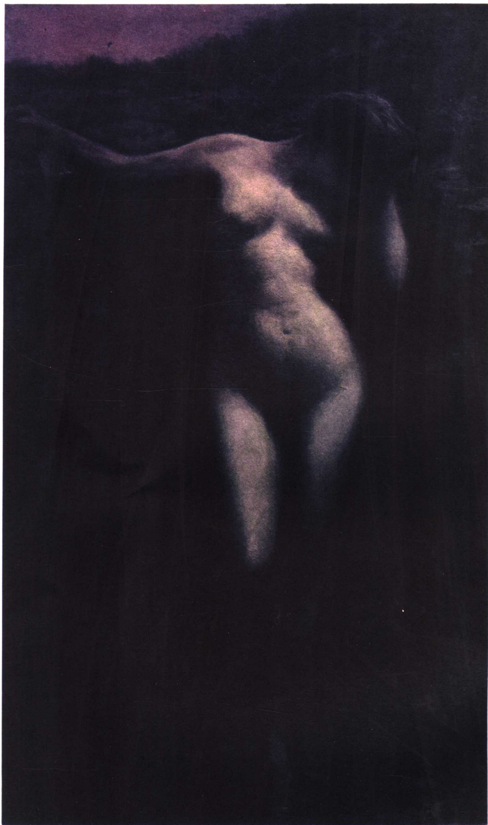
月光下 (100×60cm) 1988年 Under the Moon.