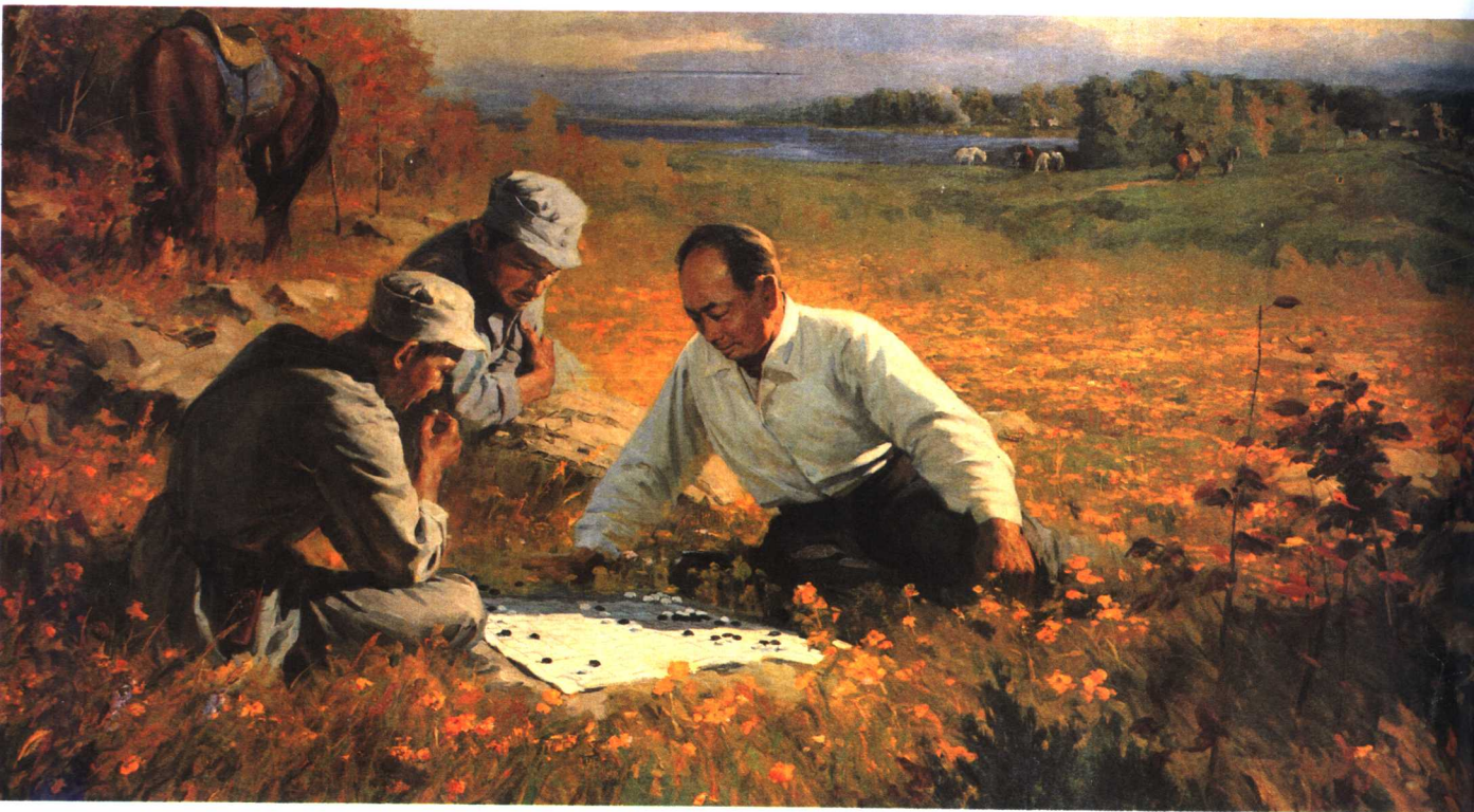
志在千里 (100×210cm) 1981年 On Another Battlefield.