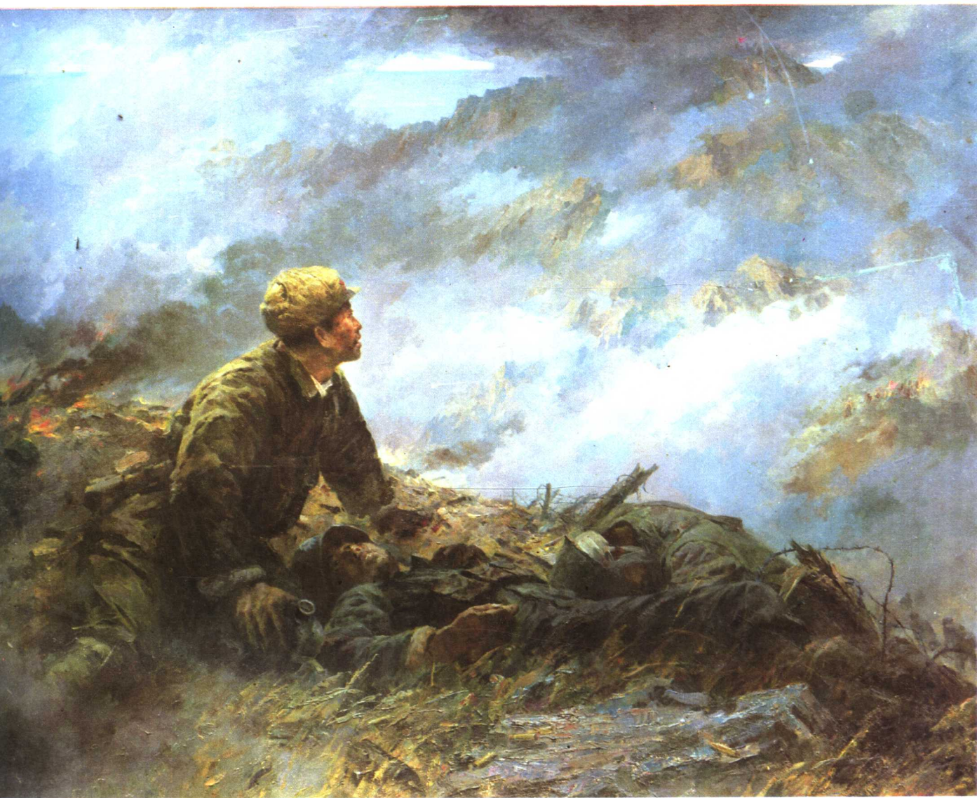
遠去的槍聲 (160×180cm) 1984年 Gunshots Die Away in the Distance.