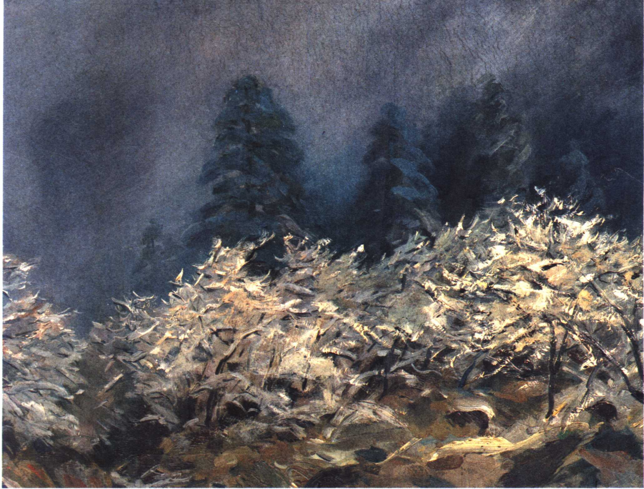
黄山晨雾 (40×60cm) 1979年 Morning Fogs on Huangshan Mountain.