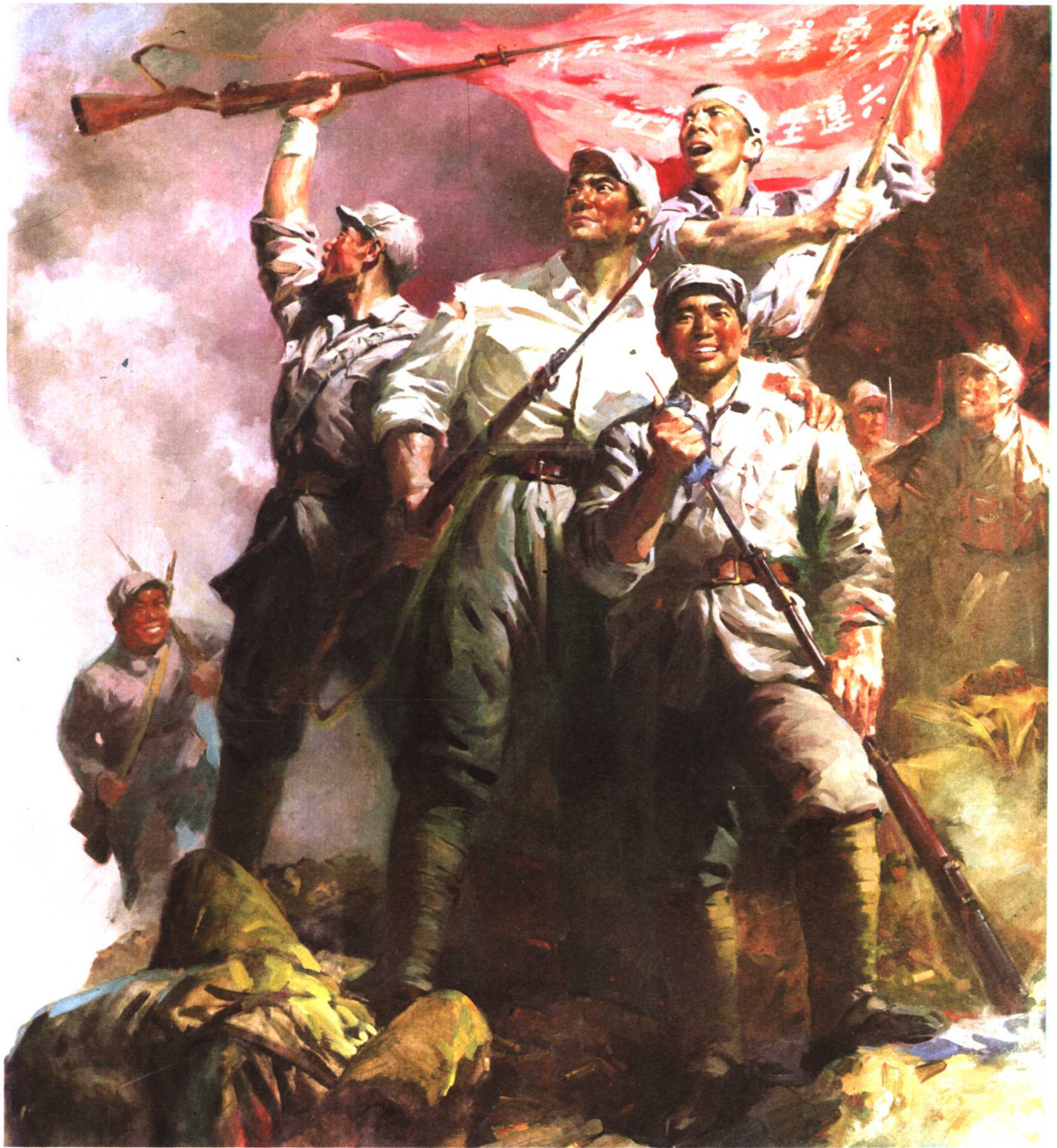
殺敵先鋒(局部) (180×135cm) 1977年 Fighting in the Van. (Detail)