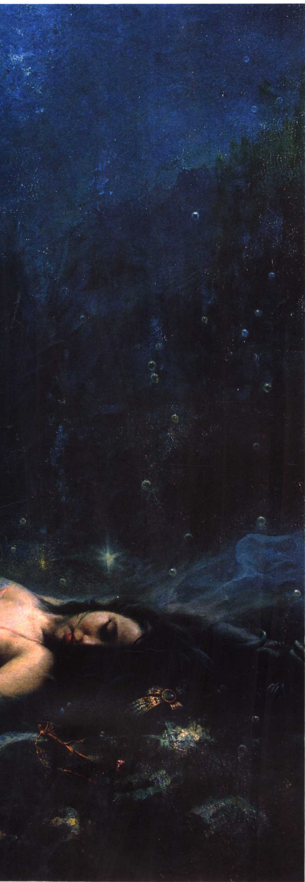
藍色的夢 (120×130cm) 1990年 Blue Dream.