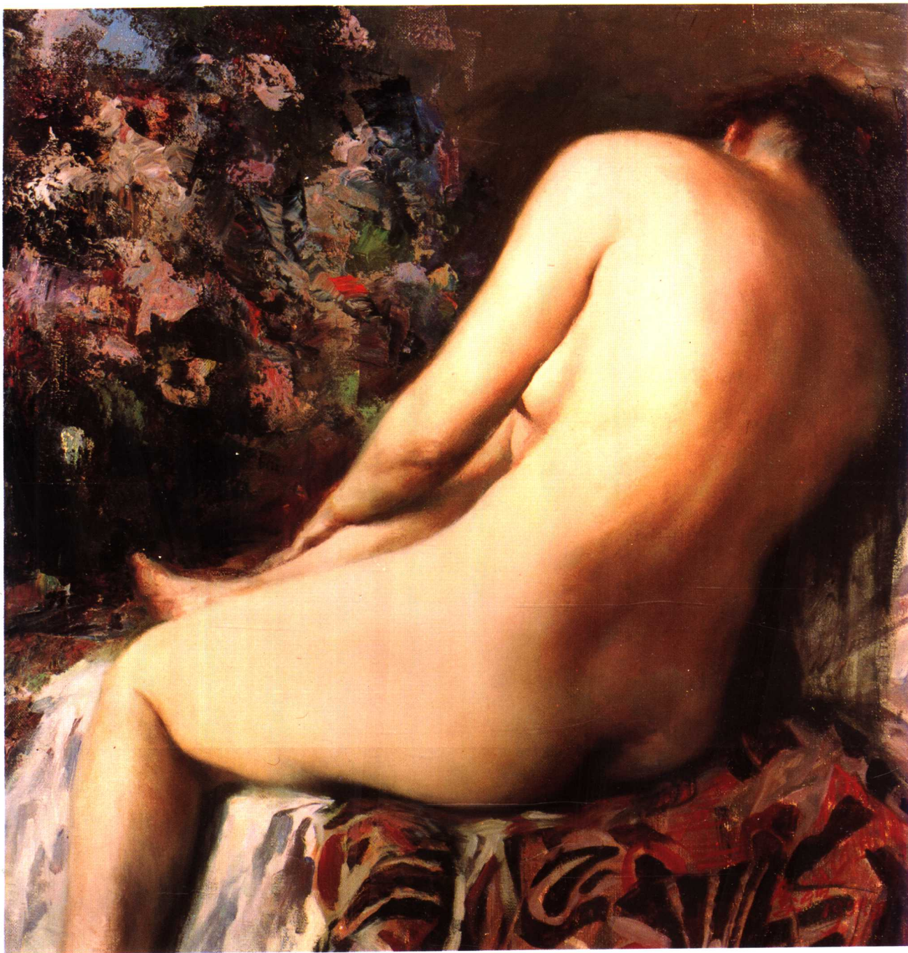
女人體 (74.5×74.5cm) 1990年 A Woman.