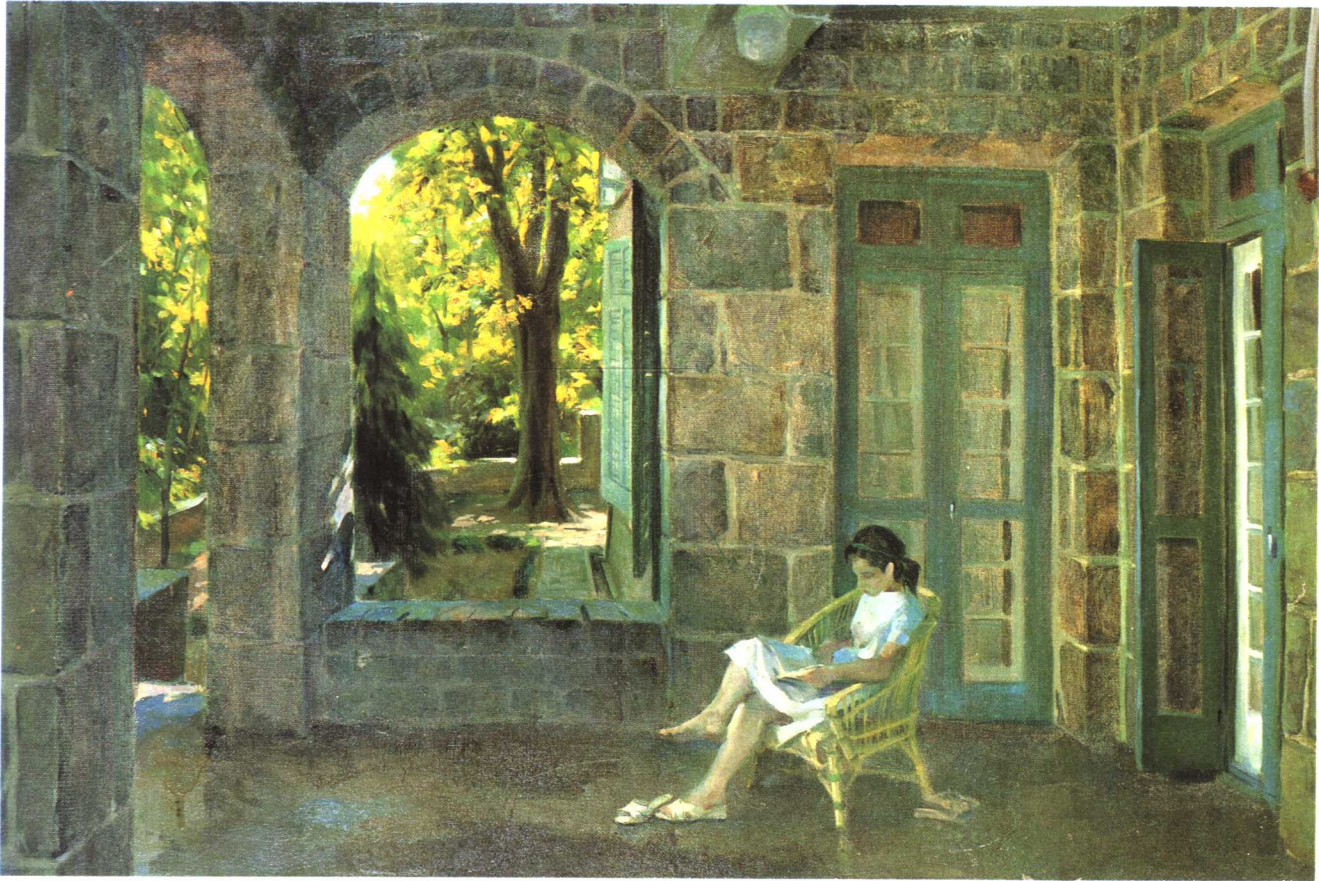
莫干山林養所 (60×90cm) 1983年 A Sanitarium at the Mogan Mountain.