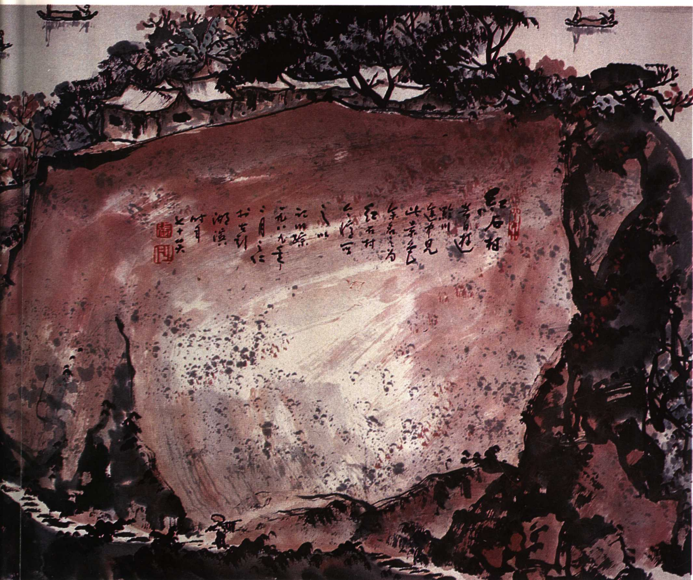
紅岩村 Red Rock Village.