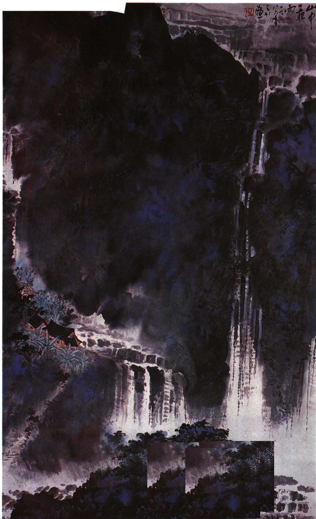
山中一夜雨 After Rain.