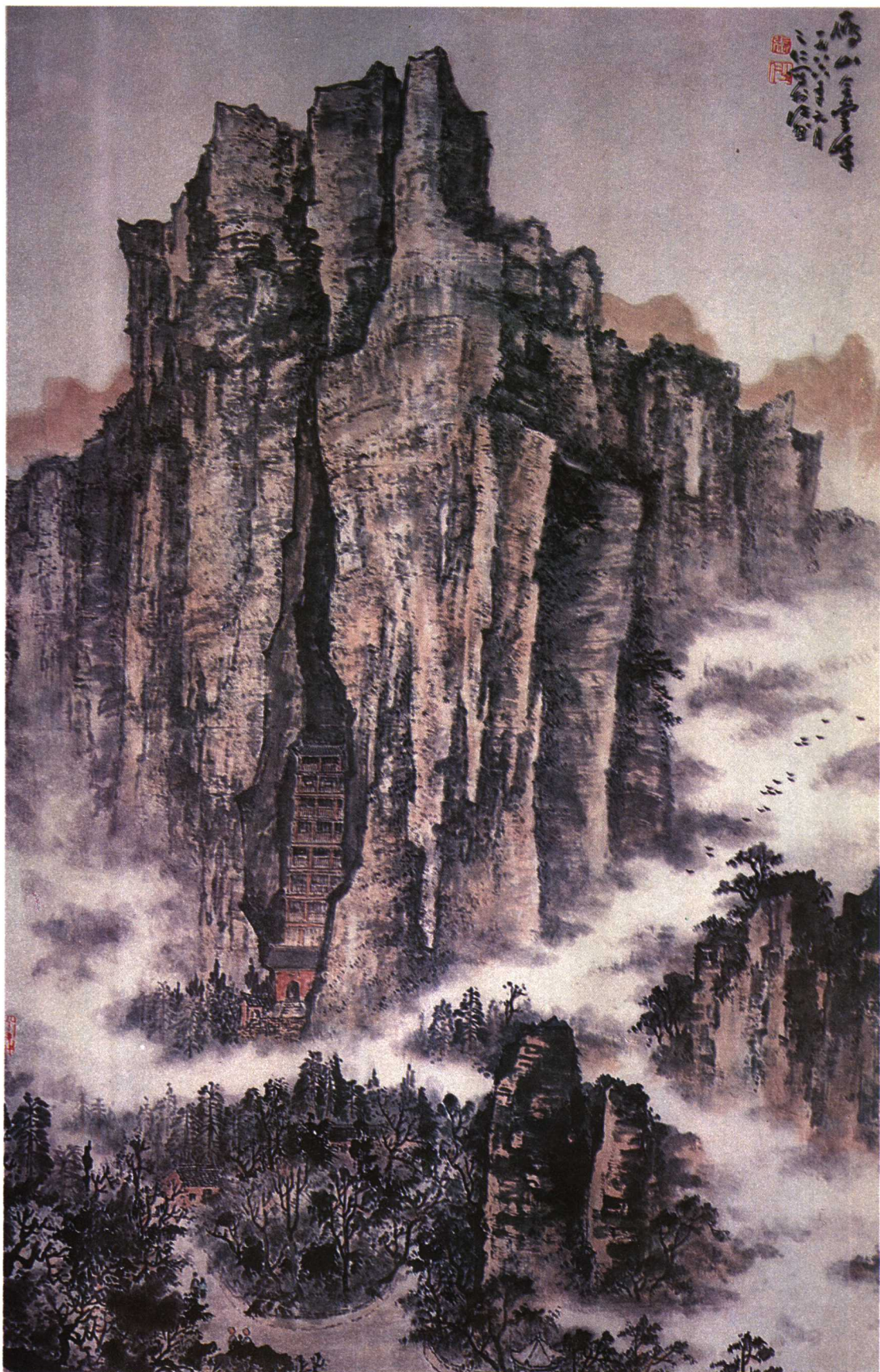
雁山合掌峰 Hezhang Peak of the Yanshan Mountains.