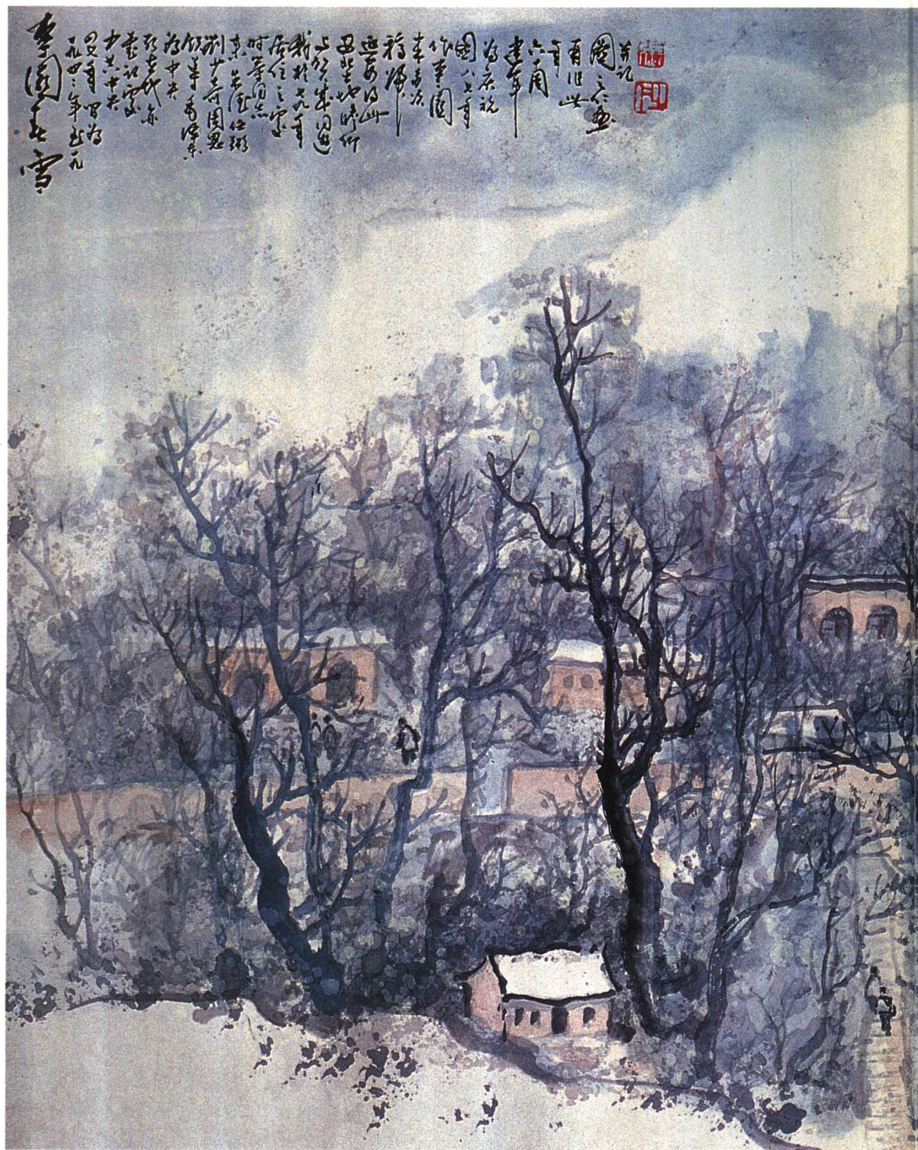
延園春雪 Spring Snow of the Yanyuan Garden.