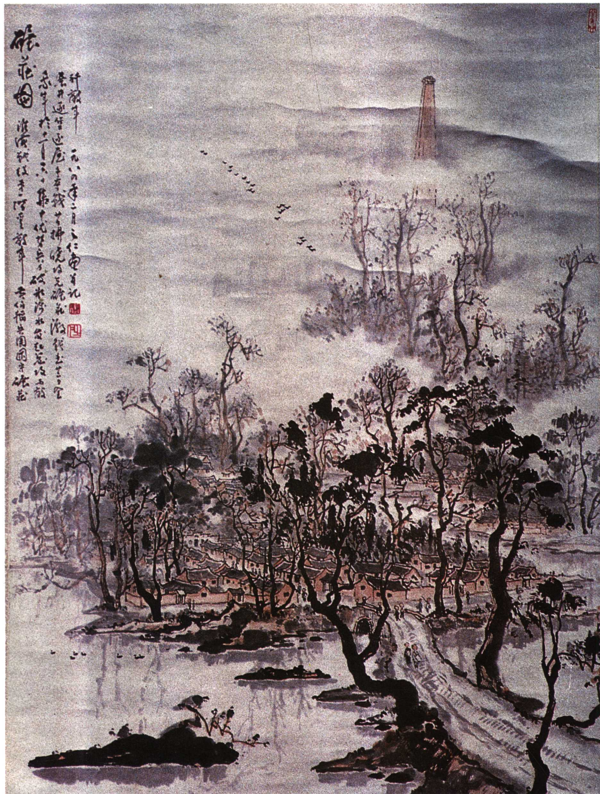
碾庄行 A Trip to Nianzhuang Village.