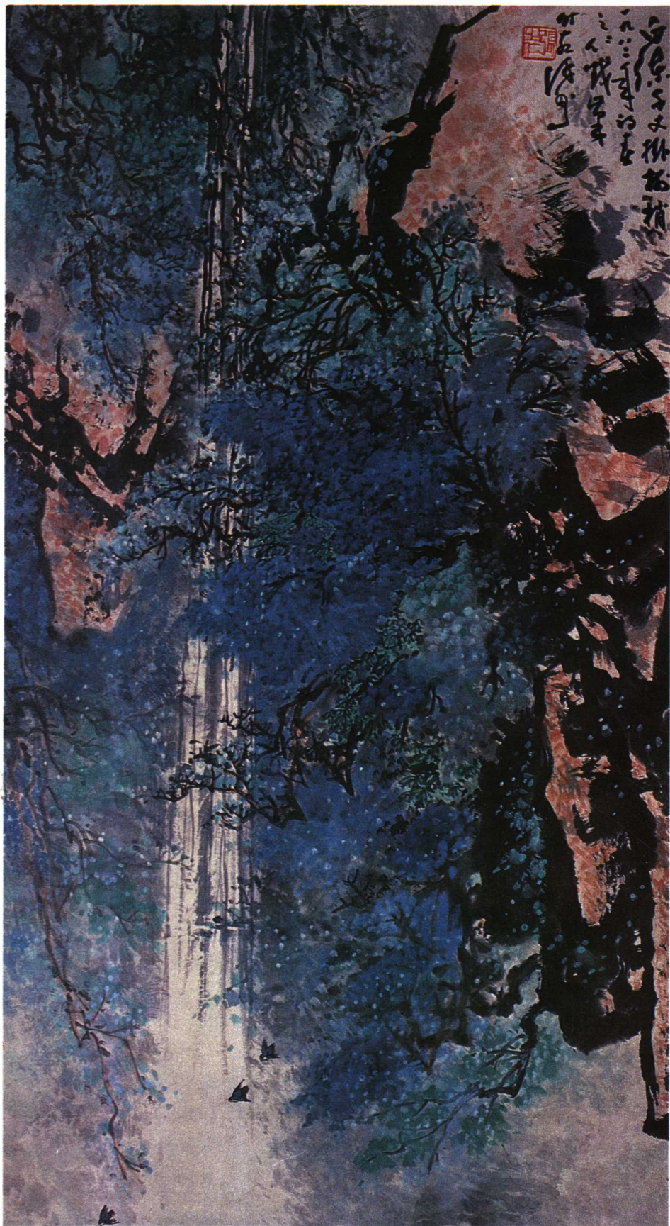
白練千丈掛樹梢 Waterfall beyond the Treetop.