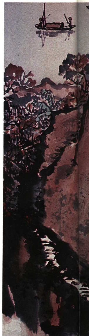
傣族山居 Mountain Dwellings of the Dai People.