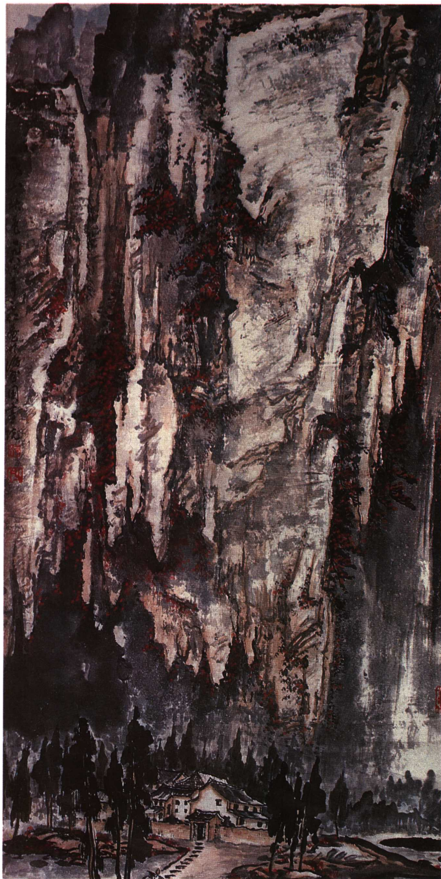
雁荡山色 Yandang Mountains.