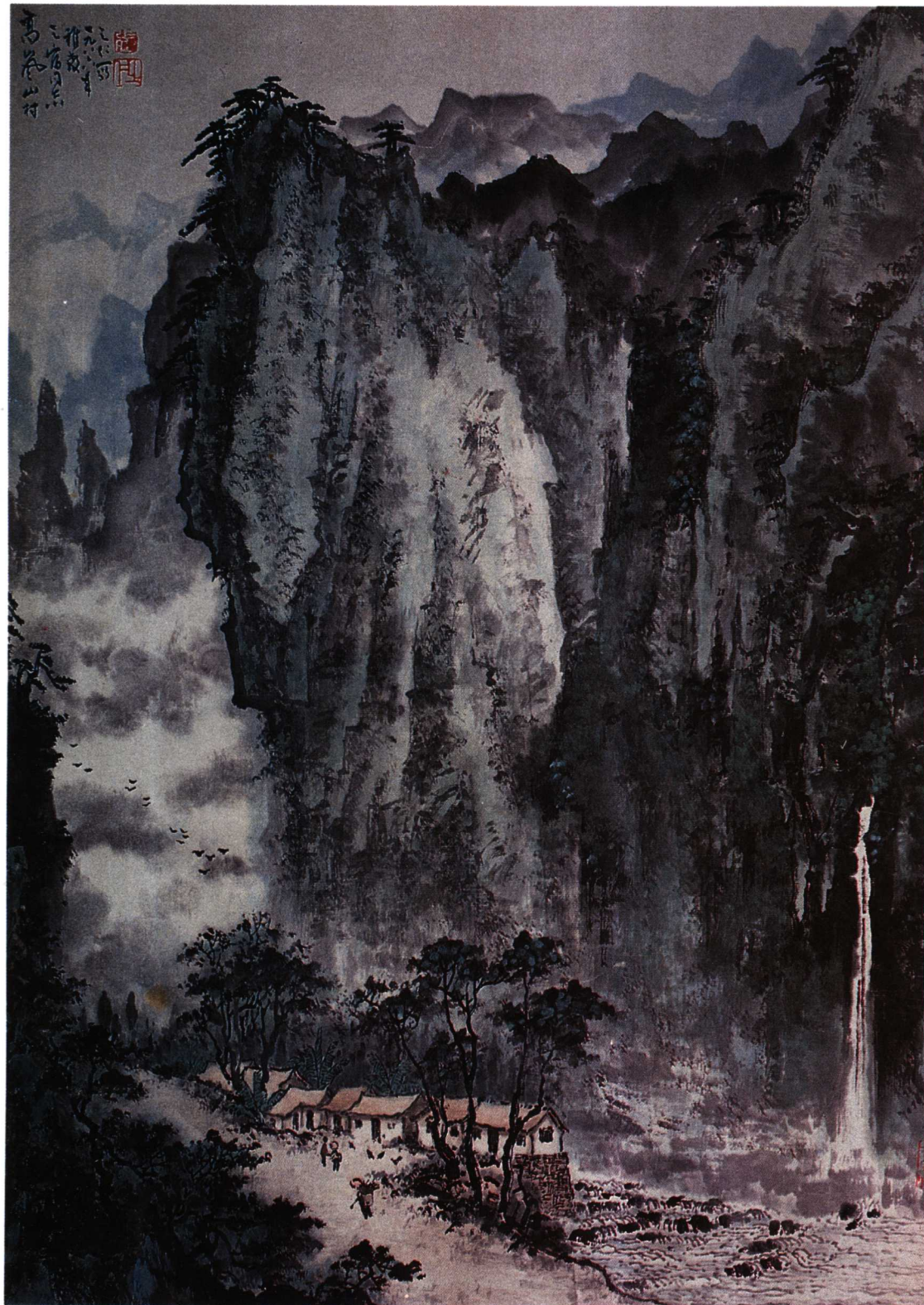
高嵐山村 Mountain Village.