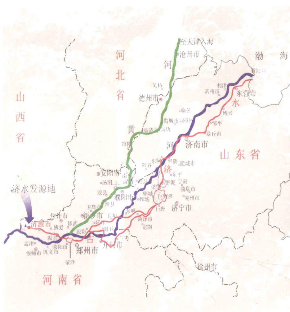
■ 古济水流域图 Water basin map of ancient Jiyuan 古济水流域图

Beihai pond, the source land of Ji water 济水の源である北海池