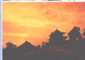
阳台宫夕照 Evening glow of Yangtai Temple 阳台宫