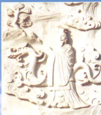
黄帝祭天 Performance of emperor to offer sacrifices to the gods 黄帝祭天