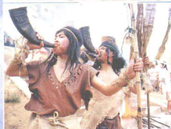
祭天表演 Performance to offer sacrifices to the gods 祭天表演