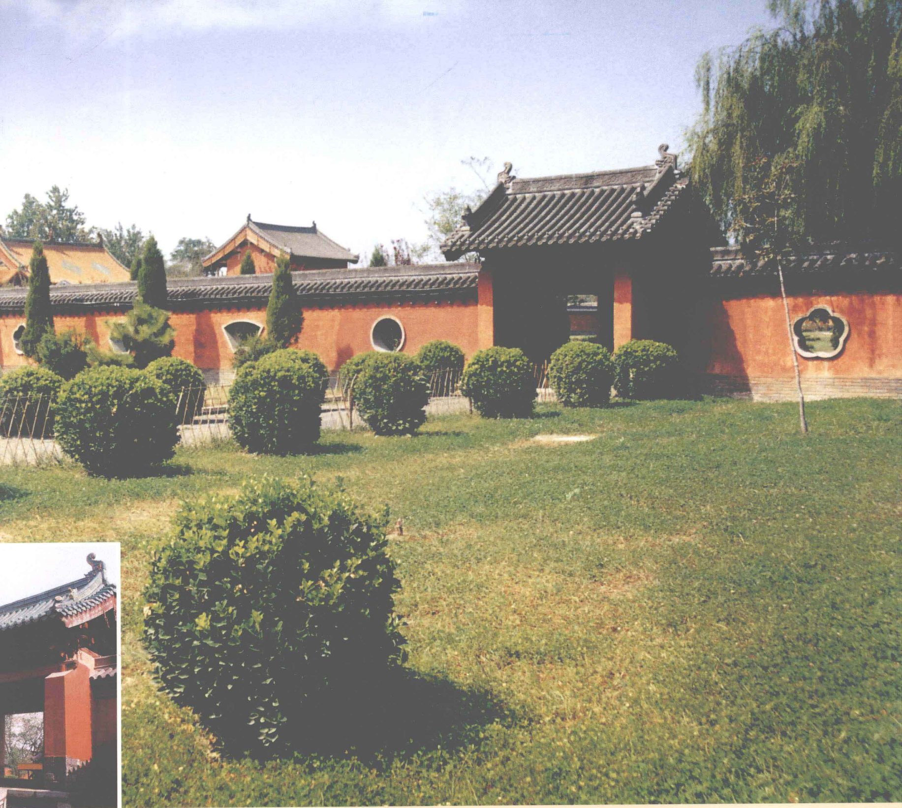
■ 济渎庙 Jidu temple 济渎廟