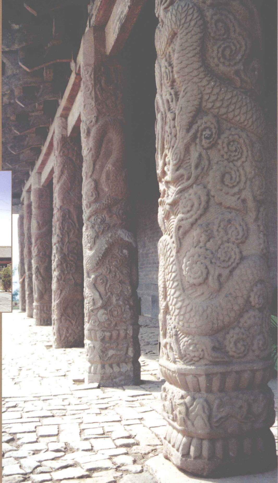
陽台宮の彫龍石柱 Stone pillar with carvings of dragons of Yangtai palace 陽台宮雕龙石柱