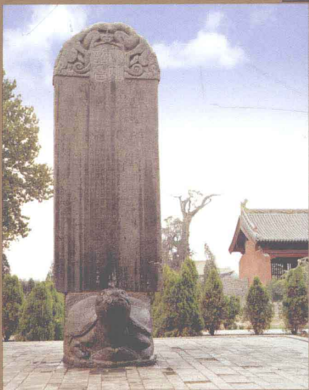
■ 大明詔旨碑 Imperial edict monument of Great Ming Dynasty 大明詔聖碑