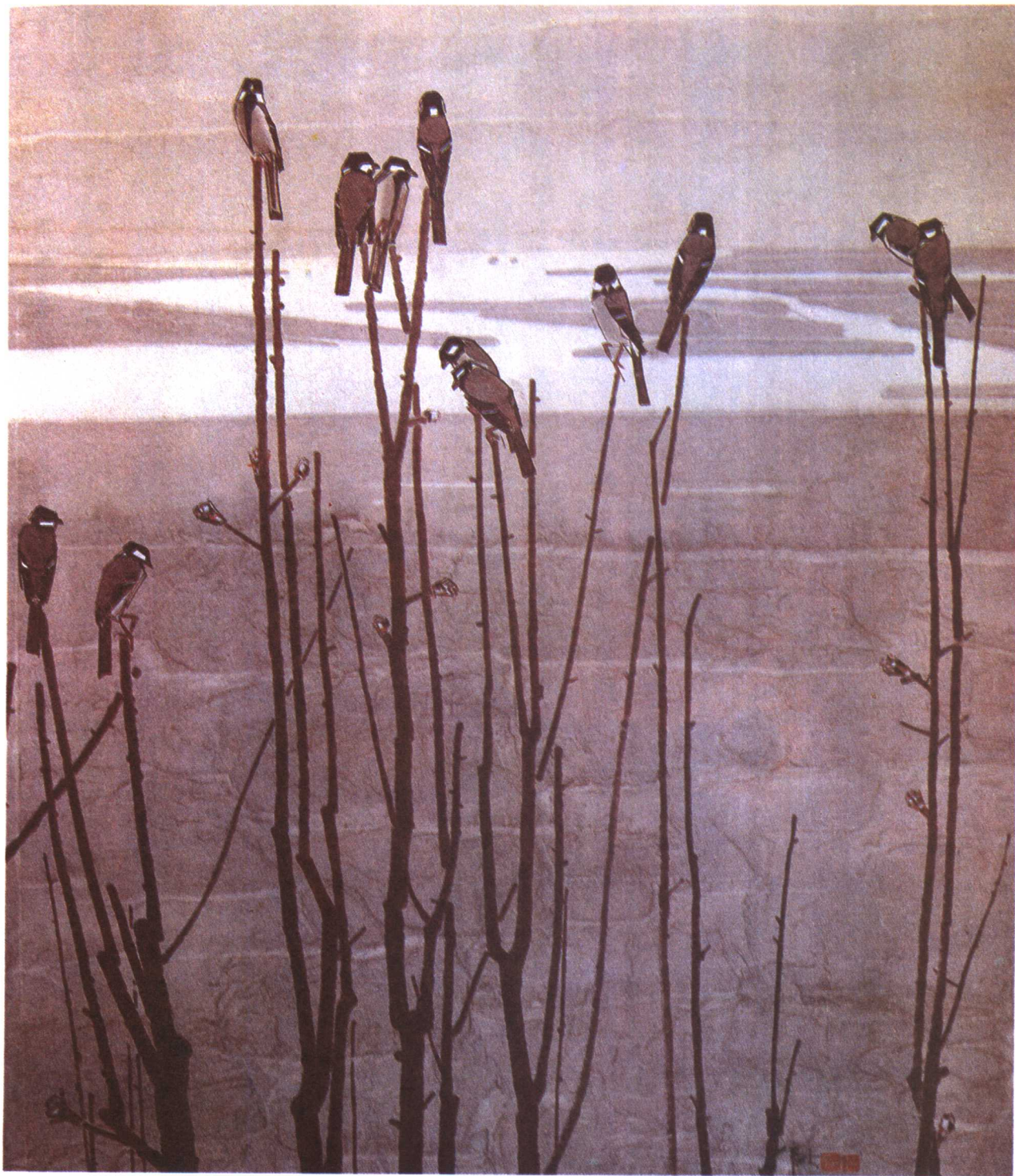
山珍珠 Mountain Pearls.