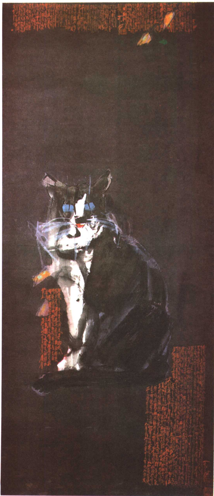
風霜野狸 Leopard Cat.