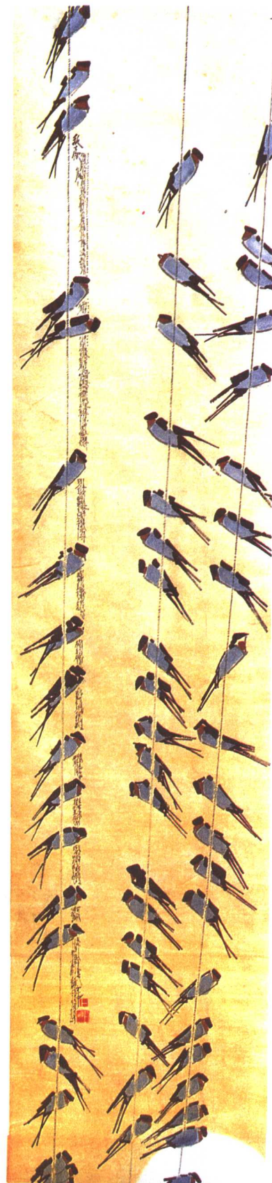
此去何處 Where Do They Lead?