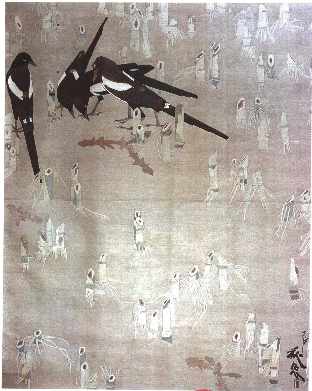
秋思 Autumn Mood.