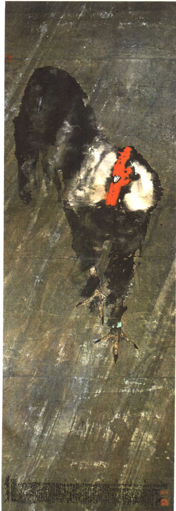
凌寒歲月 Cold Times.