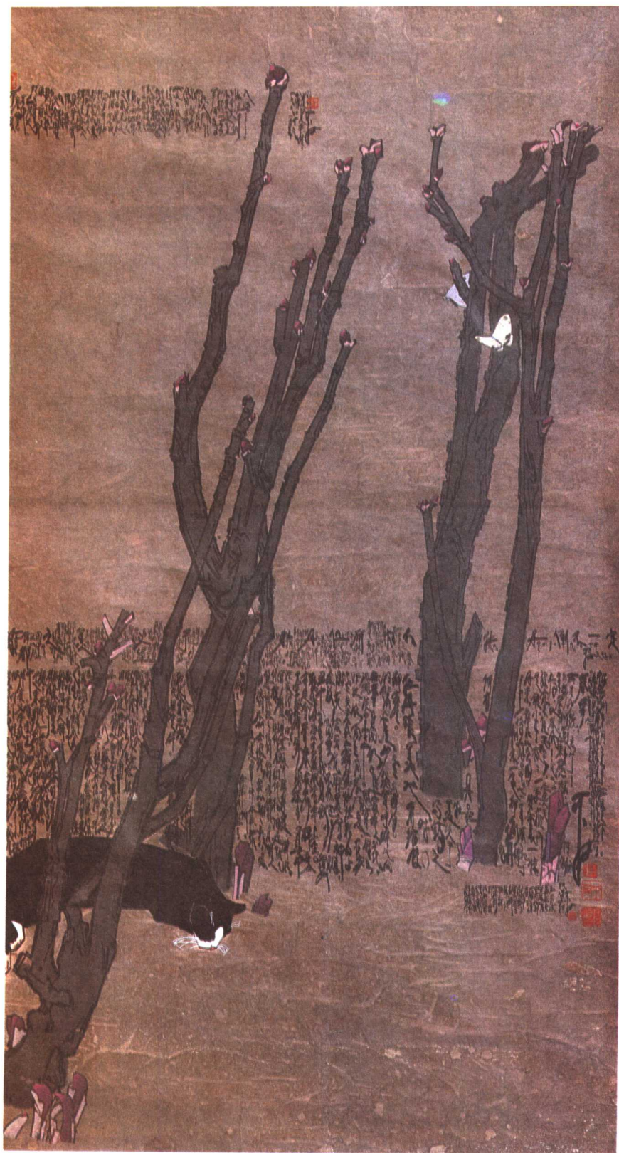
春夢 Spring Dream.