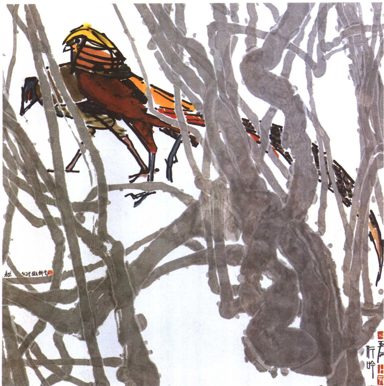
行吟 Singing While Strolling.