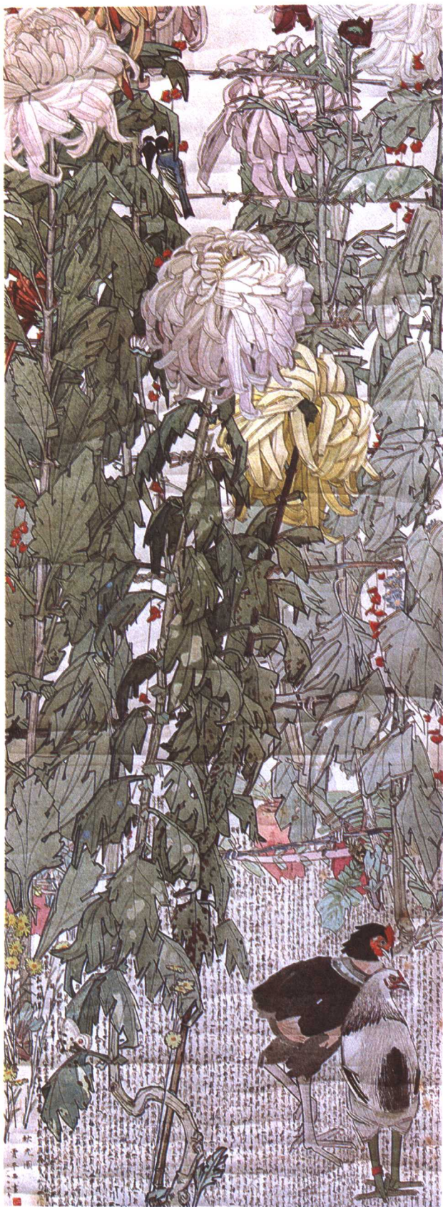
九秋 Nine Autumns.