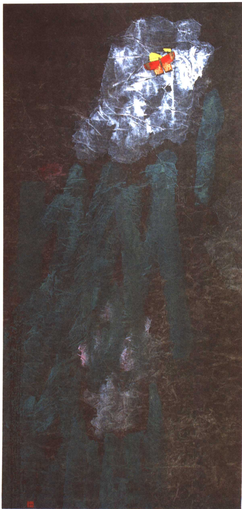
夏牡丹 Summer Peony.