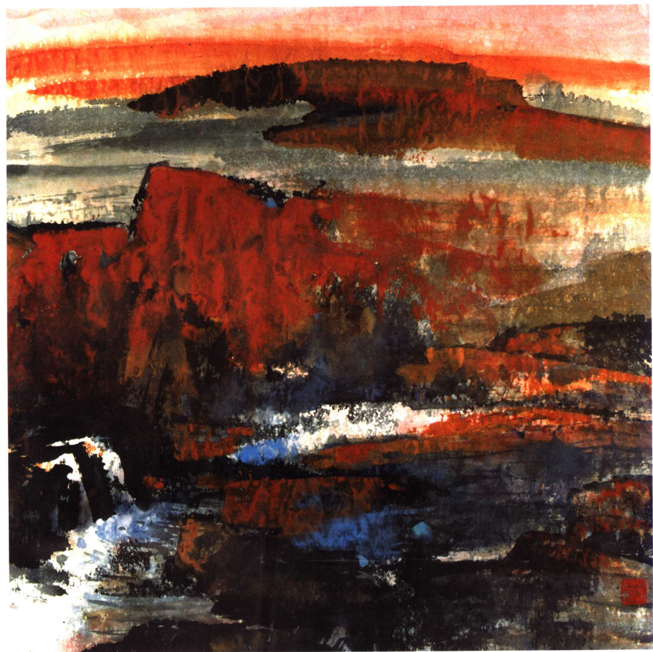
野山 (68×68cm) 1990年 Mountains.