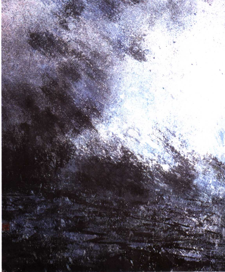
飛雨 (83×83cm) 1991年 Flying Rain.