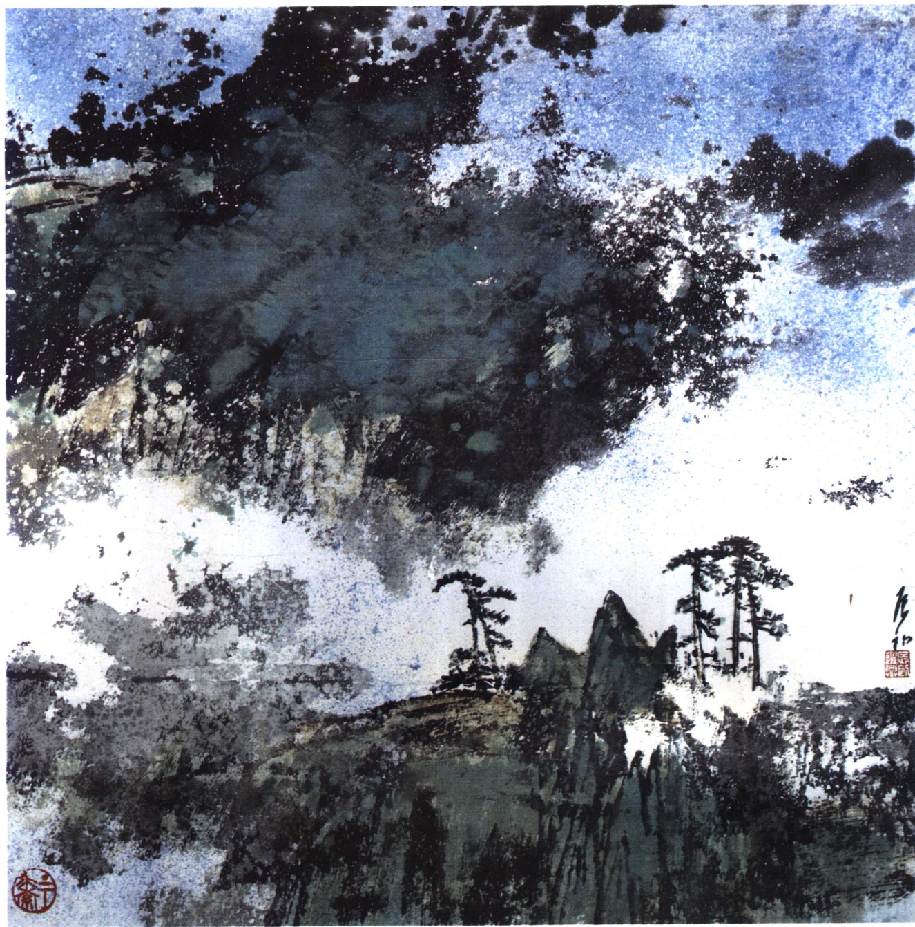
浮翠 (68×68cm) 1991年 Floating Green.