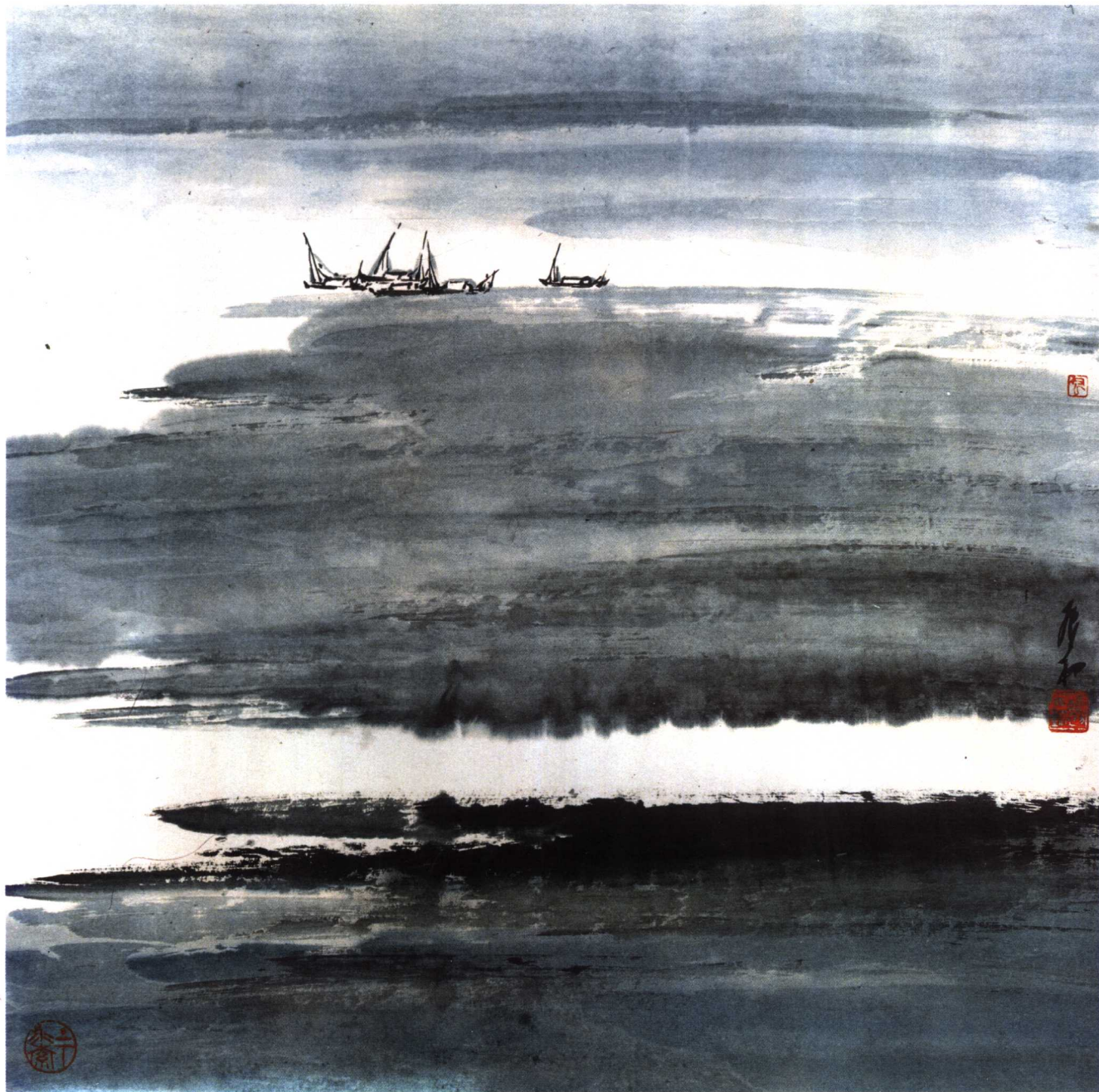
清晨 (68×68cm) 1990年 In the Morning.