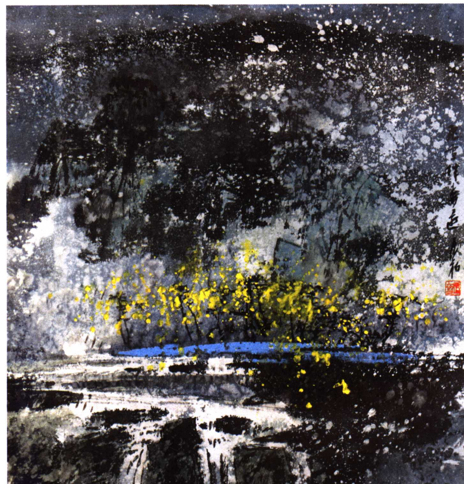
雪滴 (68×68cm) 1990年 Snow-Covered Ravine.