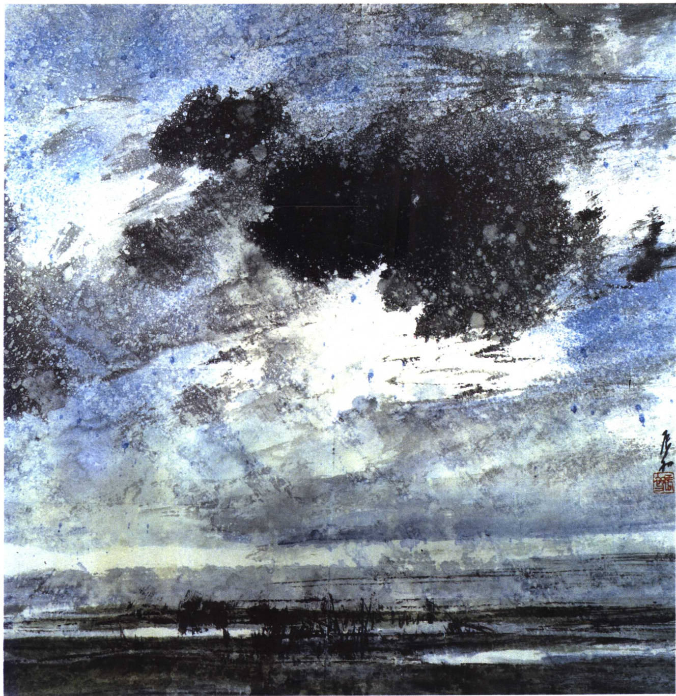
雨霽 (68×68cm) 1991年 After Rain.