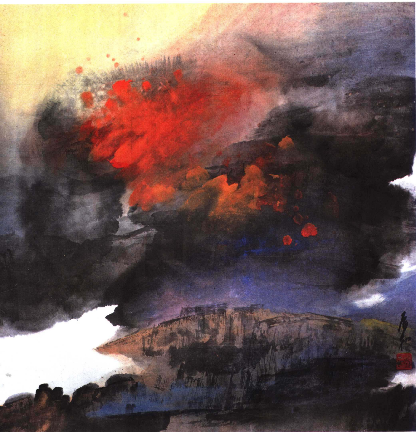
流丹 (68×68cm) ,1990年 Flowing Red.