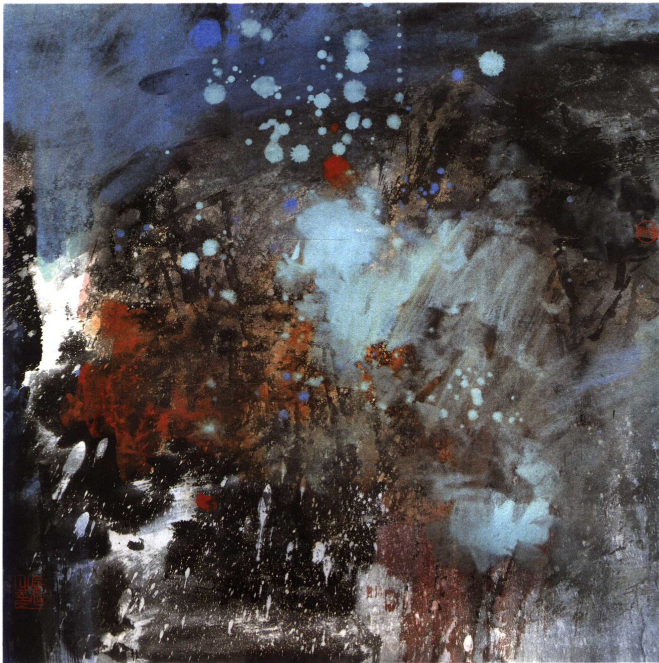
山韵 (68×68cm) 1990年 Charm of the Mountain.