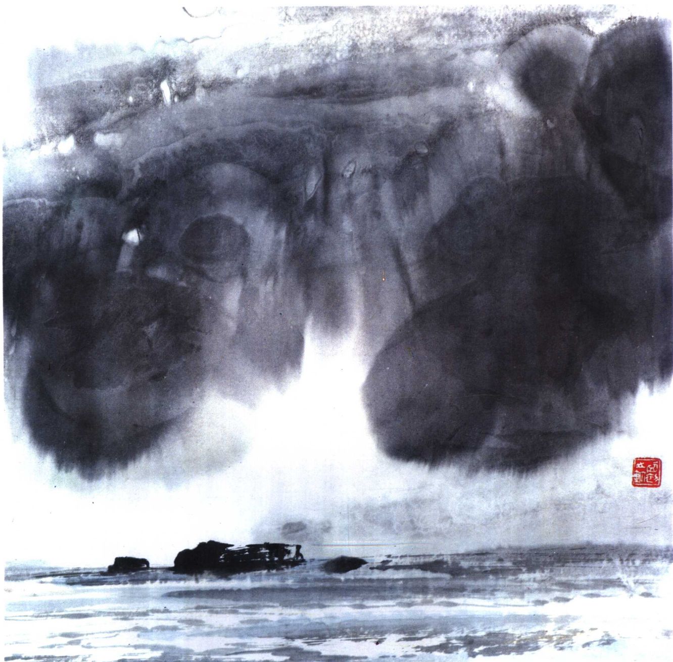
山雨 (61×61cm) 1991年 Storm in the Mountain.