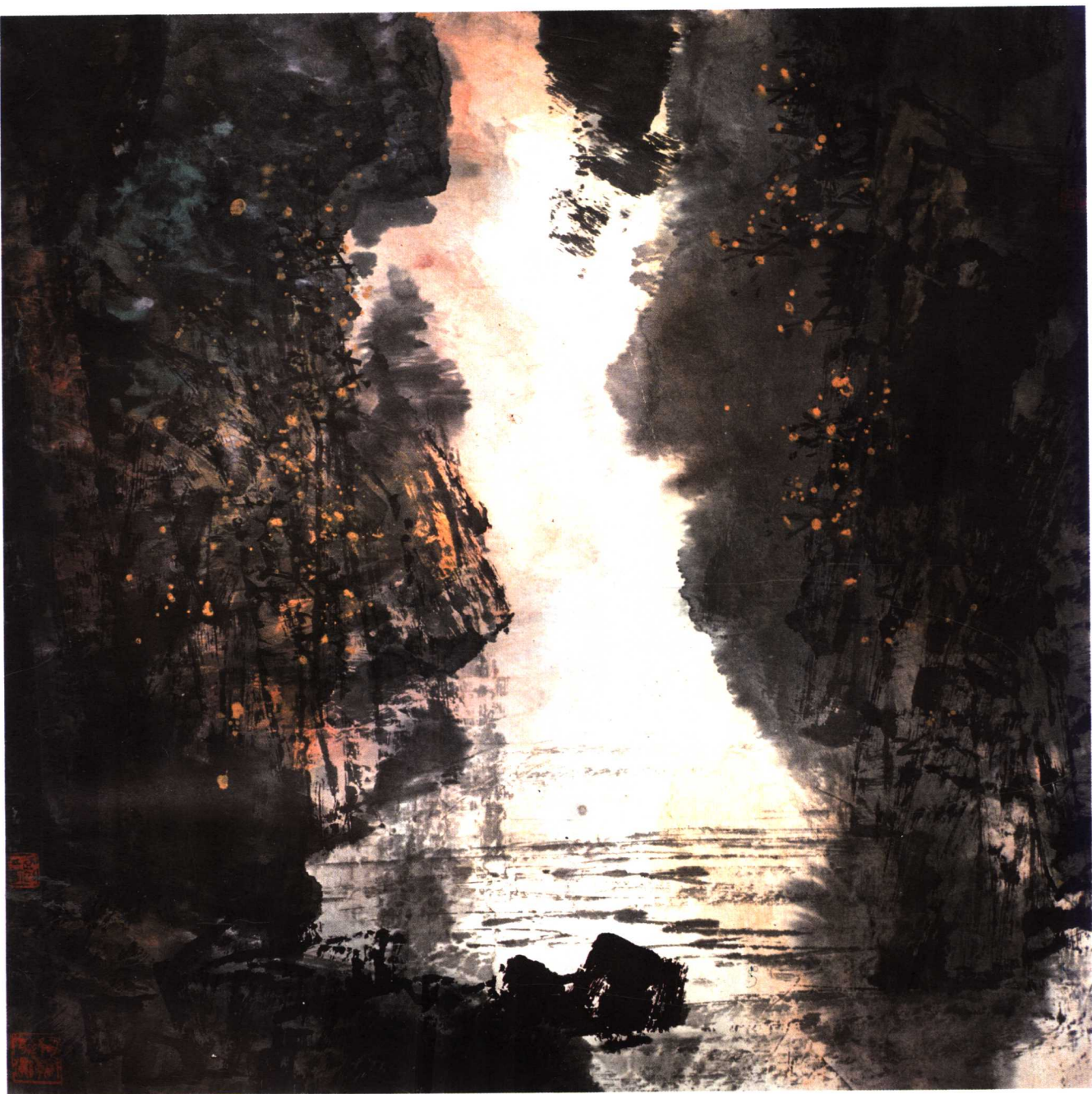
深谷 (83×83cm) 1991年 Deep Valley.