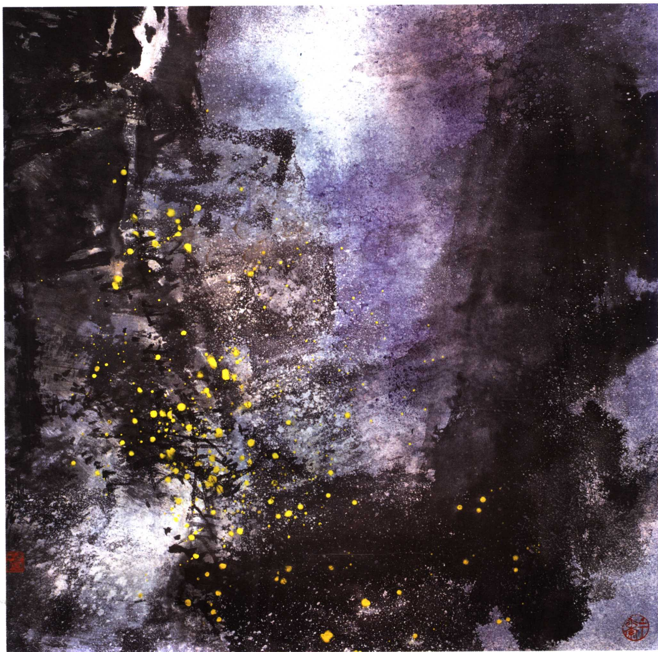
幽壑 (83×83cm) 1991年 Secluded Gully.