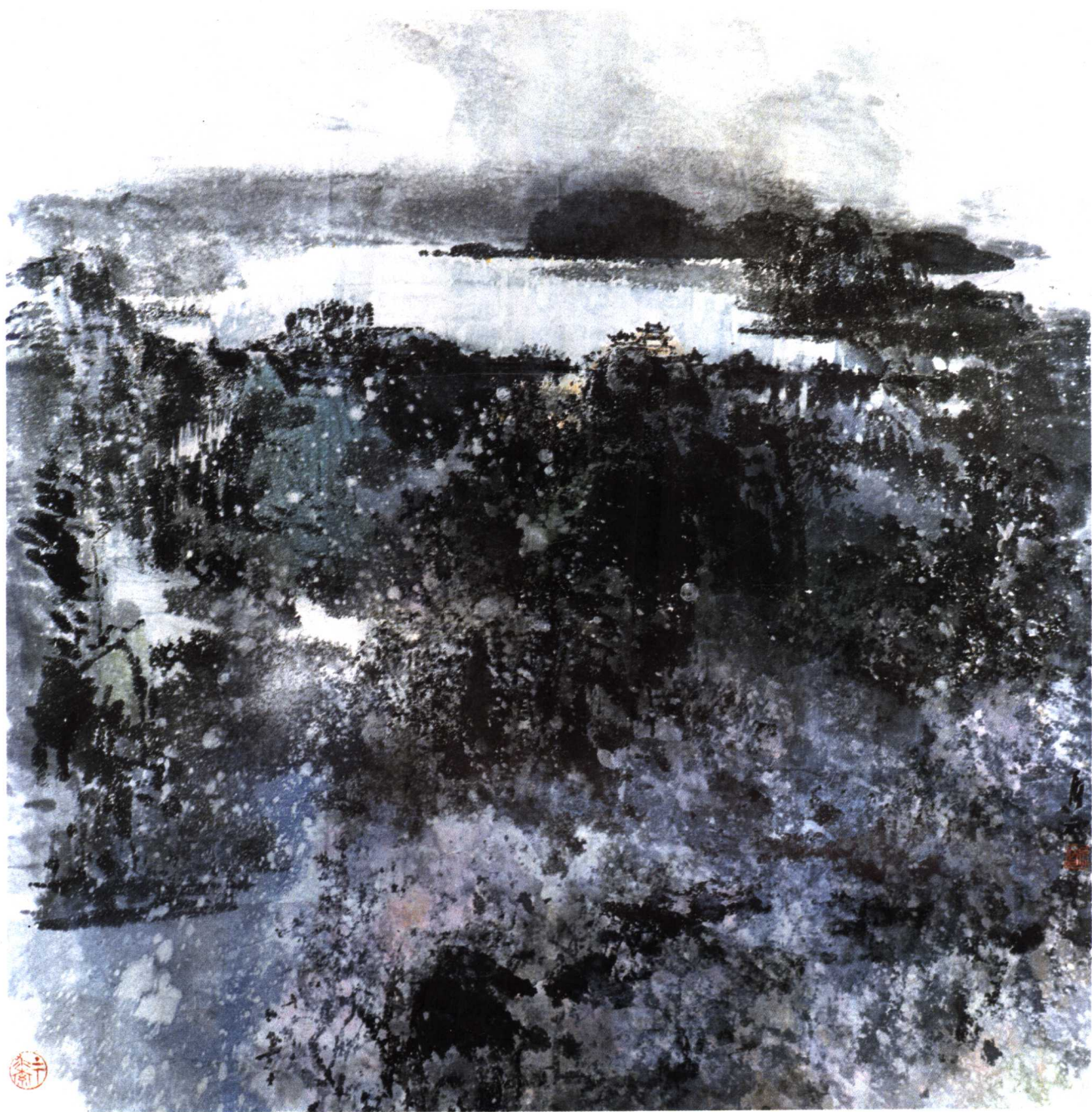
春月 (97×97cm) 1985年 Spring Moon.