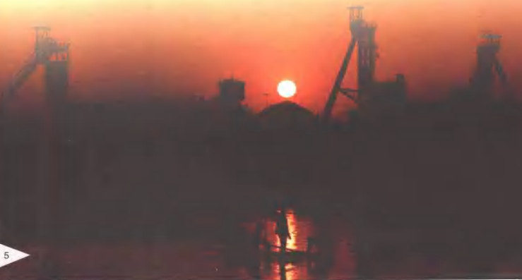
矿山晨曲 morning of mine