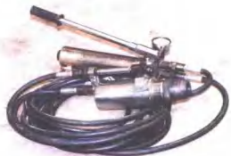
锚索拉力计 Anchor tension test gauge