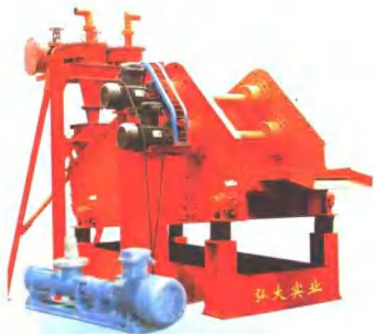
煤泥回收设备 reclamation equipment

Real strong machine electricity manufacturing industry