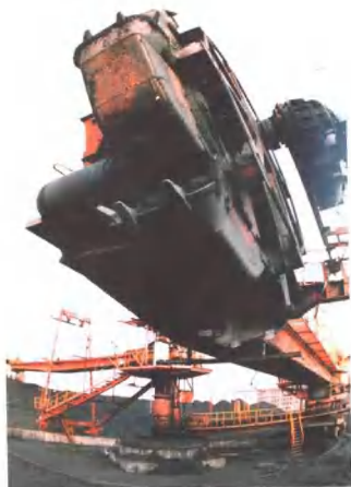
堆取料机 Heaping and taking materials machine