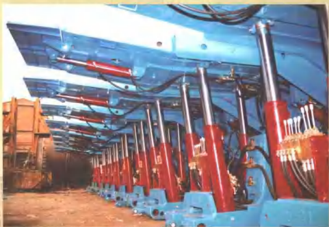
轻型液压支架 light hydraulic pressure pillar