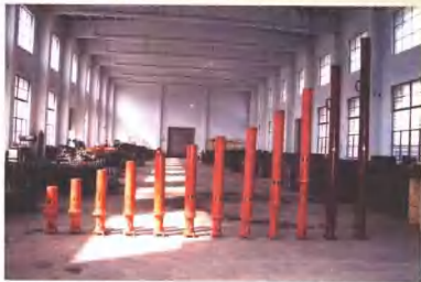
单体液压支柱 mono-hydraulic pressure pillar

Real strong machine electricity manufacturing industry