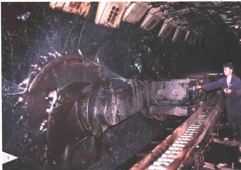
综采工作面 Multi-mining working face