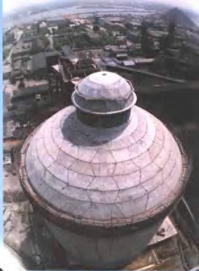
煤仓 coal storehouse