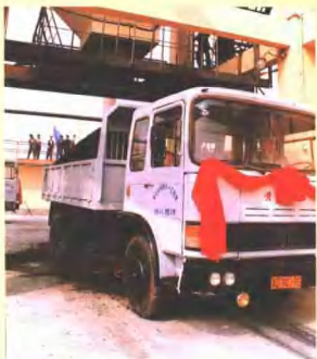
汽车装运 vehicles transport