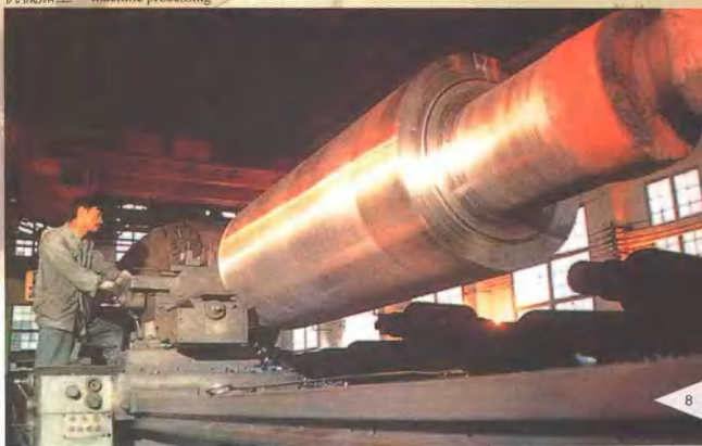
机械加工 machine processing