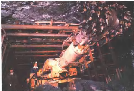
综合掘进机组 Multiple Tunnelling Unit