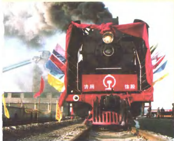
自备火车运输线 Self-provided railway transport