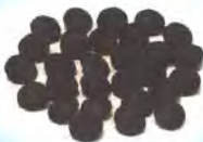
型煤 Section coal