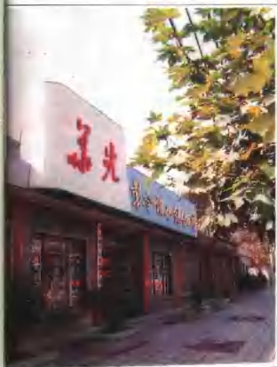
▲服务优良的华光制冷设备销售公司。 Huaguang refrigeration equipment sales company provides an excellent service.

Since 1989, the Team began to adjust the internal structure. By the end of 1993, the external management system has been formed where the six economical bodies represented by Yaohua restaurant, Xin'an automobile repairing factory, drawing factory, Huaguang refrigeration equipment sales company, reception office, geophysical prospecting and surveying office are regarded as the pillars. In 1993, Xin'an automobile repairing factory introduced the high-tech patent "W" engineering—interference installation of automobile engine which is highly recommended by the National Education Commission. The drawing factory owns the advanced laser printing system which provides the stamina for the development of the enterprise.