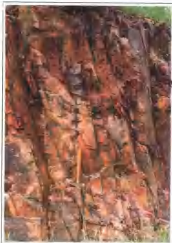
野外地质调查。 Field geological investigation