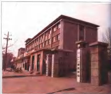
▲科教中心大楼。 Building of science and education center

In 1990, the Center was conferred the title of "The Advanced Masses for Adult Education" by the municipal government of Xingtai city. In 1991, it was awarded the title of "The Advanced Masses in Education Work during the 7th-five-year period" by the First Prospecting Bureau.