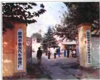
► 新安汽车修理厂。 Xin'an automobile repairing factory