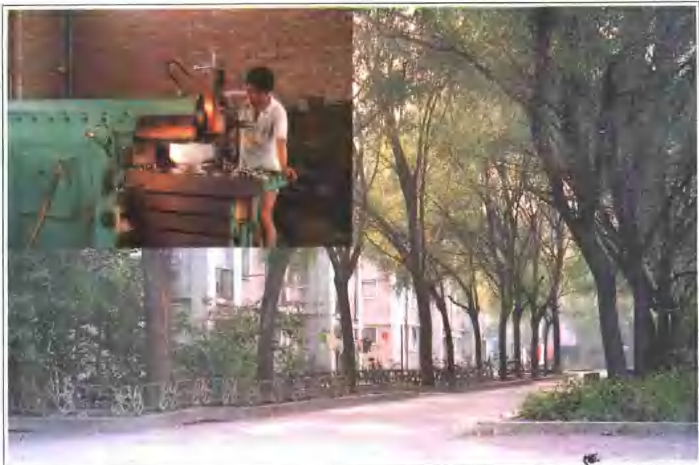
▲绿树成荫的 173 队职工生活区和机修厂。

No. 173 team's life district of staff and workers and mechanical repairing factory shaded by green trees.