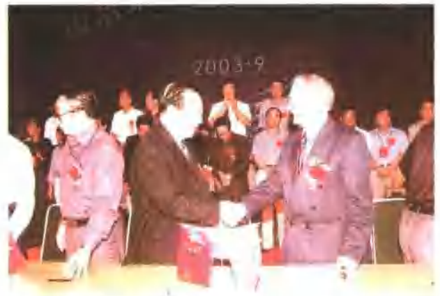
公司与外商签订合作项目 Signing cooperation contract with foreign trader.