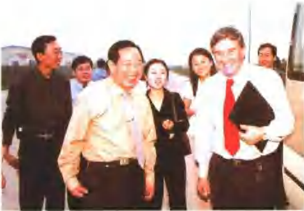
澳大利亚客商来公司考察合作项目 Australian trader visit Taigang to review cooperation project.