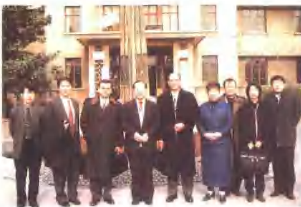
公司领导与外商合影留念 Taigang leaders take picture with foreign guests.