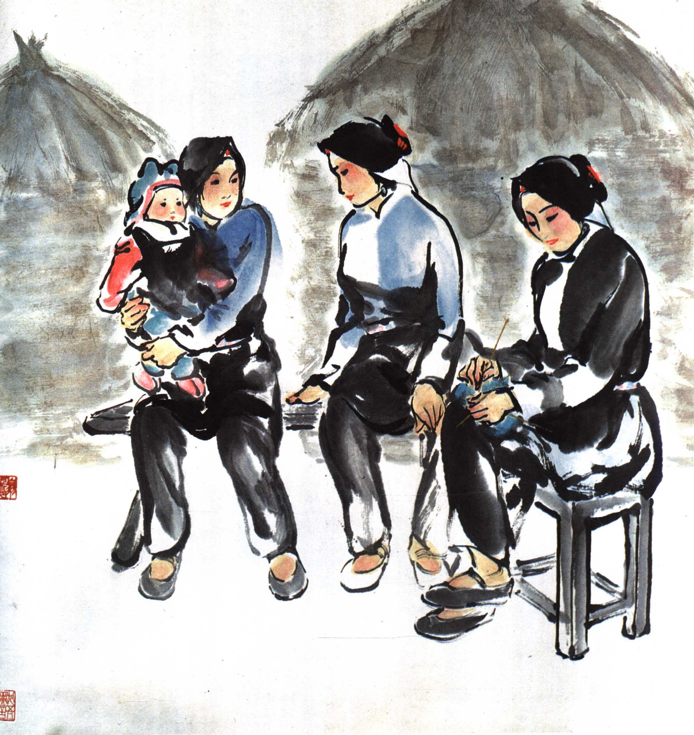
磨場上 (46×69cm) On the Threshing Ground.