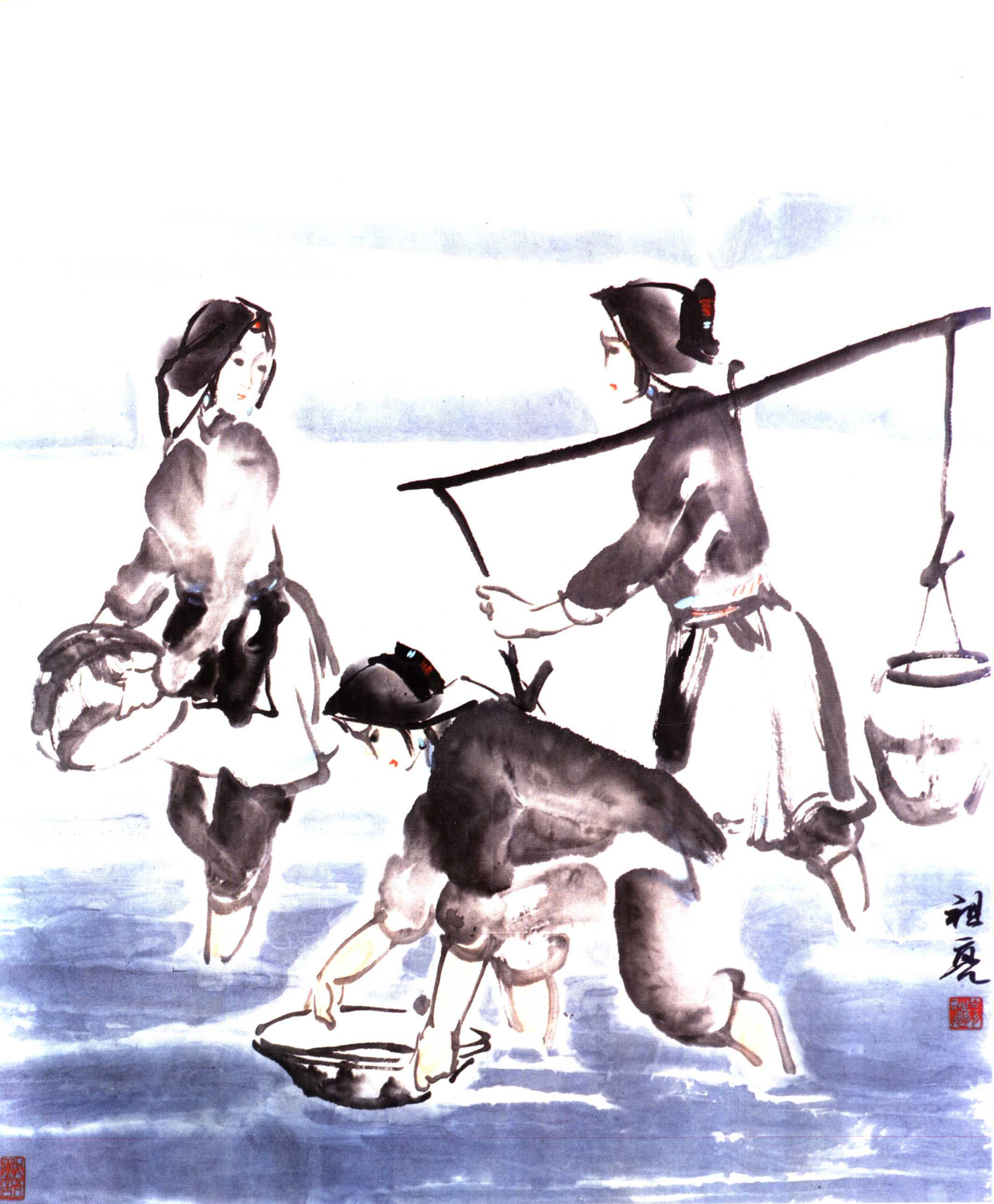
汲水图 Drawing Water.