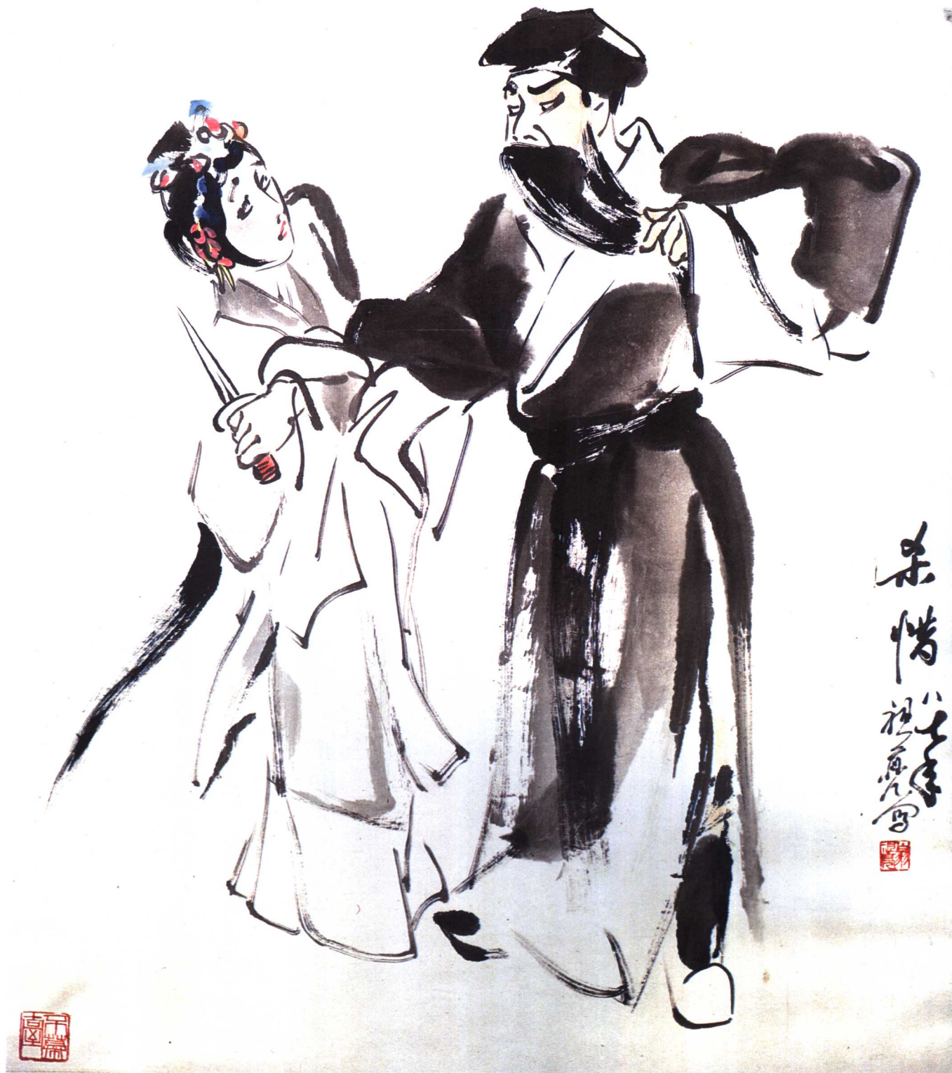
殺惜 (69×80cm) Song Jiang Kills His Concubine, Beijing opera.