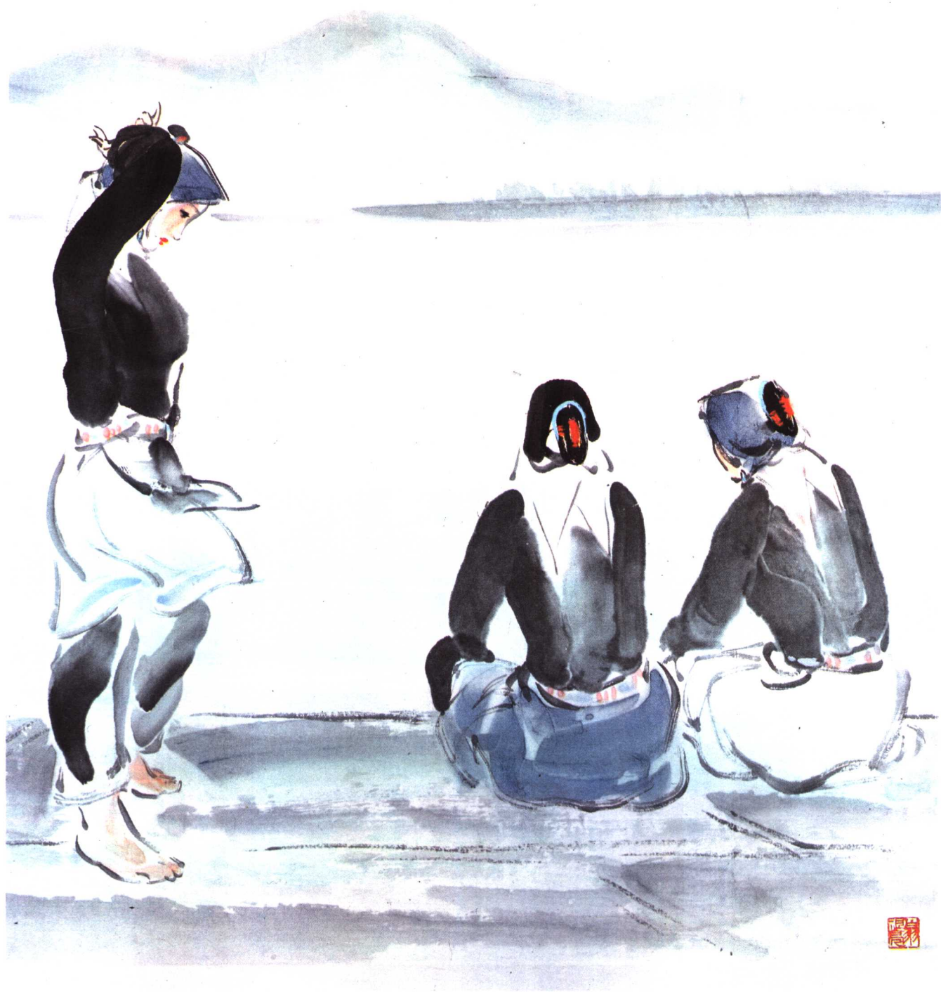
河埠頭 (69×69cm) At the Ferry.