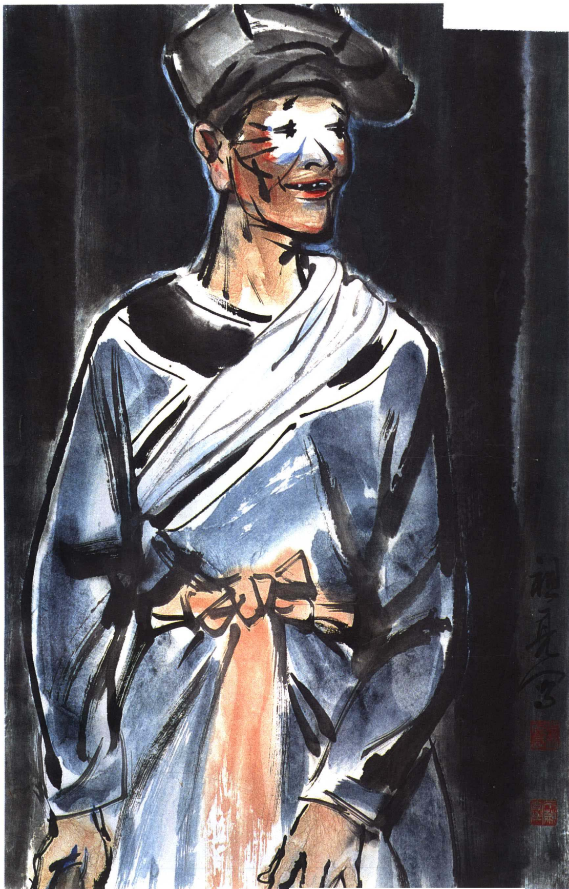
小丑 (46× 69cm) A Clown.