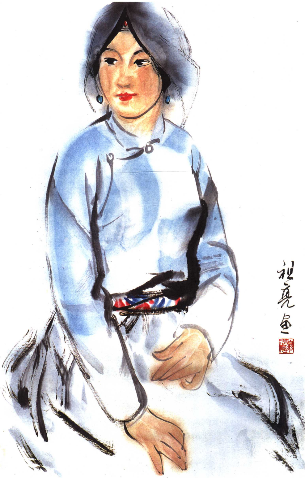
蘇州村婦 A Village Woman of Suzhou