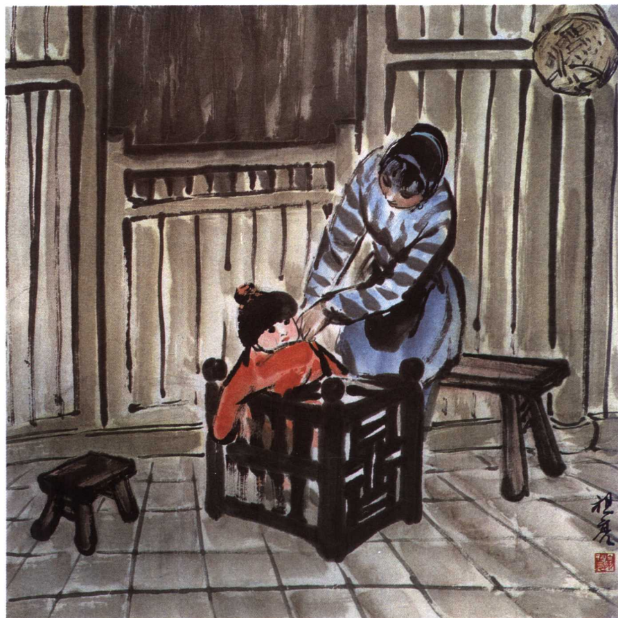
母與子 Mother and Child.