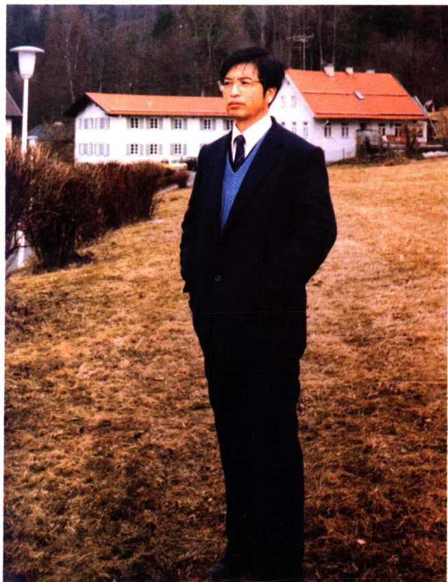
畫家像 Weng Zuliang

畫家翁祖亮1929年生於浙江省建德縣。1952年畢業於中央美術學院華東分院(今浙江美術學院)。曾任美術編輯,現為浙江書院畫師、中國美術家協會會員、中國美協浙江分會理事、副研究館員、浙江美術評論研究會理事、浙江中國人物畫研究會成員。原學油畫,後改畫中國畫。曾從師林風眠先生,並得席德進之輔導,探索中西融合之藝術道路。擅長表現蘇州農村生活和傳統戲劇人物,造型與用筆、用色有自己的特點。作品曾在國內外展出,1989年出訪德意志聯邦共和國,講學並展出作品,德國《奧格斯堡日報》曾發表其代表作,有的作品被國外收藏。1988年曾參加臺灣《雄獅》美術舉辦的兩岸文化人士筆談文化交流。歷年來發表的美術評論文章和美術專業方面的譯著十幾萬字,大都為國內重要美術刊物或美術出版社所刊用,評論文章有自己獨到的見解與深度。