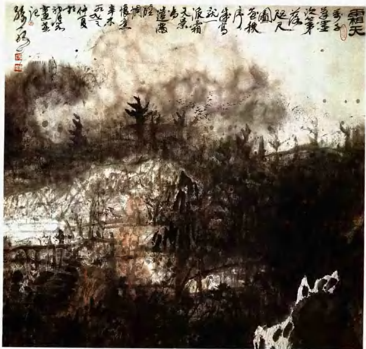
霜天 (75×75cm) 1991年 Frosty Weather.