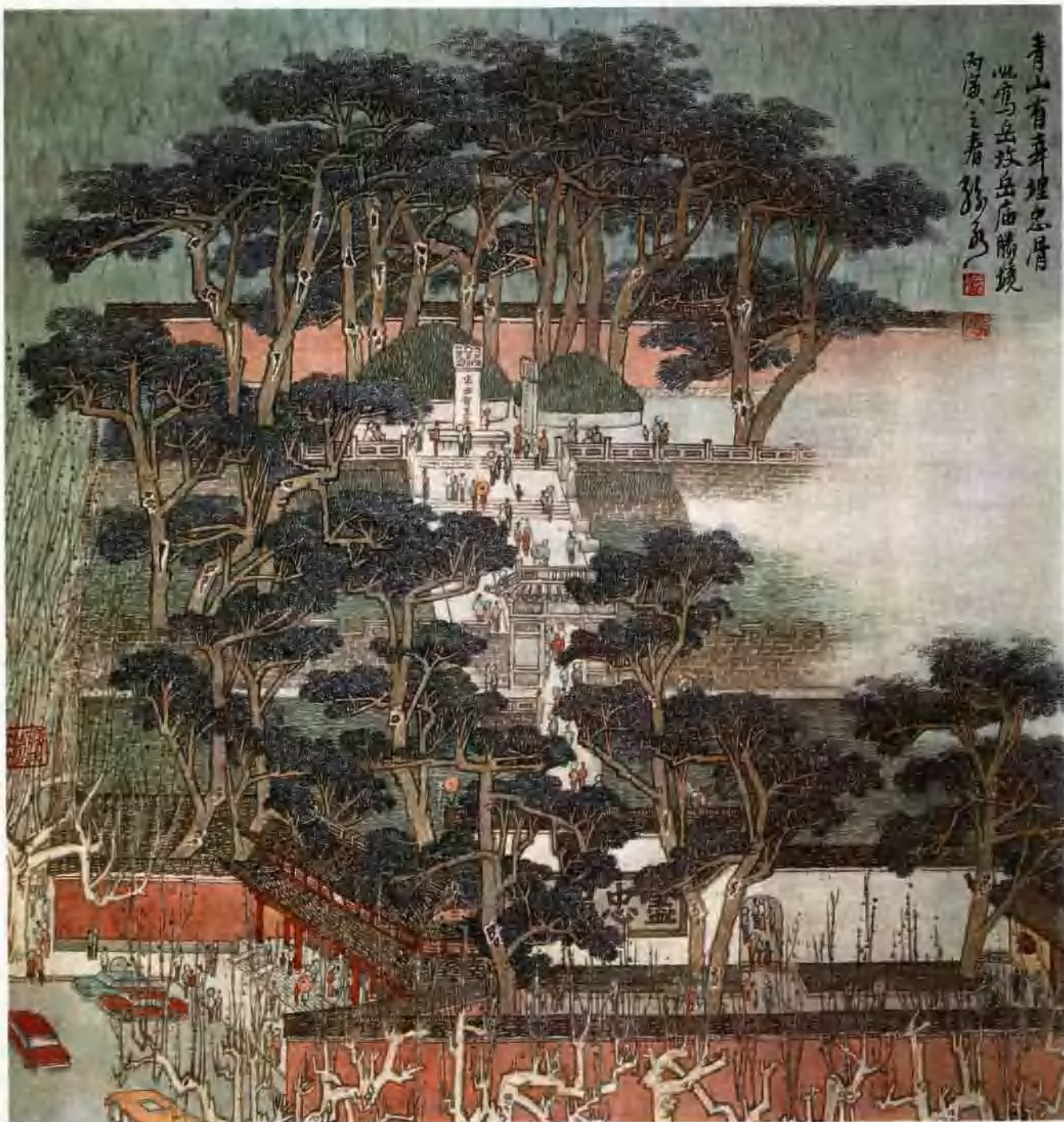
青山有幸埋忠骨 (70×70cm) 1986年 Loyal Souls Rest in the Green Mountain.