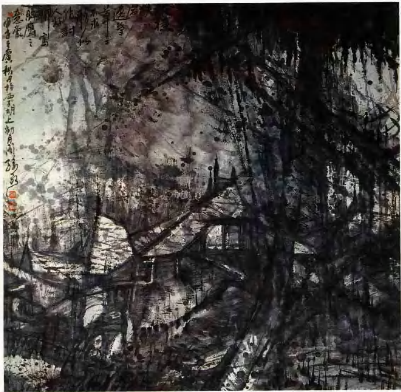
寫意山水 (90×90cm) 1984年 A Freehand Landscape.