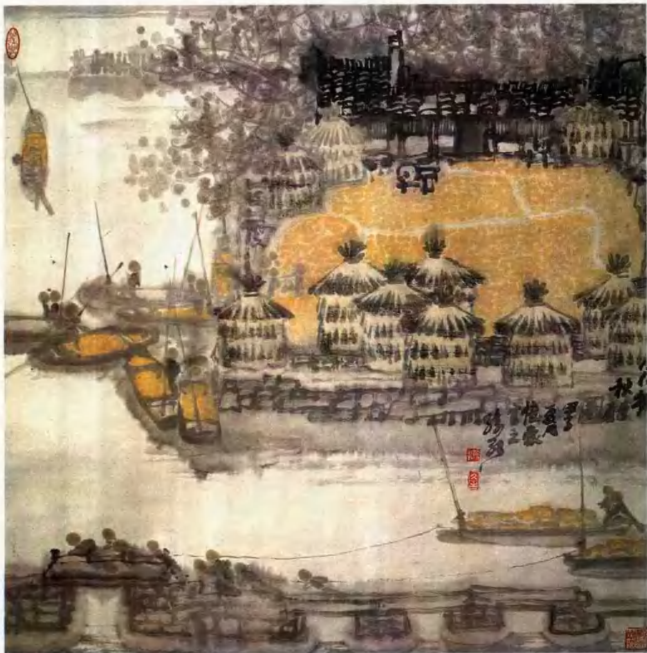
水鄉秋酣圖 (75×75cm) 1984年 Autumn of a Waterside Village