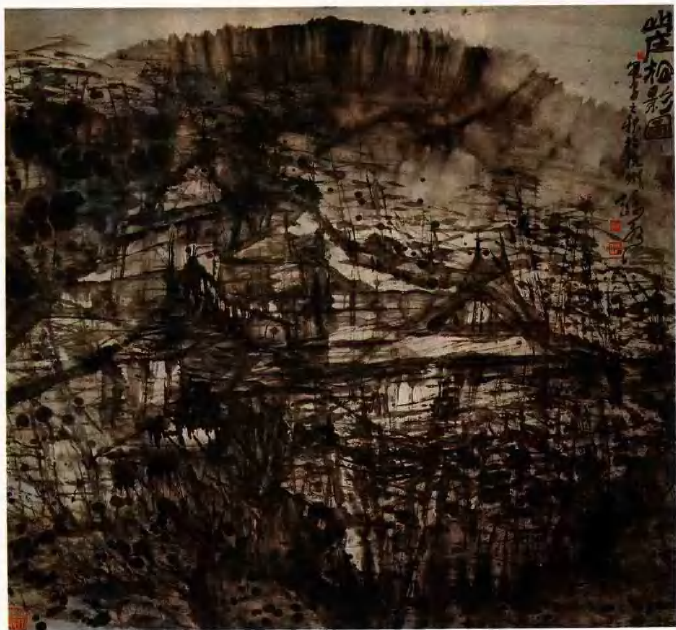
山庄松影 (95×90cm) 1984年 Mountain Village.