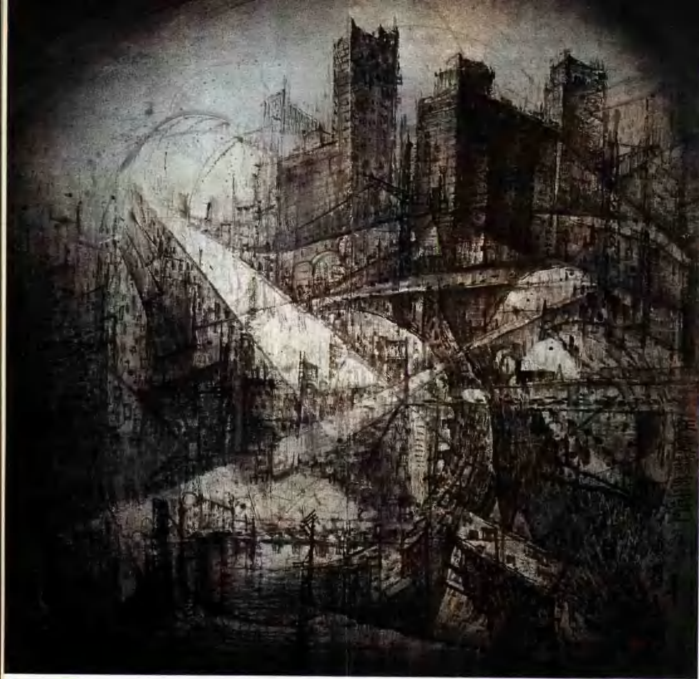
在復蘇的土地上 (135×135cm) 1985年 On the Awakening Land.