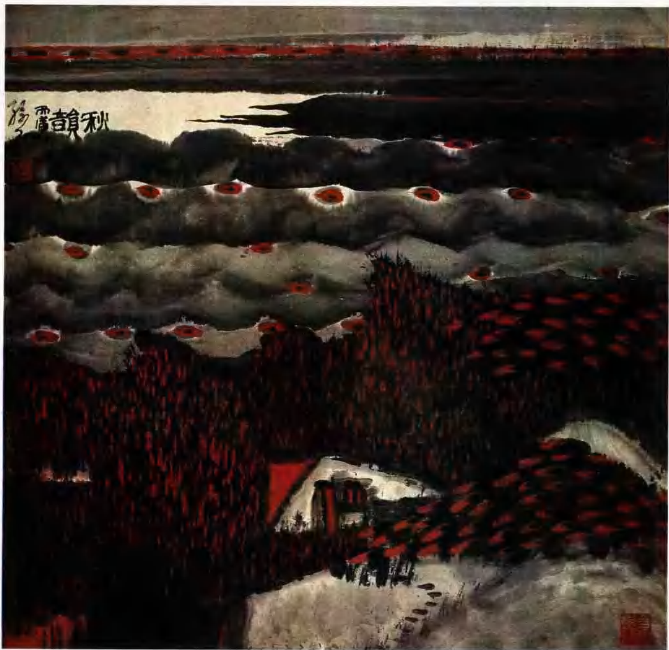
秋韵 (75×75cm) 1986年 Charm of Autumn.