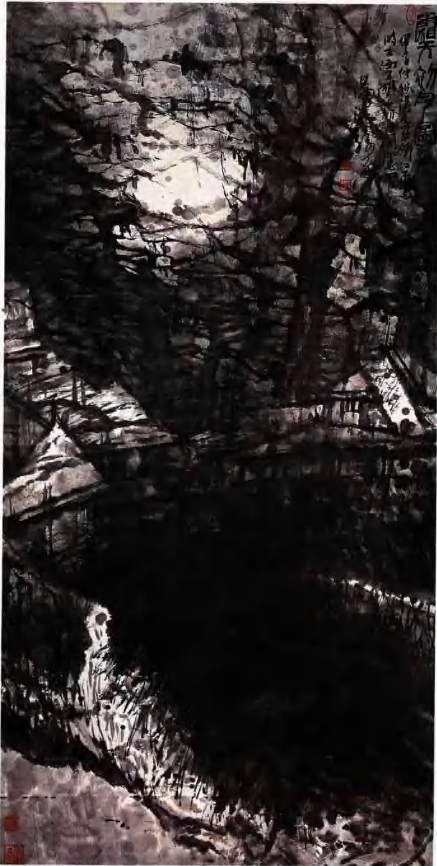
霜天初月 (135×75cm) 1984年 Frosted Moon.