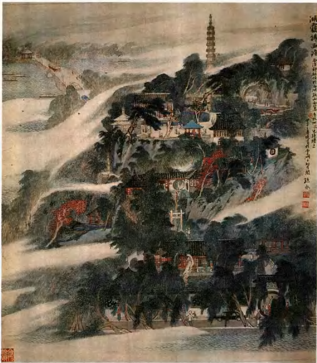
湖雾拂西冷 (83×75cm) 1984年 Veiled in Mist