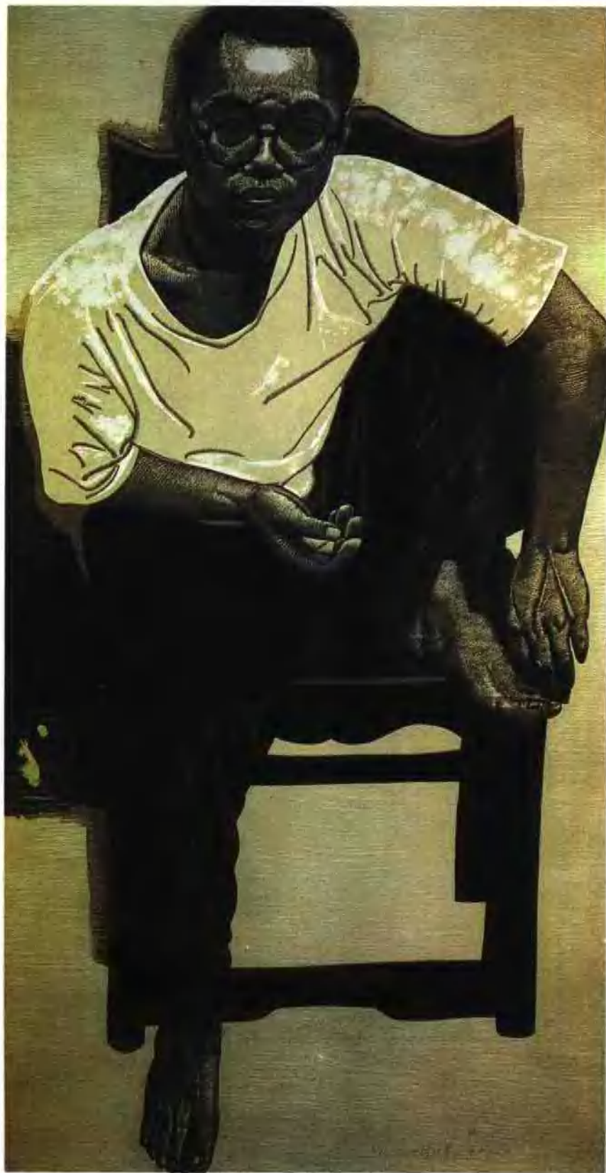
青年教師 Young Teacher.