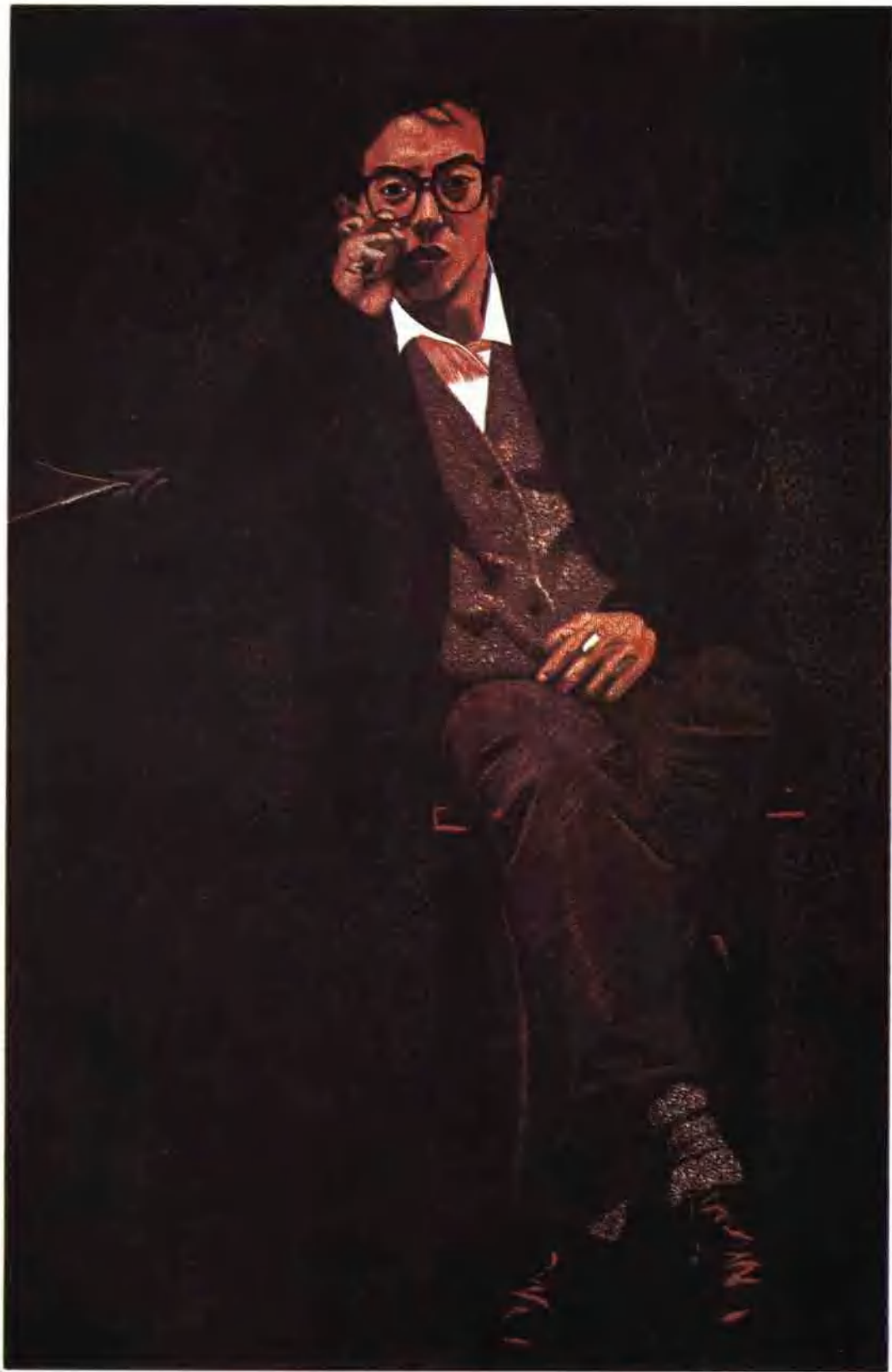
整潔的男人 A Neatly Dressed Man.