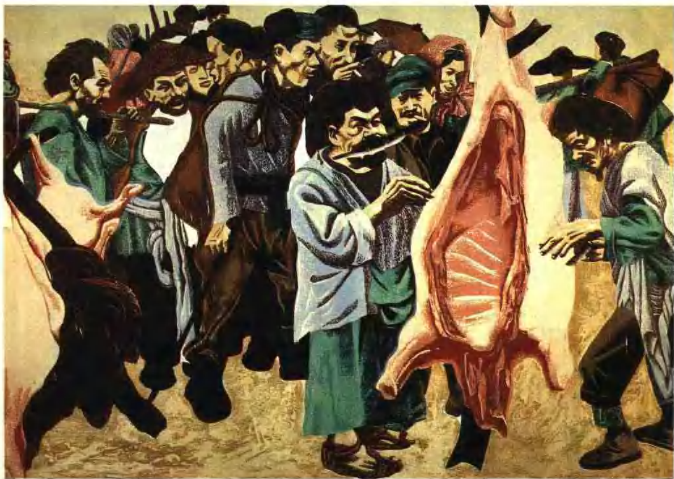
槐樹 Pagoda Tree.