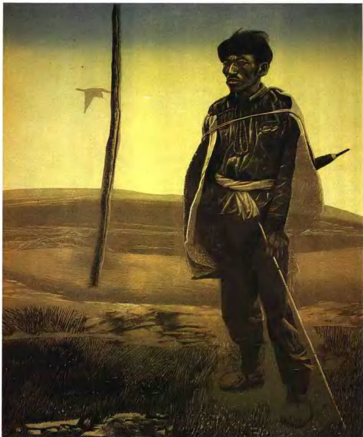
牧人 A Herdsman.