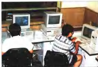
▲ 清華大學銳曼有限公司邯鄲分公司是業高新技術科研、生產、銷售為一體的聯合體，主要從事能源、通訊、電子計算機自動化等領域的技術開發和推廣

Damen county fur craft factory introduced sheep skin fine hair sticking technique from national patent and produced more than 50 craft products of carpet, hang carpet, sitting mattress and bed mattress and so on, good looking and all exported, creating foreign funds of more than 3 million USD.