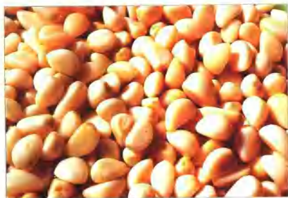
◀永年縣是河北省出口大蒜的主要產區，全縣種植面積3萬多畝，年產量1.7萬多噸，年出口量為1500噸，并陸續增加了成蒜米、甜大蒜片、蒜粉等係列產品的出口。

Weixian county has long history of planting duck-pear. At present, there are 150,000 Mu of pear garden, producing over 1 billion kg duck-pear every year. Since 1959, they have been exported with the trade mark "Tianjin duck-pear". The highest yearly exporting quantity is up to 7500 tons.