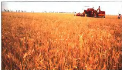
◀ 哈爾濱地區有“巨庫”之喻，糧食以小麥、玉米、谷子、大豆為主，小麥居糧中之首。

Harbin Prefecture has been likened to "Great Bait" in the history. Wheat, corn, millet and soybean are main cereal crops of the district and wheat is the chief crop.