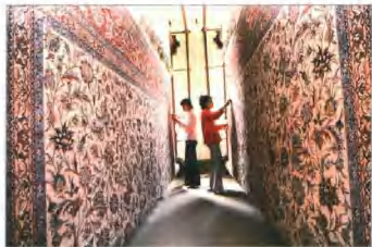
◀ 成安地毯總廠，具有地毯加工的整套工藝技術和生產能力。年產地毯 6 萬平方米，70 多個花色品種，是河北省地毯出口定點廠家之一。

Cheng'an Carpet Factory has the ability of carpet manufacture and production with a set of process technique. It has yearly production of 60,000 square feet and more than 70 kinds of product and is one of the appointed factories for carpet export in Hebei province.