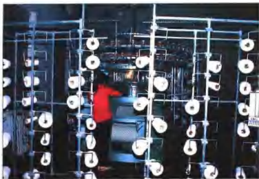
◀廣平縣針織廠購買台灣單、雙面產能針織大圓機，生產汗布、棉毛布、羅紋彈力布，年產 500 噸以上

The knitting factory in Guangping county purchases single and double sides all-purpose knitting machine made in Taiwan for producing Han cloth, cotton cloth and knitting stretch cloth. The yearly production is over 500 tons.