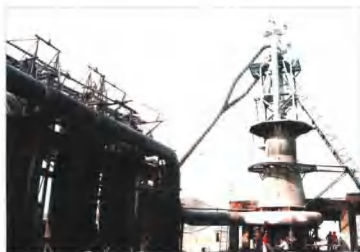
◀ 冶金是鄭州地區傳統行業，圖為豫鑫冶金公司煉鐵廠。

Metallurgy is the traditional industry of Zhengzhou area. The photograph of the Iron Metallurgy Company is shown in the picture.