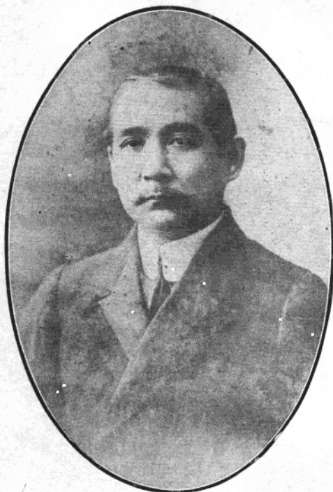
Dr. SUN YAT-SEN The Will of the Late Leader