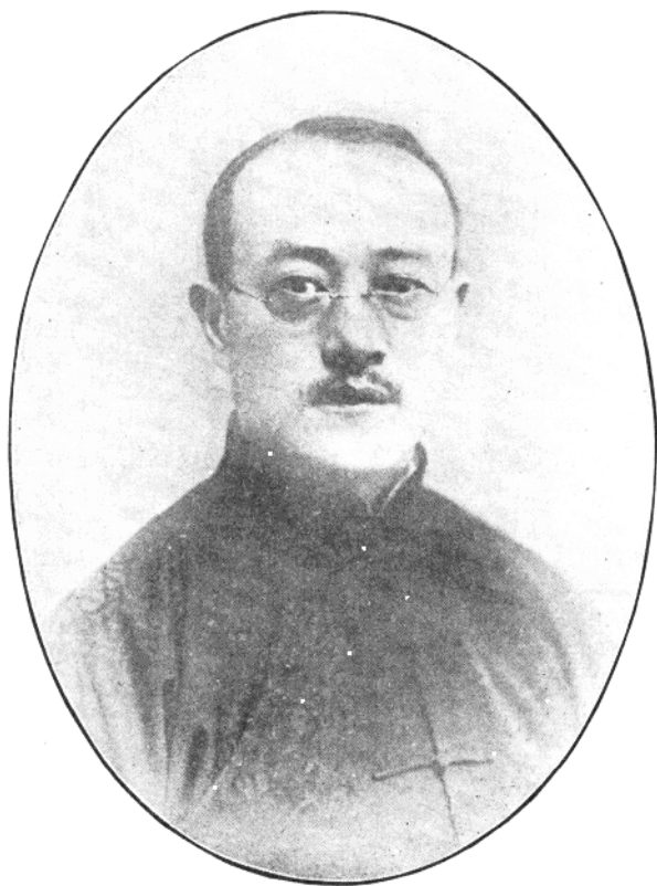
外 交 部 長 王 正 廷

His Excellency DR. CHENGTING T. WANG Minister for Foreign Affairs of the National Government of the Republic of China