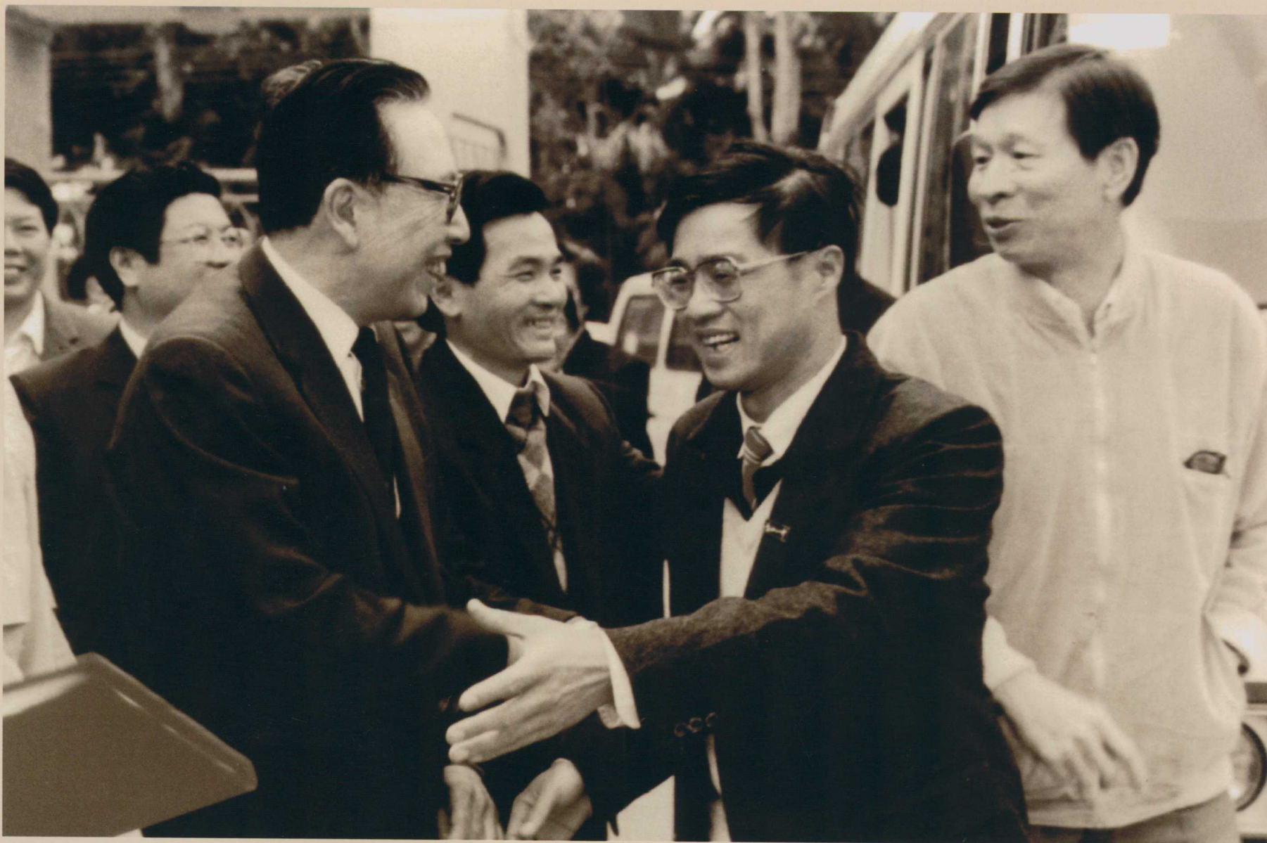
国务院副总理吴学谦（左一）侨务办公室主任廖晖（右一）等莅校视察 Wu Xueqian (L1), vice-premier of the State Council inspected Taishan No.1 High School.