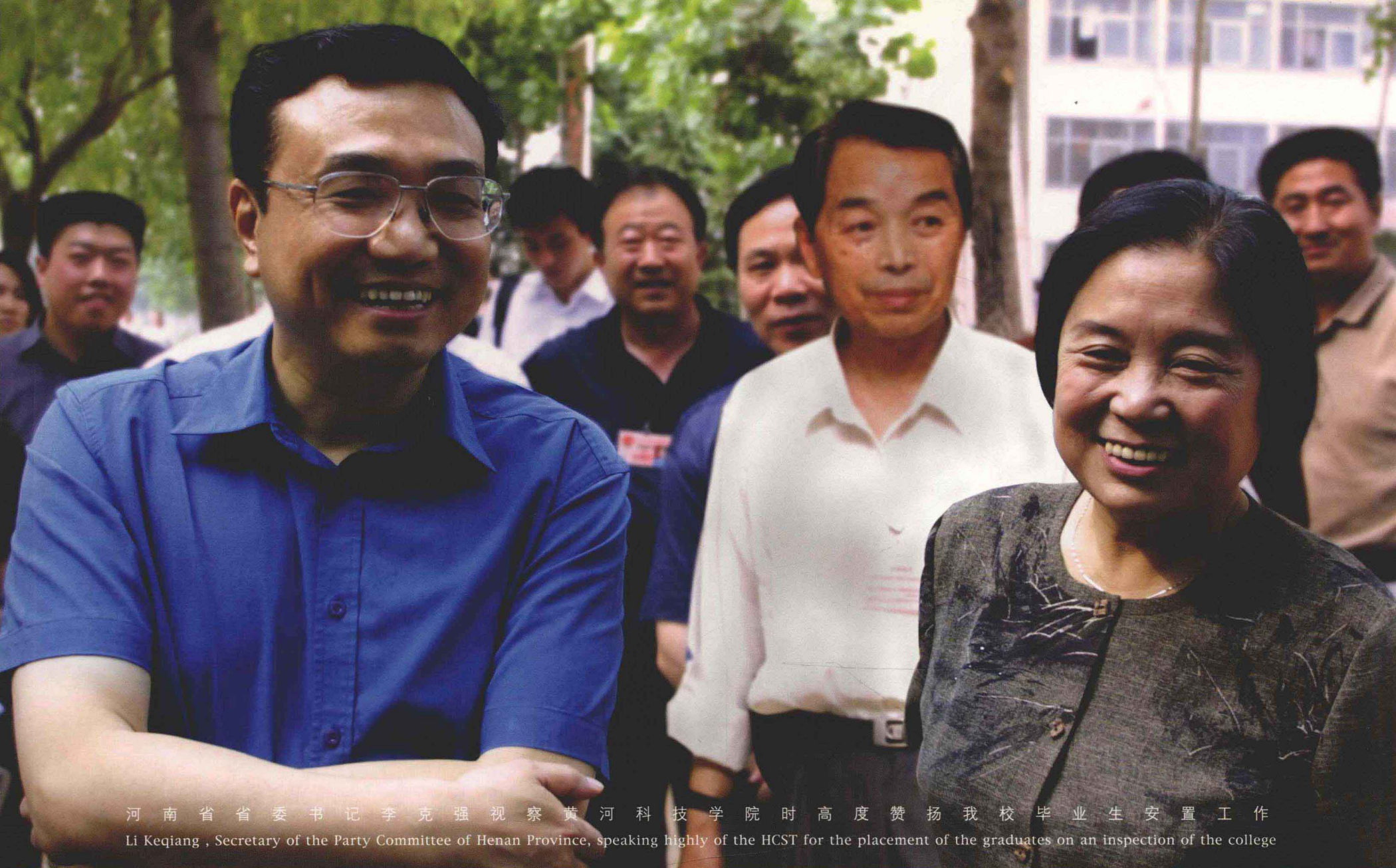
河南省省委书记李克强视察黄河科技学院时高度赞扬我校毕业生安置工作 Li Keqiang, Secretary of the Party Committee of Henan Province, speaking highly of the HCST for the placement of the graduates on an inspection of the college