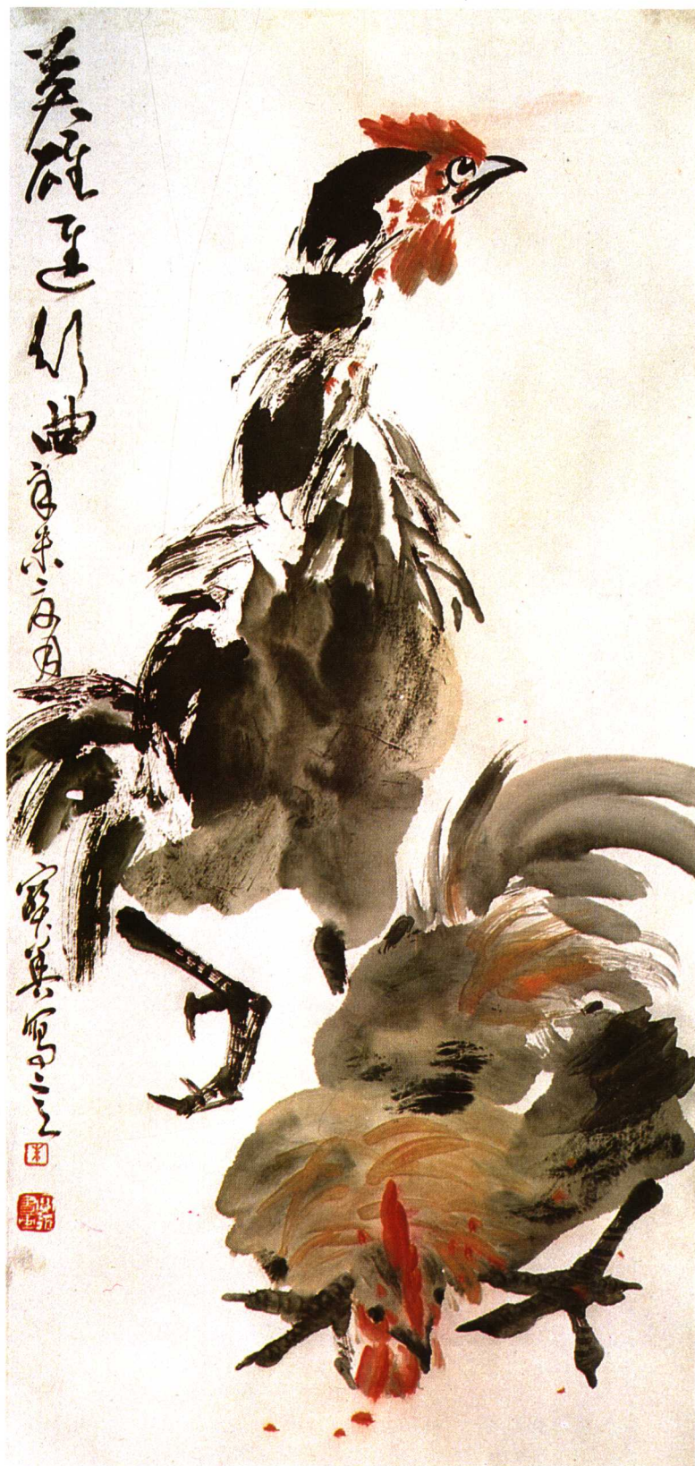
英雄進行曲 (44×90cm) 1991年 March of Heroes.