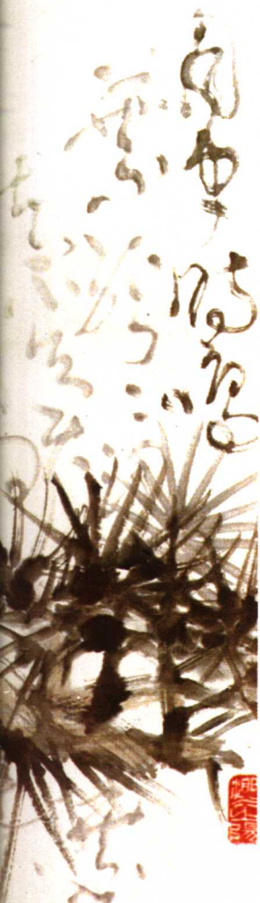
松鶴延年 (68×68cm) 1991年 Pine and a Crane.