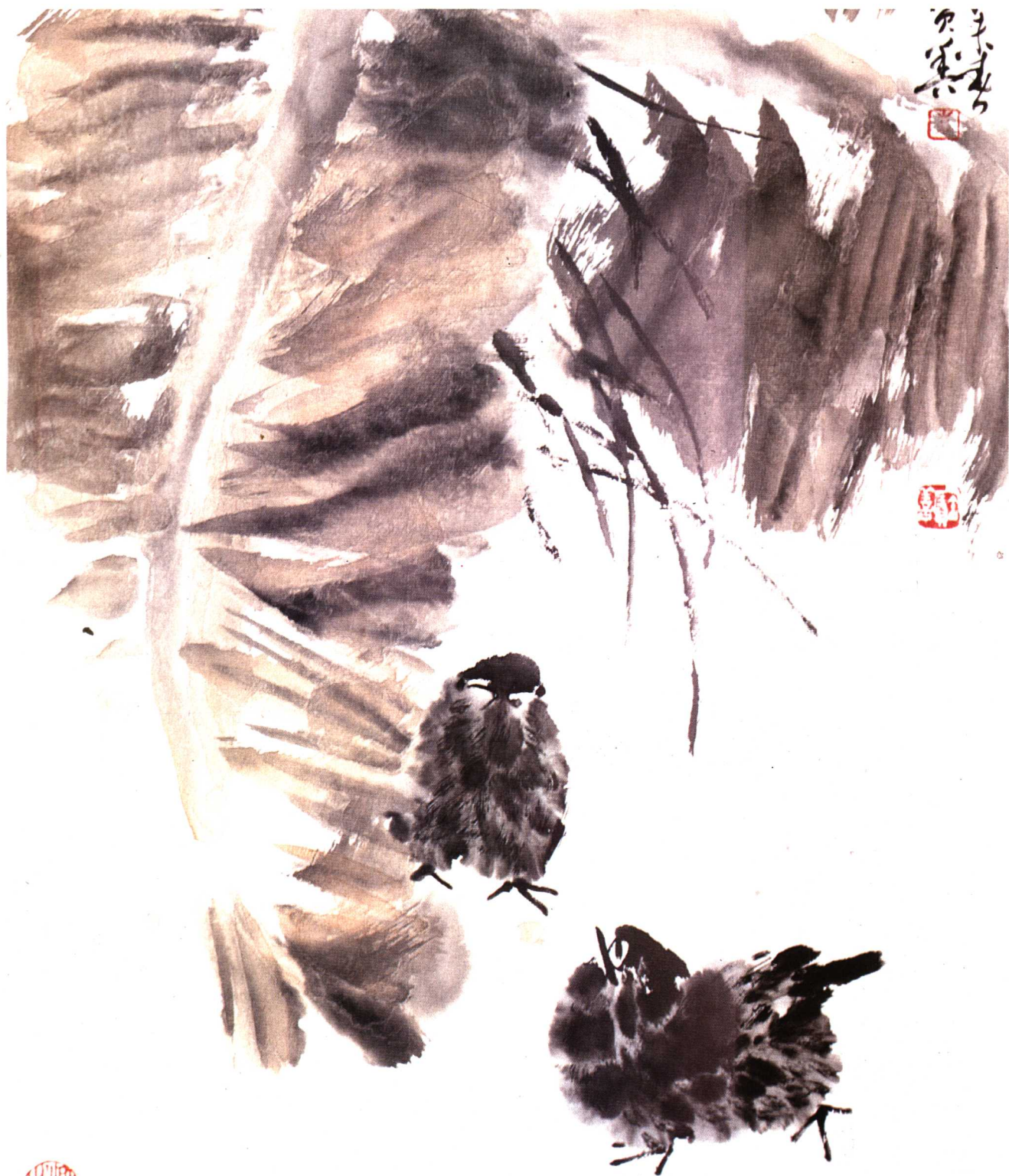
清霜 (44×60cm) 1991年 Thin Frost.