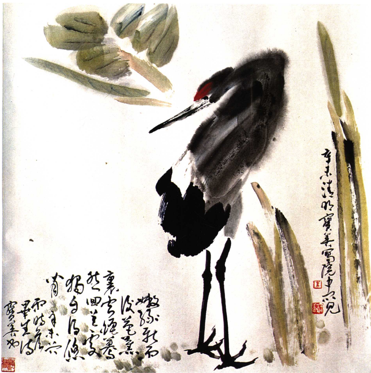
閑雲野鶴 (68×68cm) 1991年 Idle Clouds and a Wild Crane.