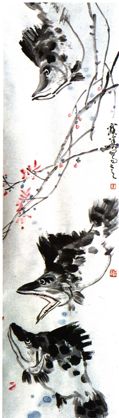
桃花流水鱖魚肥 (34×136cm) 1991年 Peach Blossoms, Flowing Water and Fat Mandarin Fish.