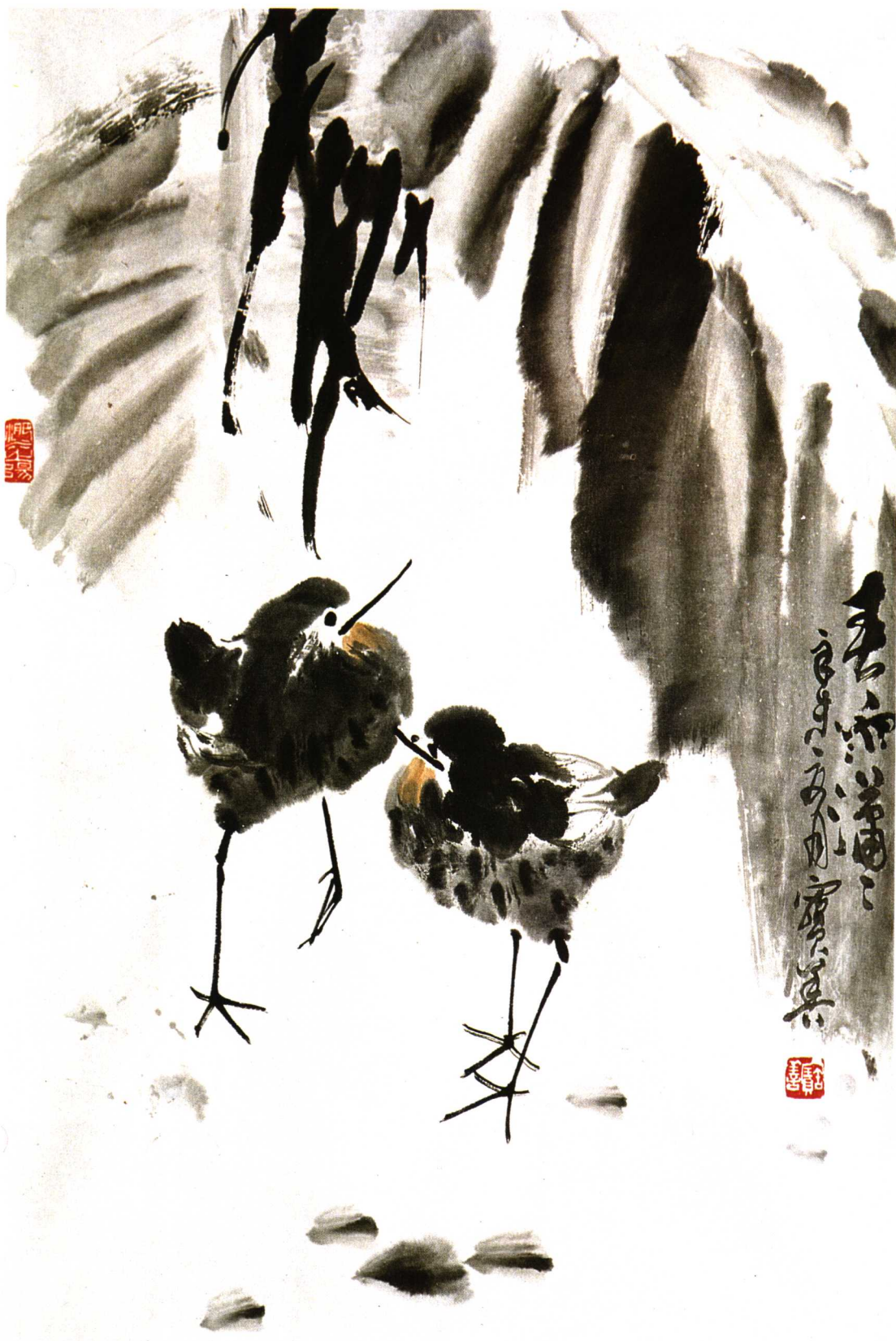
春雨潇潇 (44×68cm) 1991年 Spring Rain.