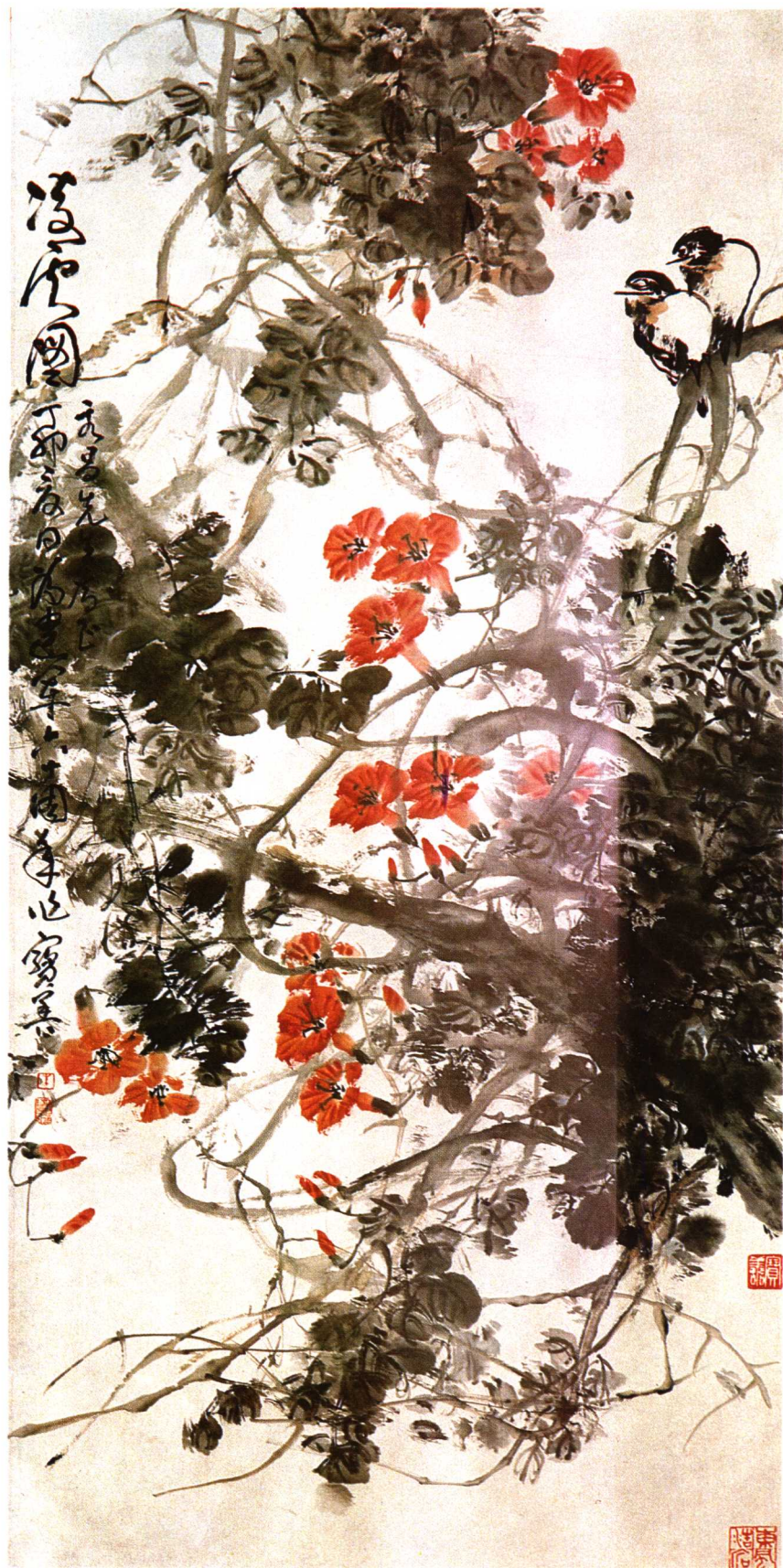
凌雲圖 (68×136cm) 1987年 Soaring Aspirations.