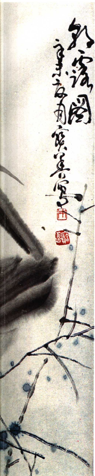
朝霞圖 (68×68cm) 1991年 Rosy Dawn.