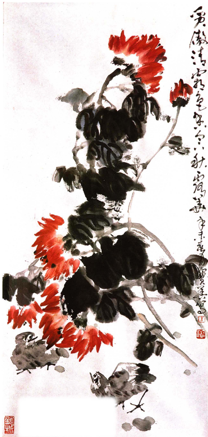
秋艳 (44×96cm) 1991年 Gorgeous Autumn.