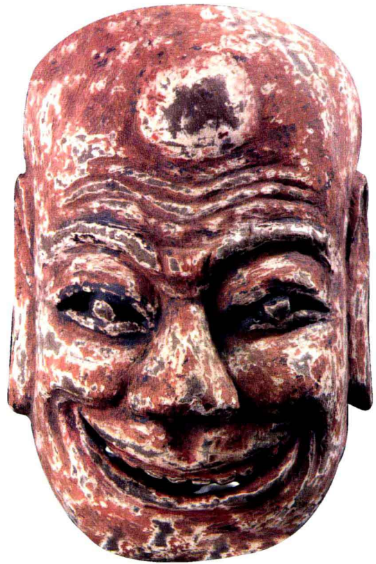
笑羅漢 xiao luo han