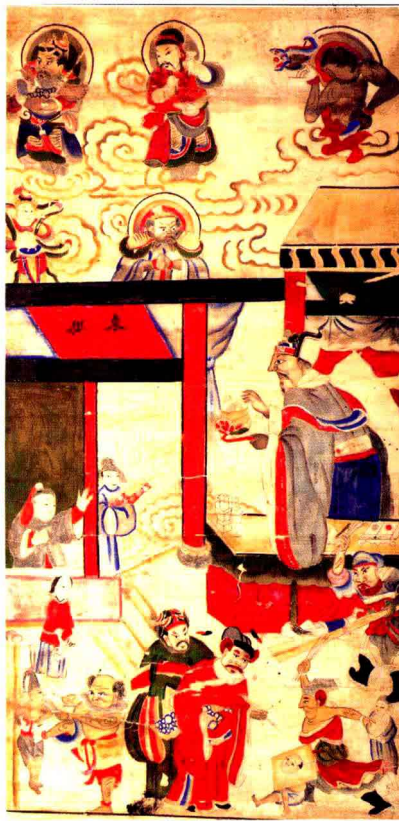
東岳 (2) dong yue