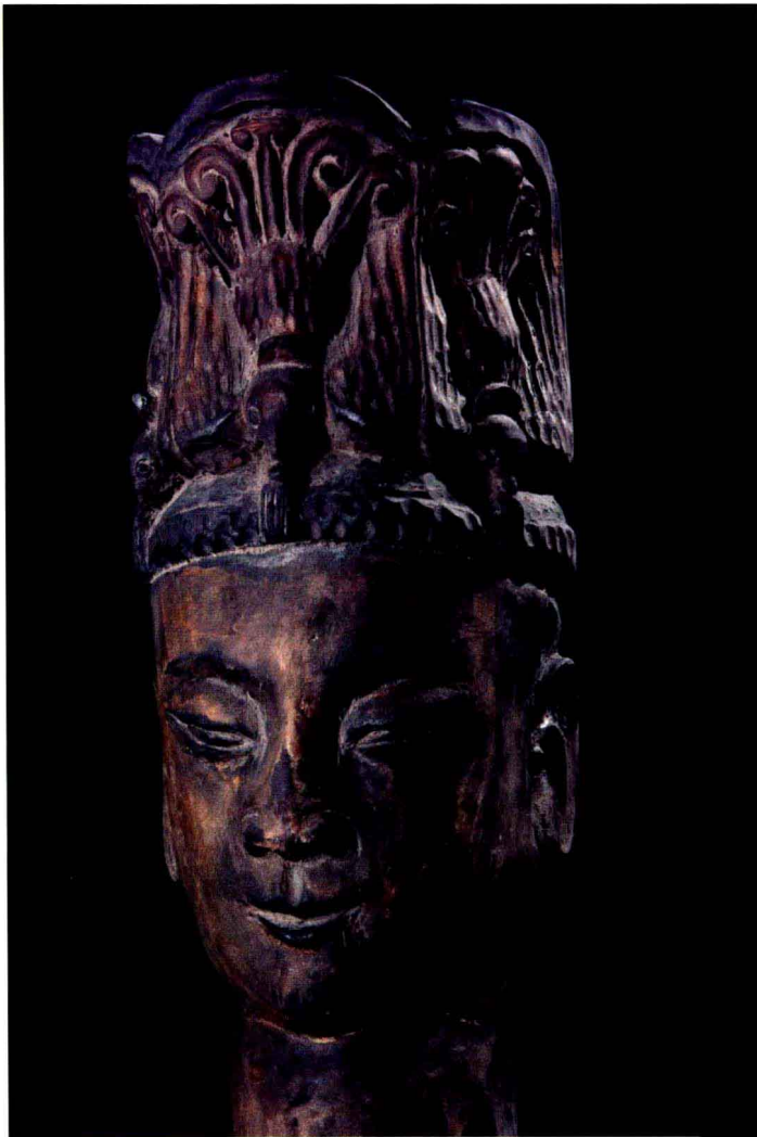
儺母 nuo mu