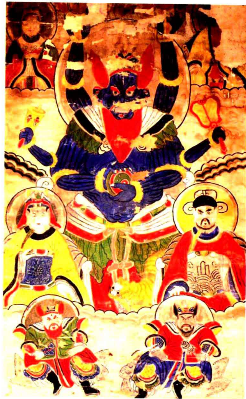
哪吒 na zha