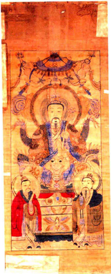
靈寶:三清之一 ling dao:san qing zhi yi