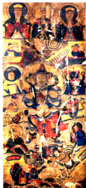
白龍太子 bai long tai zi