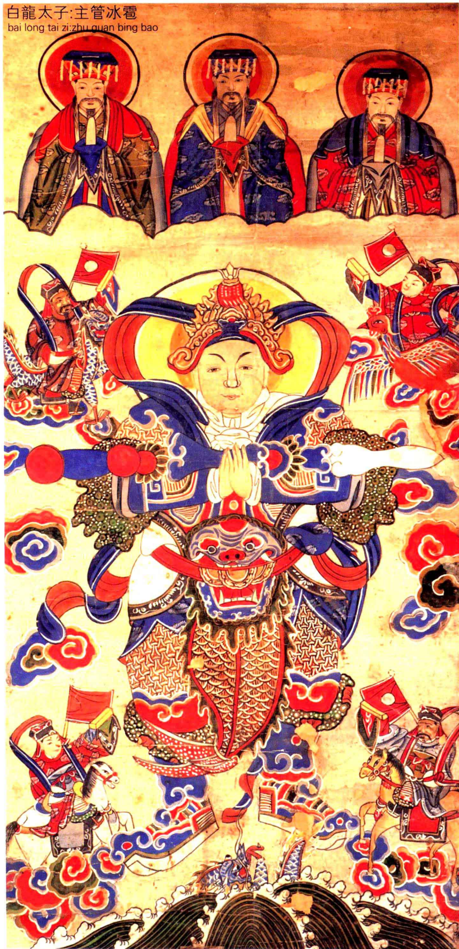
白龍太子:主管冰雹 bai long tai zi:zhu guan bing bao