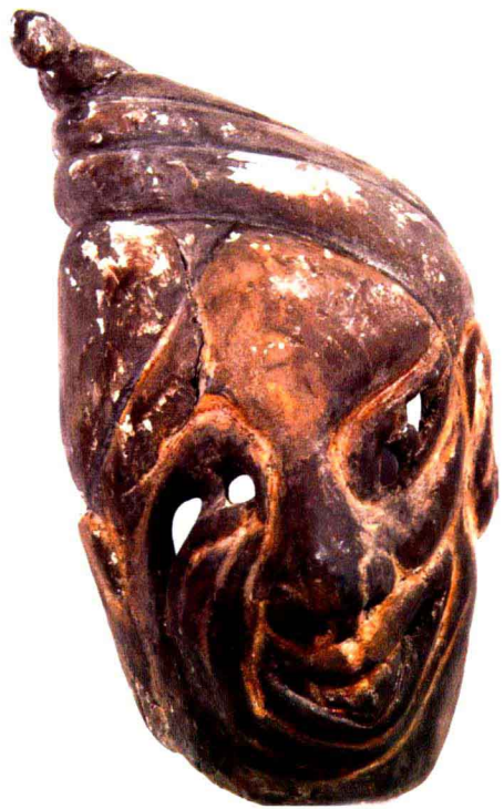
秋姑婆2 qiu gu po 2