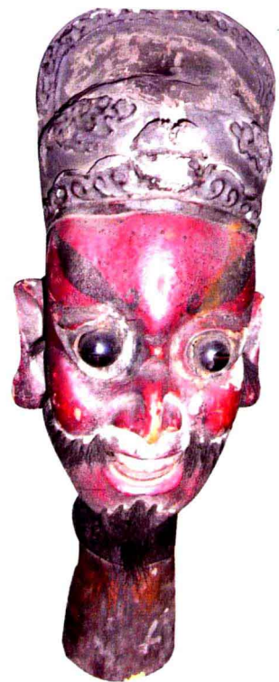
儺公3 nuo gong