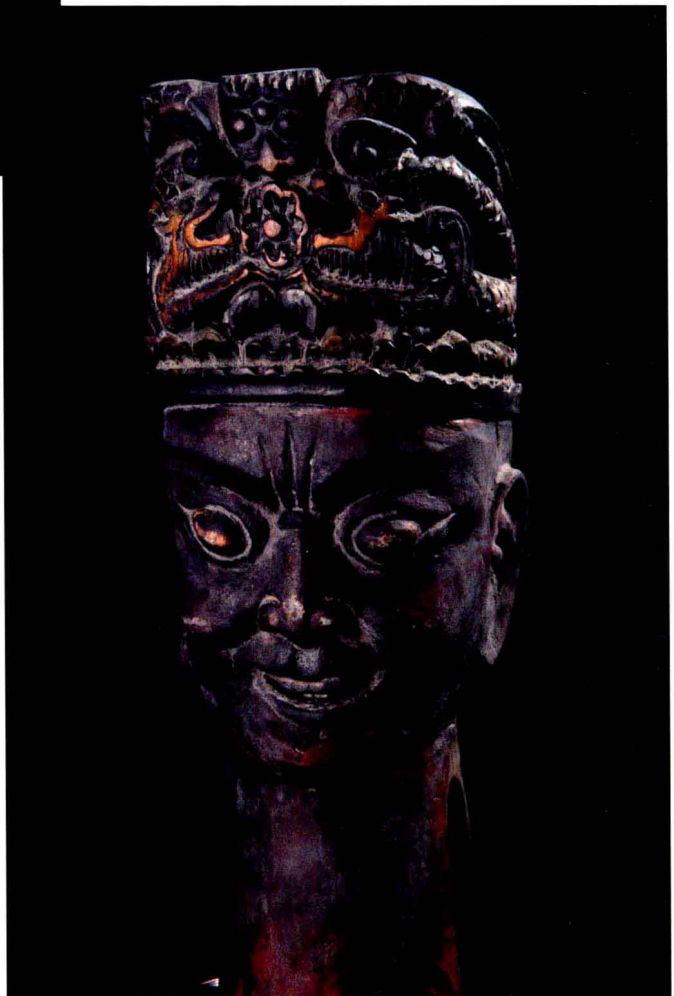
儺公 nuo gong