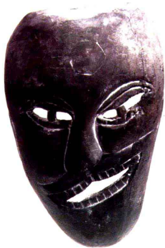
歪嘴秦儻2 wai zui qin tong 2