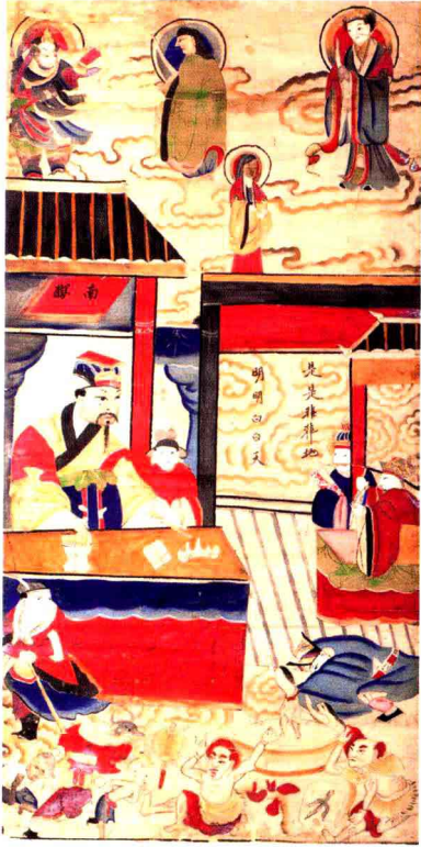
南岳 (2) nan yue