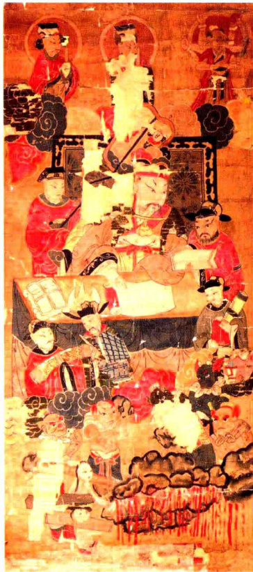
東岳 (1) dong yue