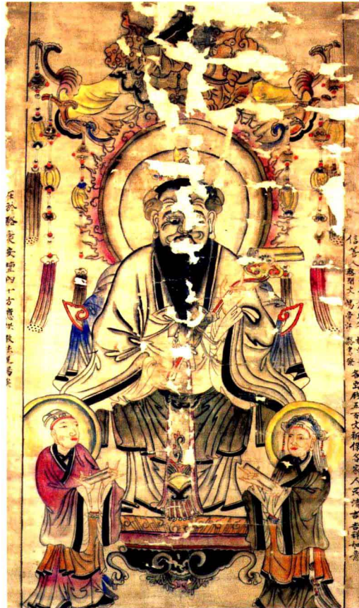
黑神:主管降雨 hei shen:zhu guan jiang yu