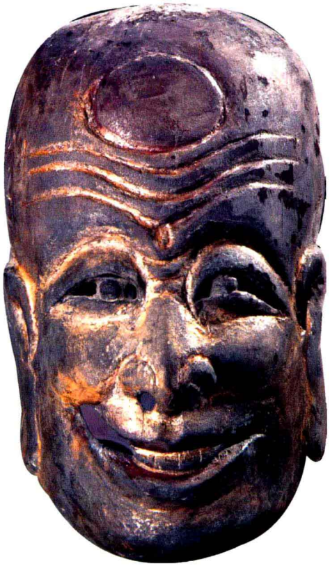
和尚 he shang