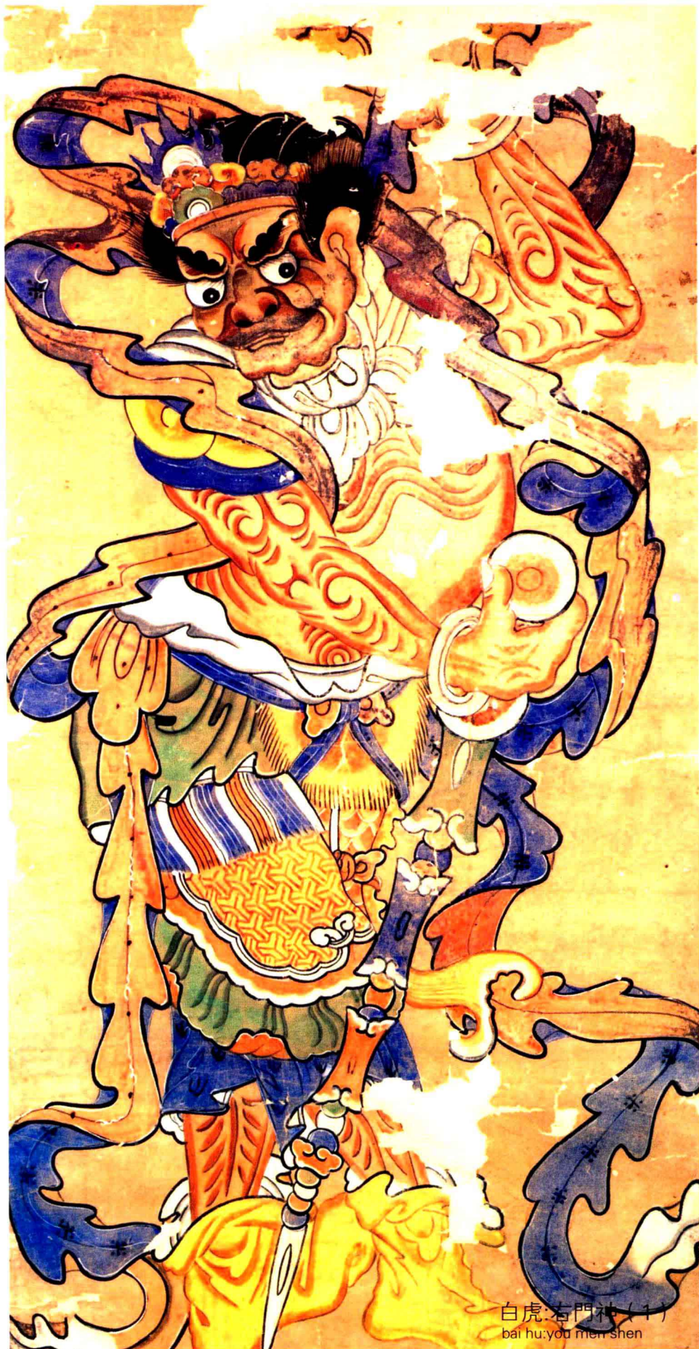
白虎:右門神(1) bai hu:you men shen