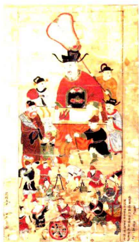
城隍:管理夫子 cheng huang:guan li fu zi