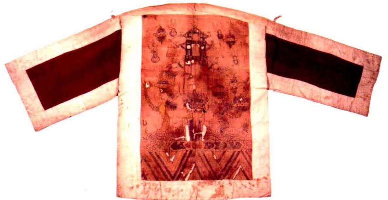
儼服飾 nuo fu shi