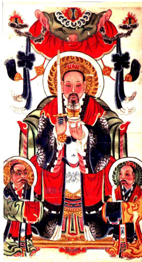
東岳 (五岳之首) 主管生 dong yue(wu yue zhi shou)zhu guan sheng