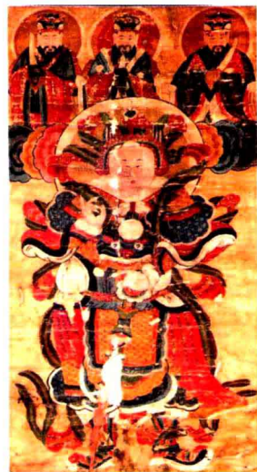
白虎:右門神(2) bai hu:you men shen