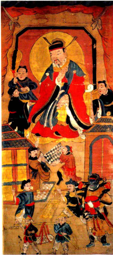
庫官 ku guan