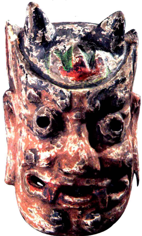
龍三 long san