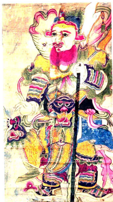
青龍:左門神 ( 3 ) qing long:zuo men shen