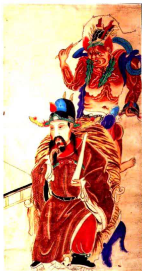
北門七星 bei dou qi xing