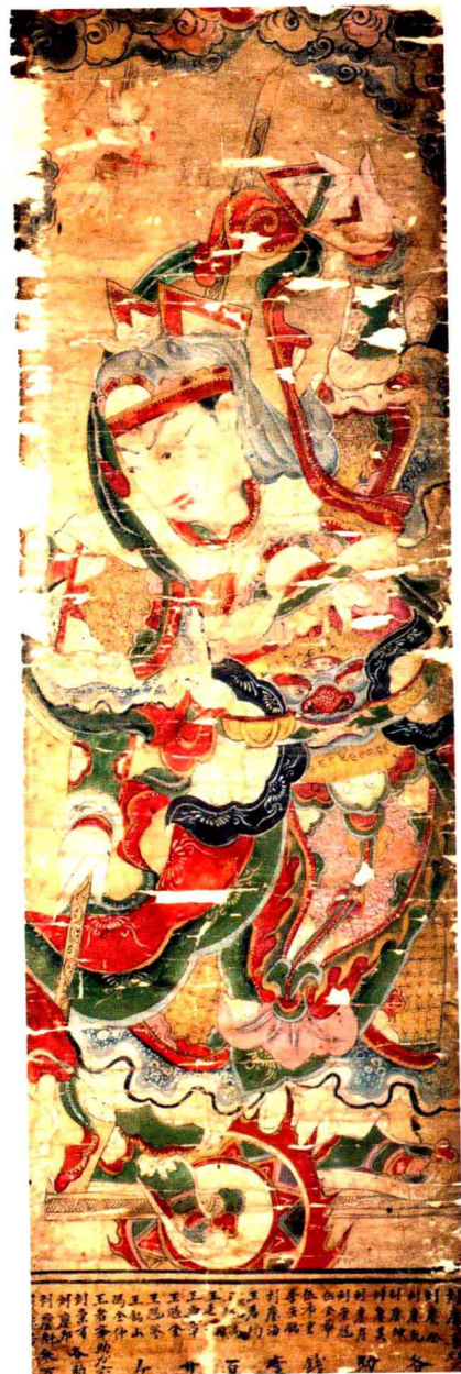
馬帥 ( 2 ) ma shuai