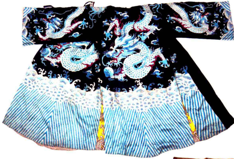
儼服飾 nuo fu shi