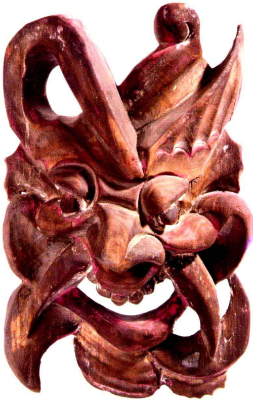
吞口 tun kou