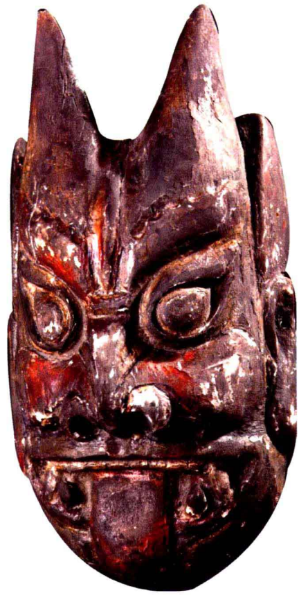
開路將軍 kai lu jiang jun