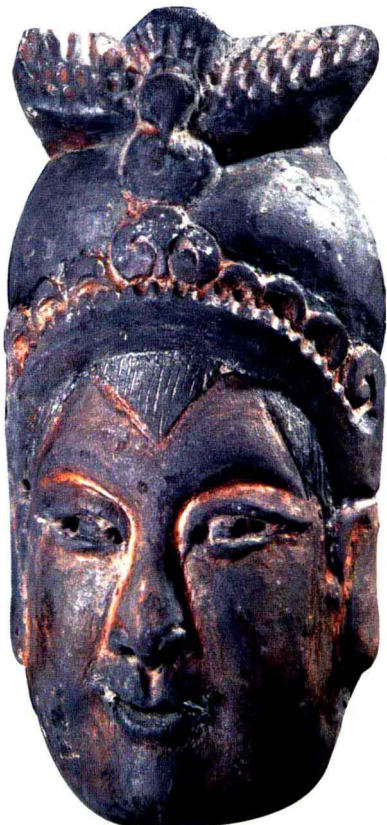
先鋒小姐 xian feng xiao jie