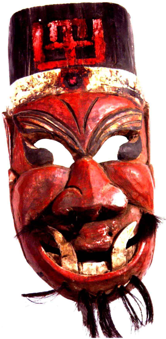
判官 pan guan