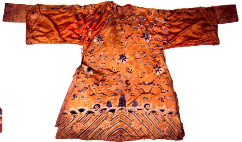
儼服飾 nuo fu shi