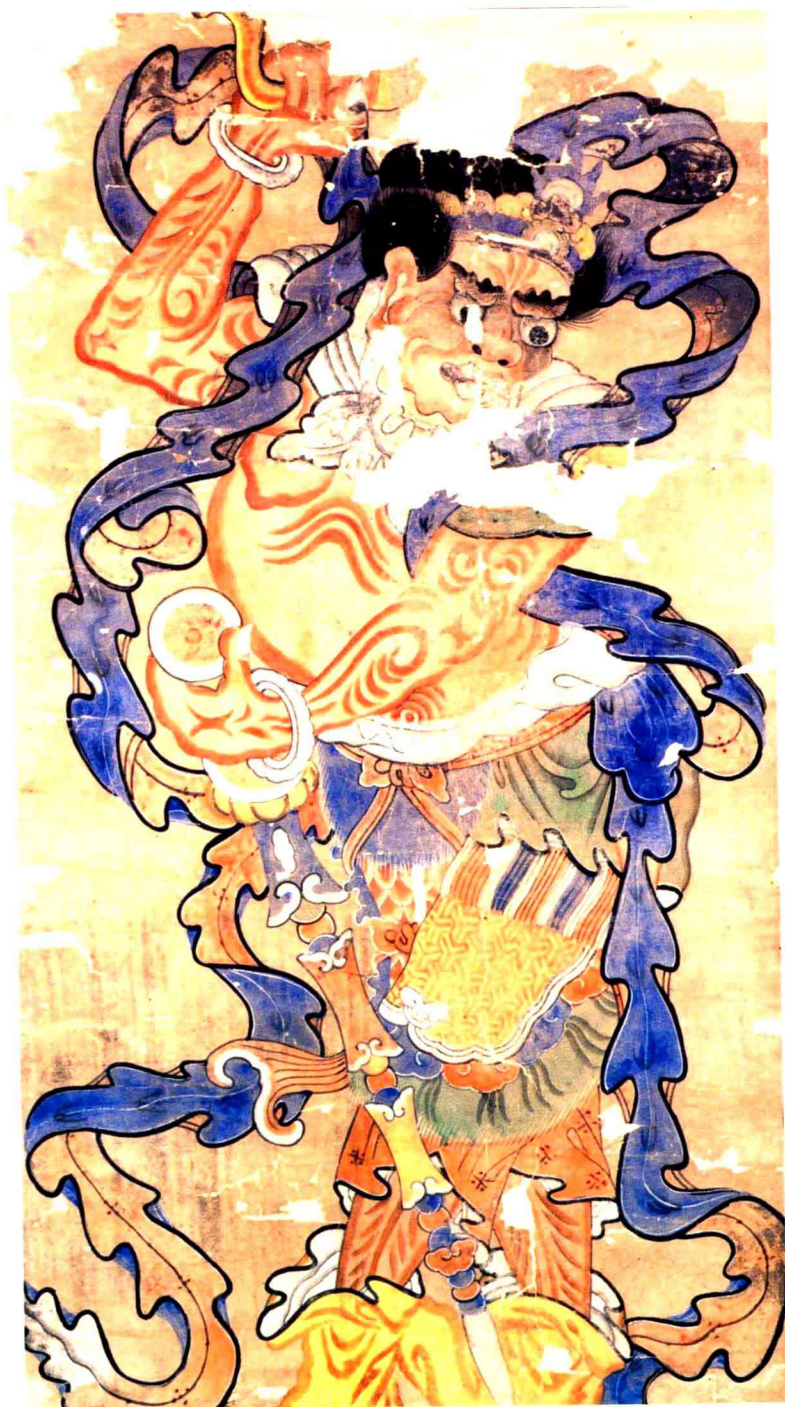
青龍:左門神 ( 1 ) qing long:zuo men shen