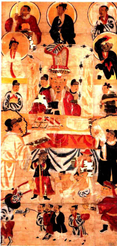
南岳 (3) nan yue