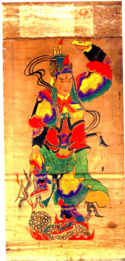
馬帥 ( 1 ) ma shuai