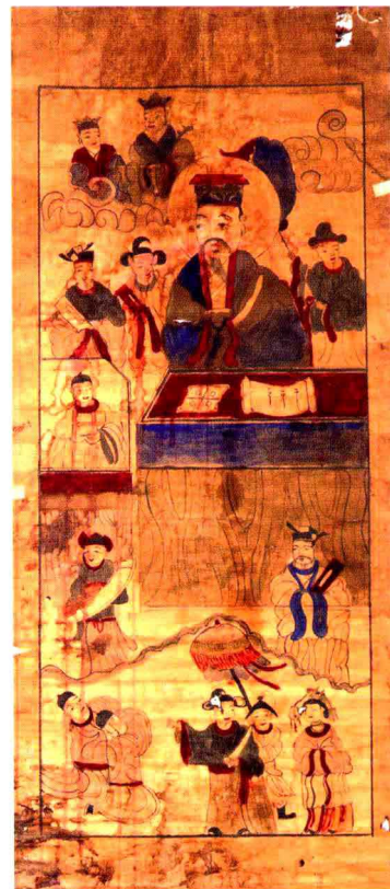
東岳大帝 dong yue da di