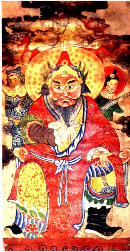
關神帝君 guan shen di jun