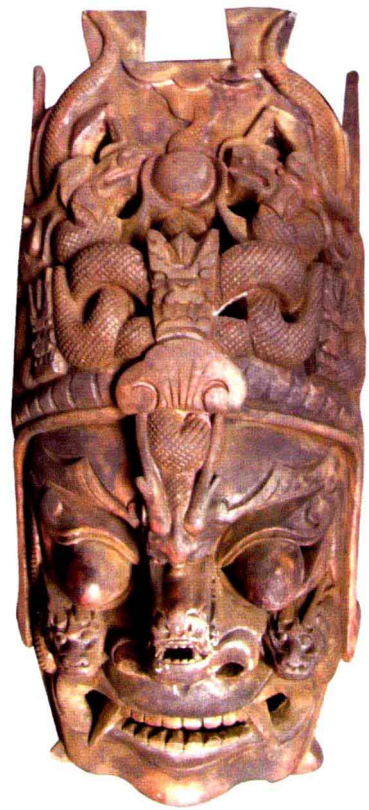
龍王 long wang