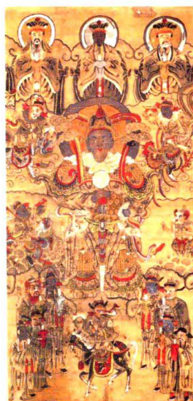
鄧天君:雷帥之首 deng tian jun:lei shuai zhi shou