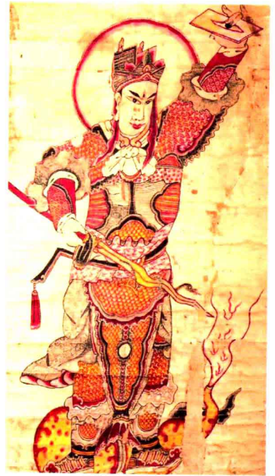
馬帥:玉皇上帝的主副帥 ma shuai:yu huang shang di de zhu fu shuai