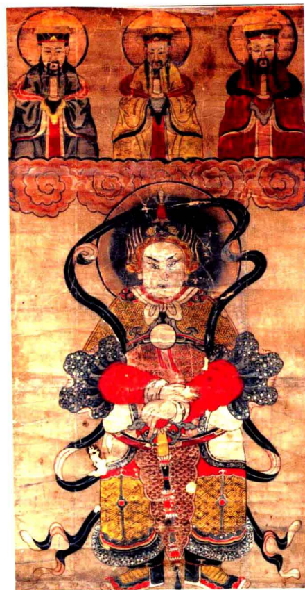
青龍:左門神 ( 2 ) qing long:zuo men shen