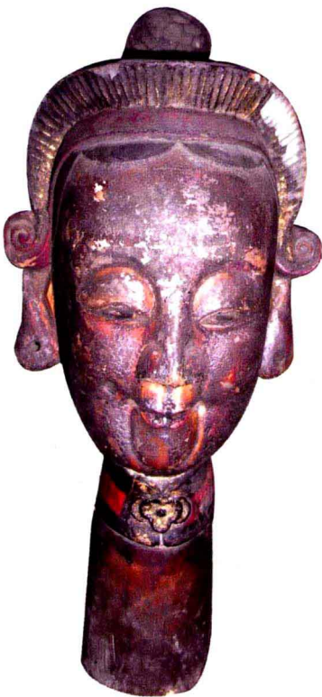
儺母3 nuo mu