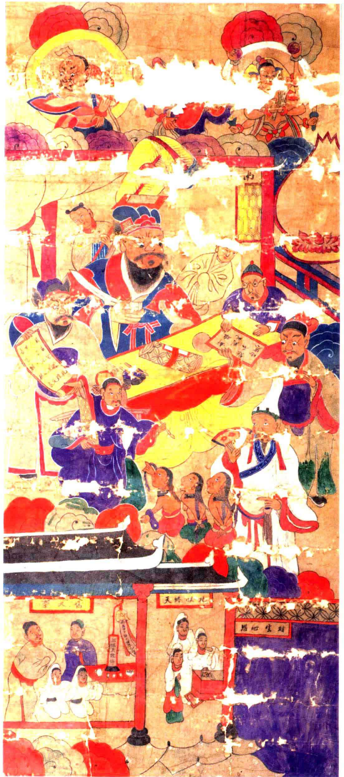
南岳大帝 nan yue da di