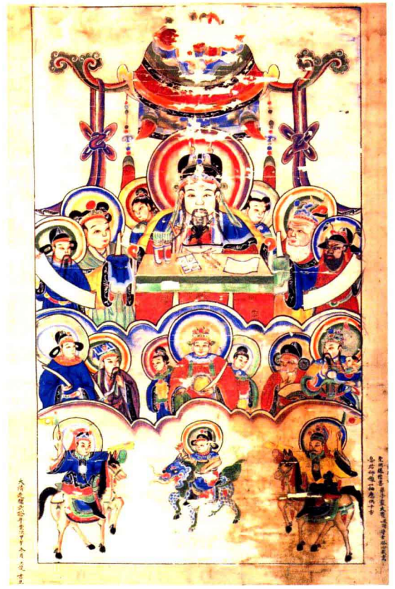
關帝 guan di