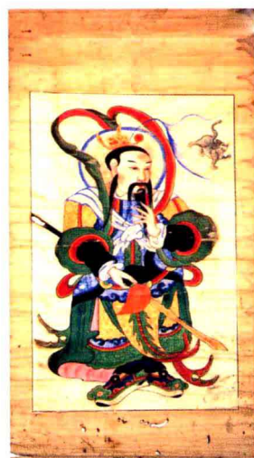
白虎:右門神之二 bai hu:you men shen zhi er