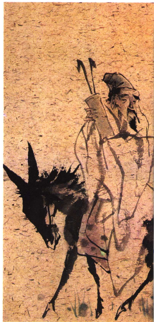
張果老 Zhang Chines