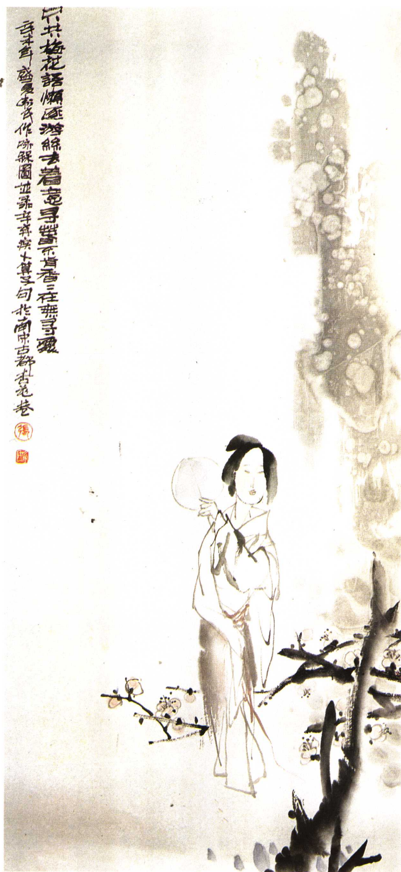
香花無尋處 (97×44cm) Where the Flowers Smell Sweet.