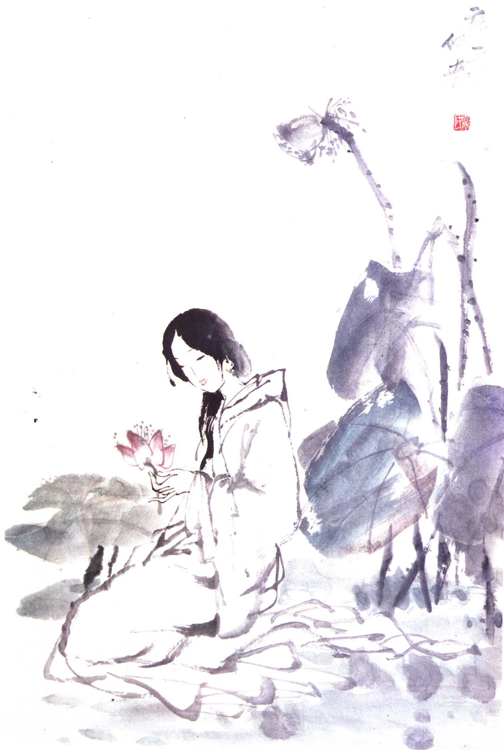
荷香 (70×46cm) Fragrance of the Lotus.