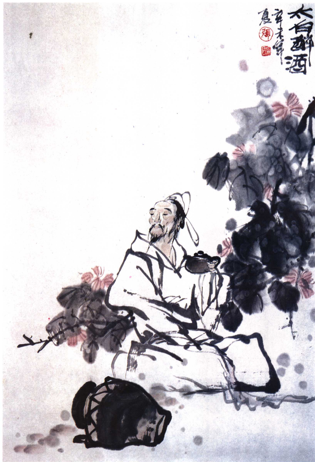
太白醉酒 (69.5×46cm) Drunken Li Bai.