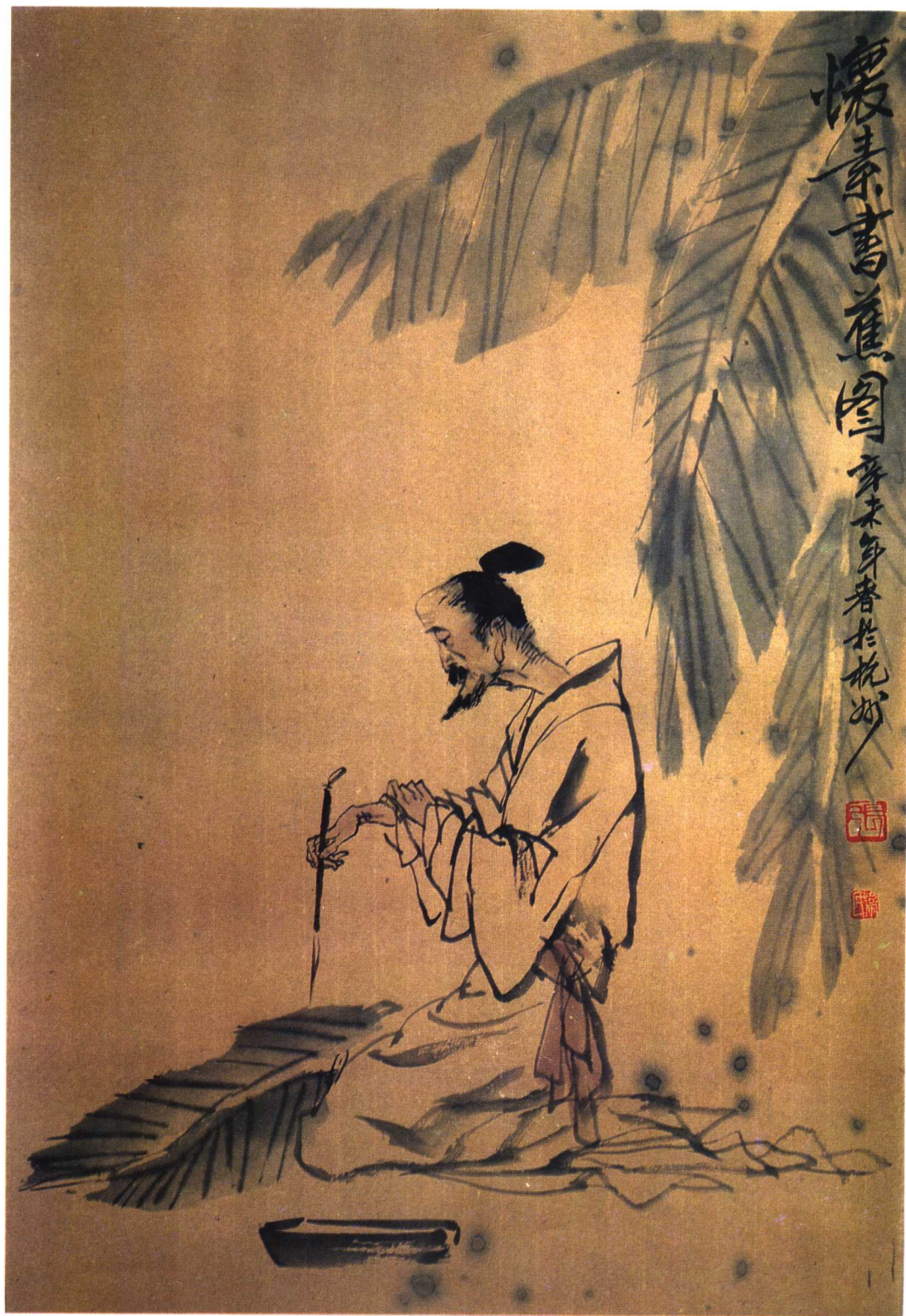
懷素書蕉 (68.5 × 45cm)