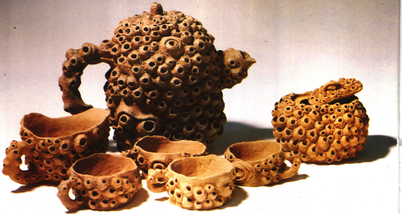
蜂窝牌咖啡具 (高5—23cm) 1988年 Honeycomb-Brand Coffee Set.