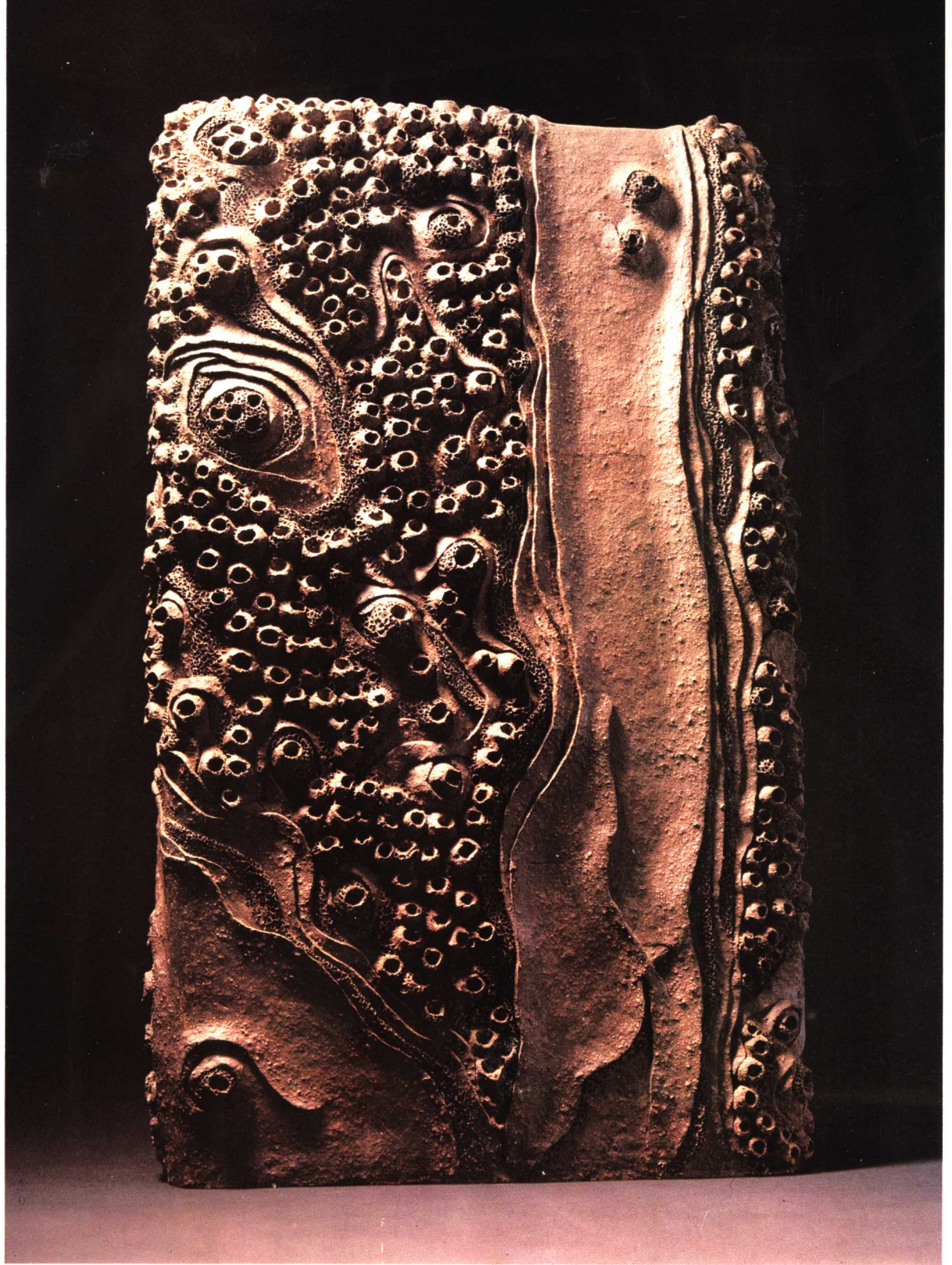
新世紀 (60×35×8cm) 1990年 New Century.