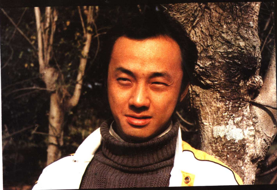
封面：九日 (直徑39cm) 1987年 Front cover: Nine Days . (39cm in diameter)

作品中，體現出對陶瓷材料和陶藝文化較深的理解，融匯進祖國傳統文化精髓和陶藝史的原則。他的作品多次在國內外重要學術刊物上發表，並入選1990年在法國瓦洛里舉辦的第十二屆國際陶藝雙年展。浙江電視臺還為其拍攝了題為《陶壇怪杰——孫人》的電視專題片。近年來多次收到來自法國、挪威、美國、德國有關學術單位的邀請，作品為許多國內外文化機構和個人收藏。