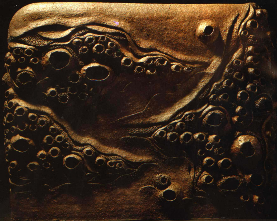
自然狀態 (34×40×8cm) 1990年 In Natural State.