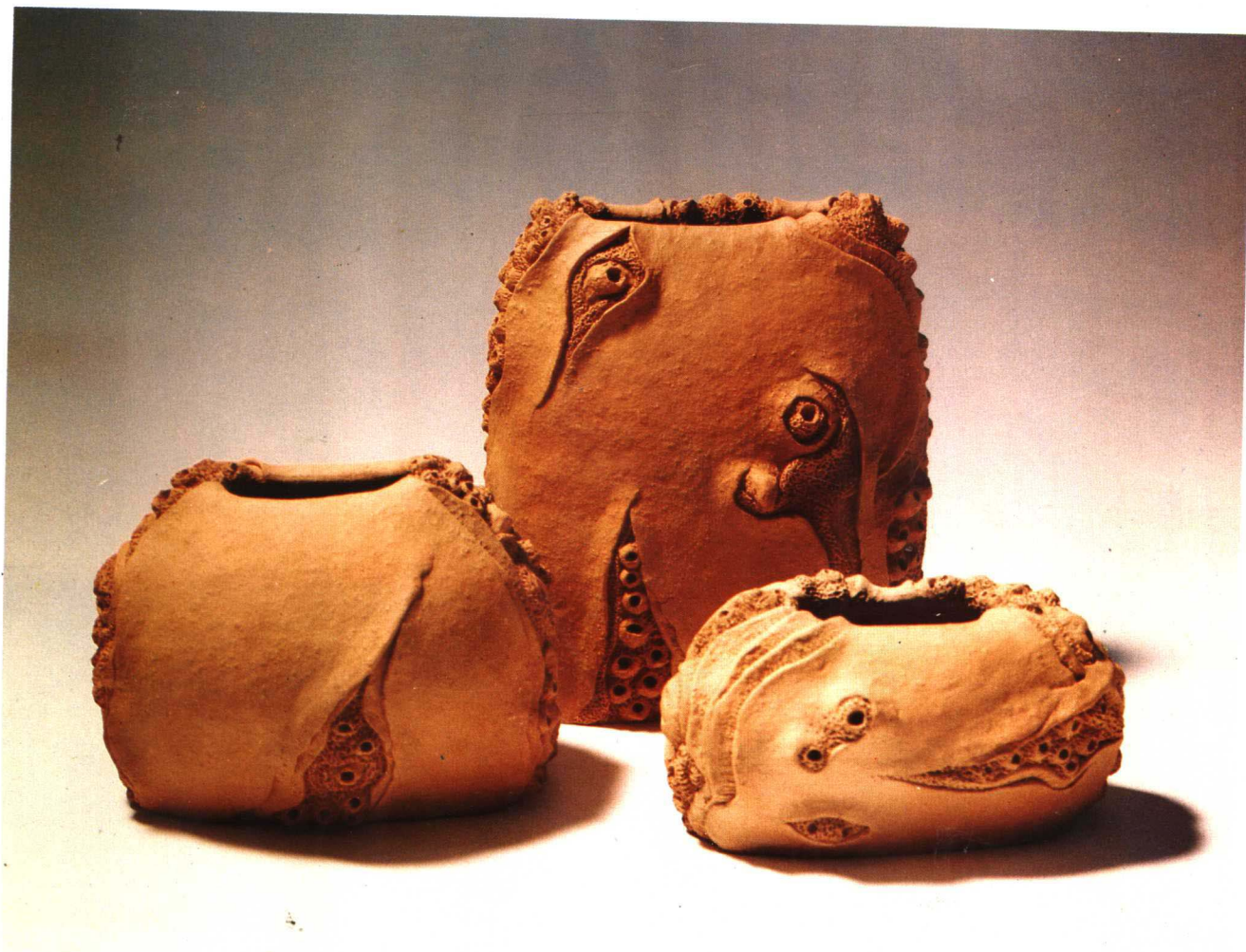
綻破皮層的器皿 (高9-23cm) 1990年 Crackle-Wares.