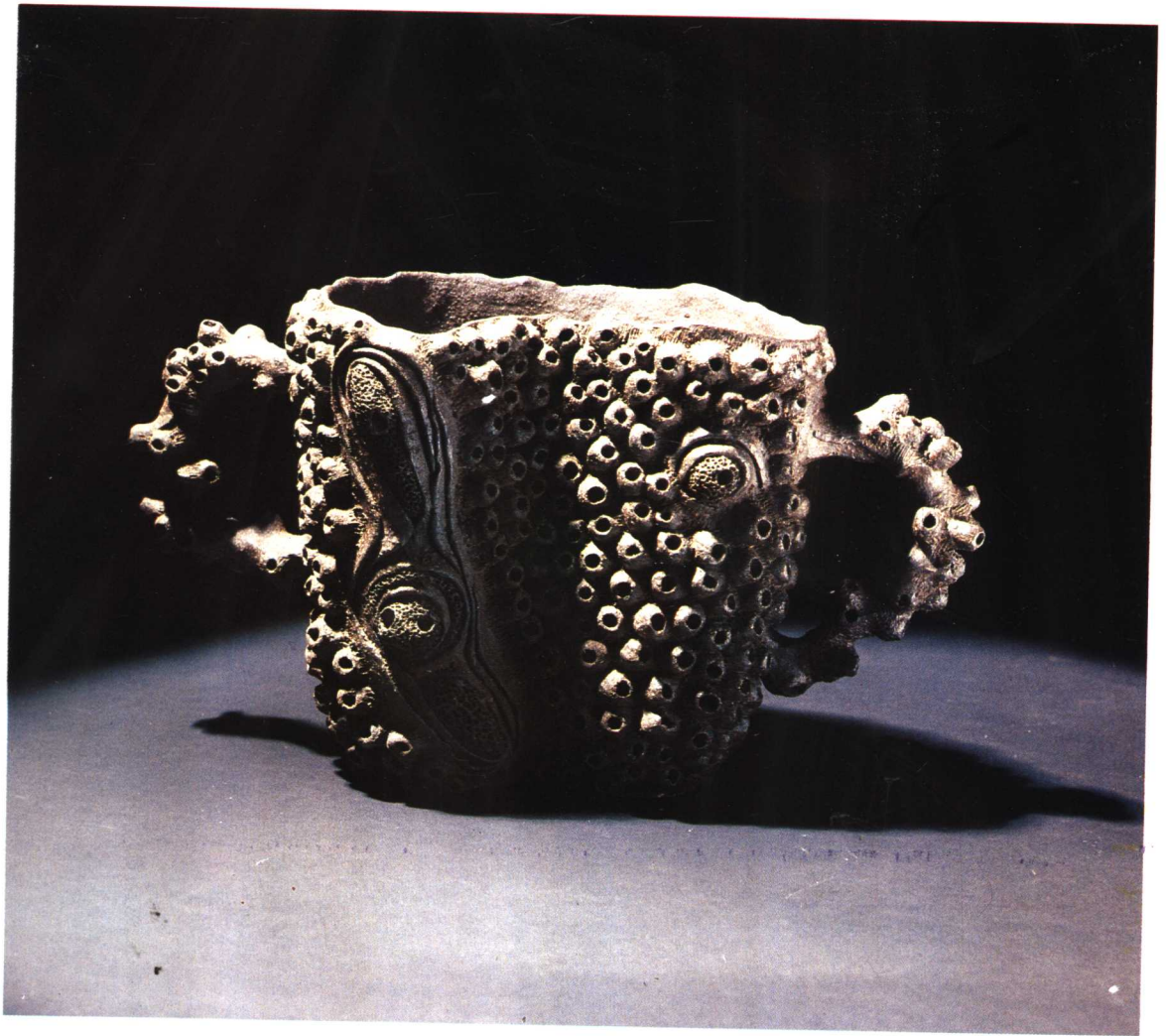
雙耳鉢 (20×40×15cm) 1989年 Two-Eared Cup.