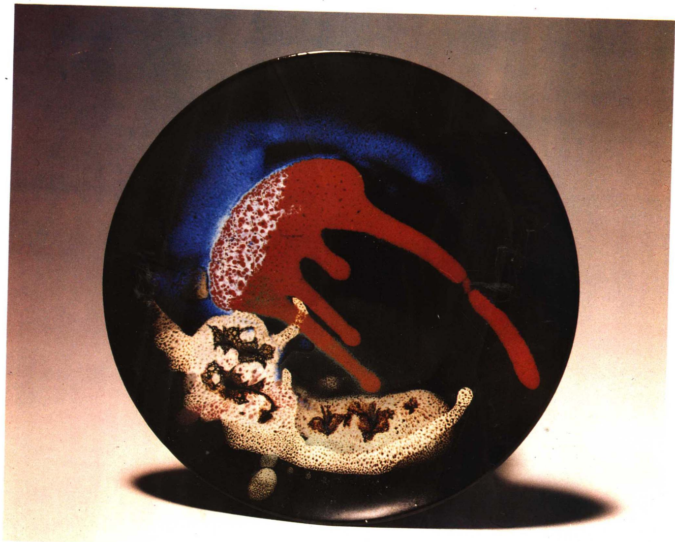
虚脱 (直径30cm) 1987年 Prostration. (30cm in diameter)