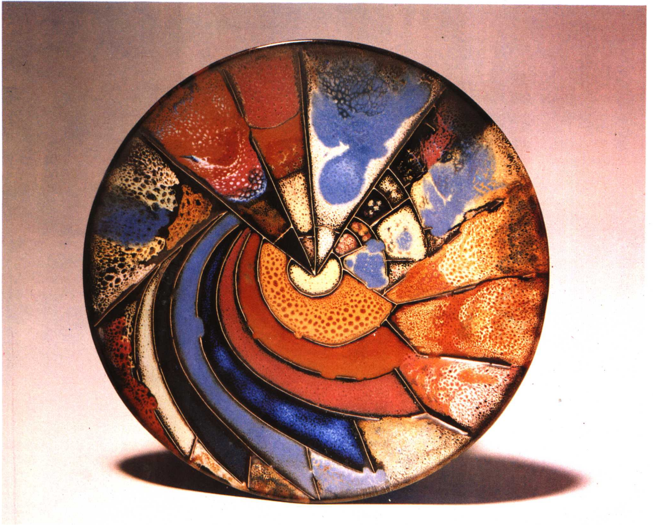
釉標 (直徑30cm) 1987年 Glazed Target. (30cm in diameter)