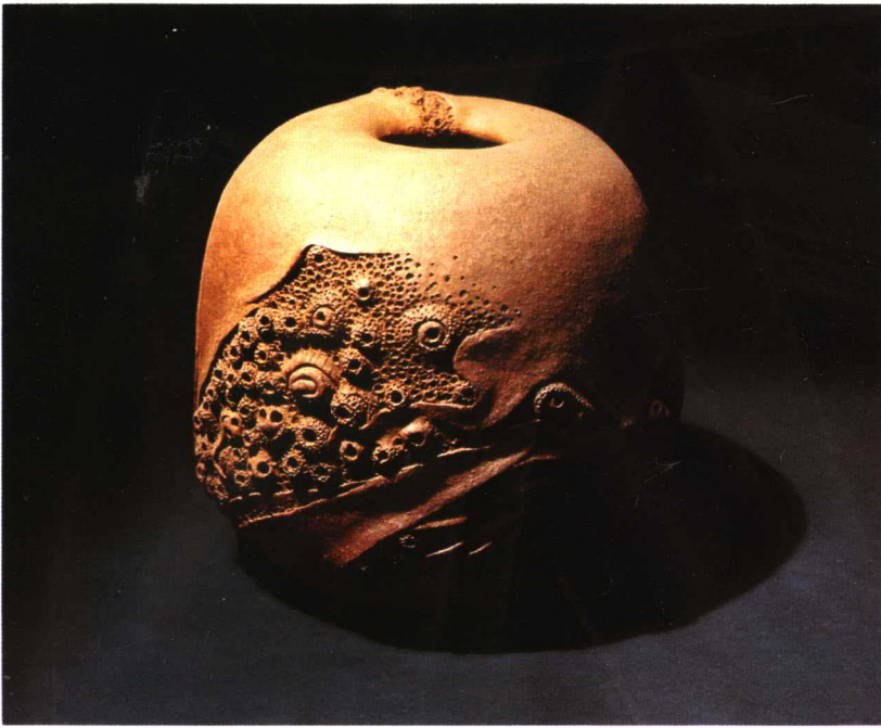
皮層解剖器 (高50cm) 1989年 Dissection of Cortex.