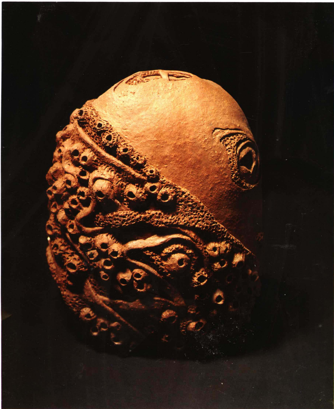
浮躁 (25×17×10cm) 1990年 Impetuosity.