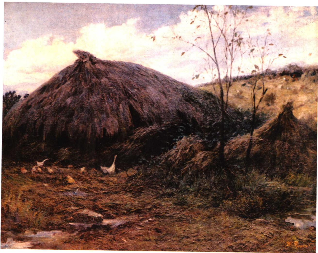
乾草垛 (81×100cm) 1988年 Dry Haystack.