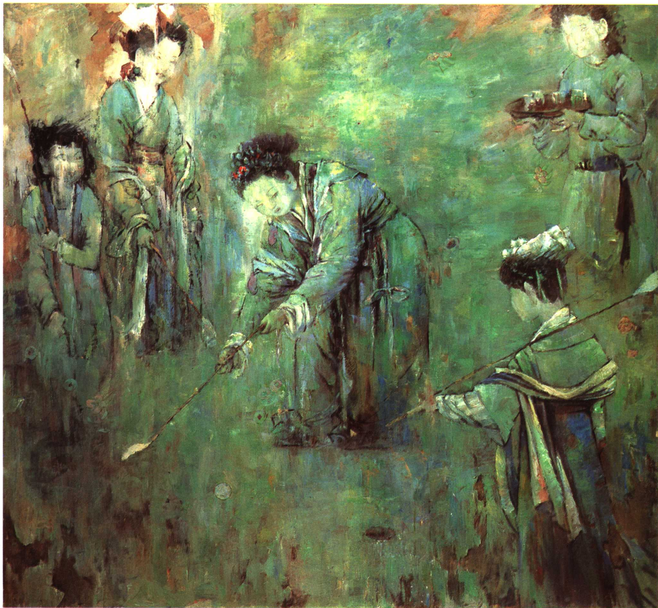
宮女擊球圖 (120×130cm) 1990年 Playing with the Ball.