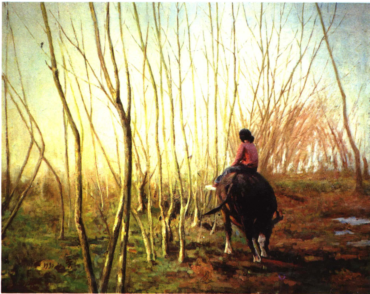
牧 歸 (50×61cm) 1989年 Herding Back.