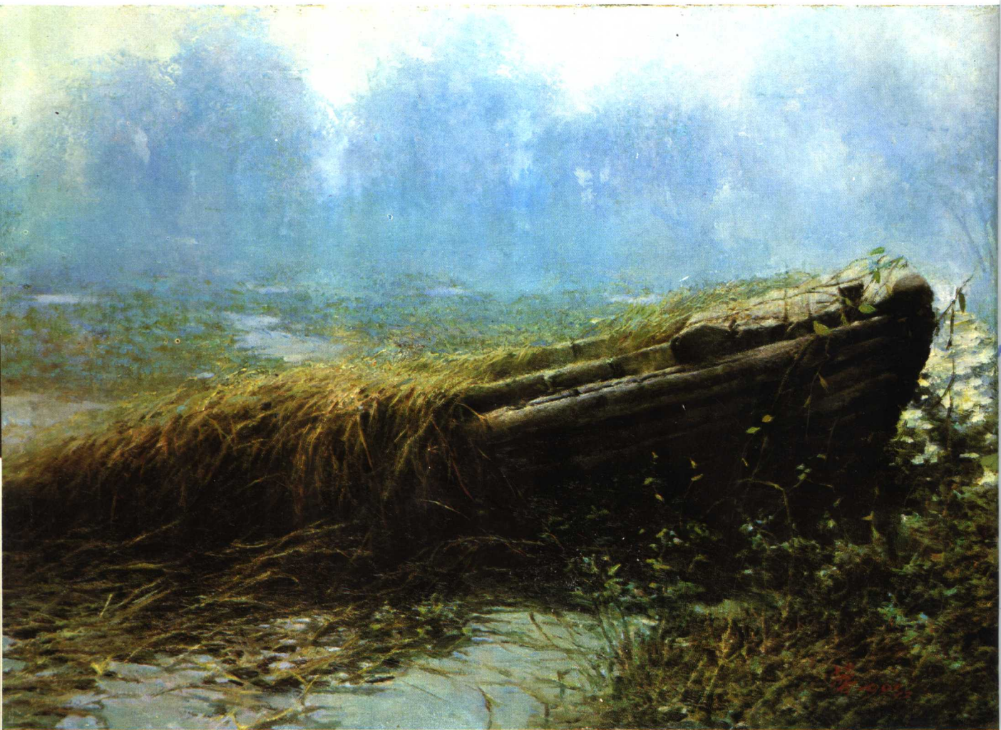
塘邊小舟 (65×92cm) 1988年 Small Boat.