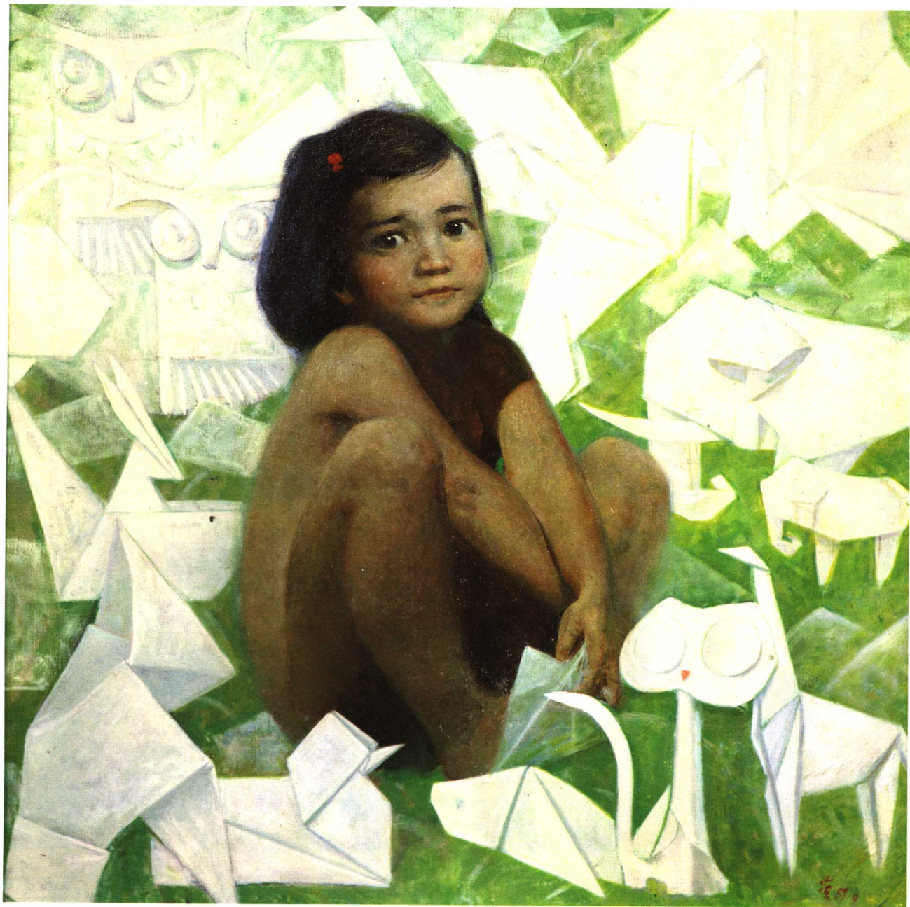
我的世界 (80×80cm) 1989年 My World.