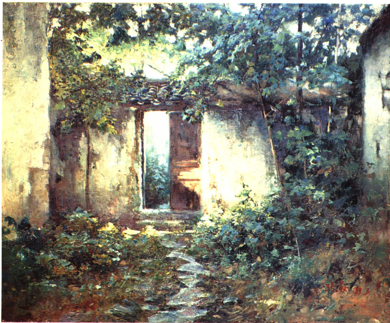
烏鎮寫生 (50×61cm) 1987年 In Wuzhen Town.