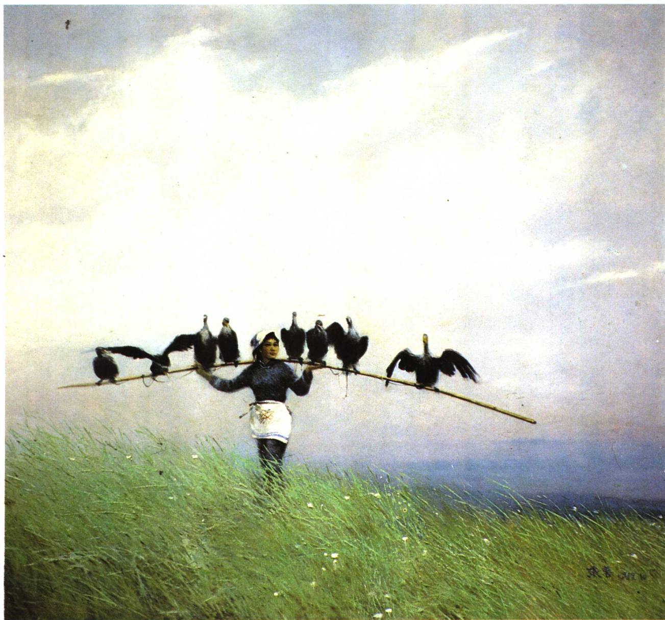
放鹰图 (120×130cm) 1988年 Training Eagles.