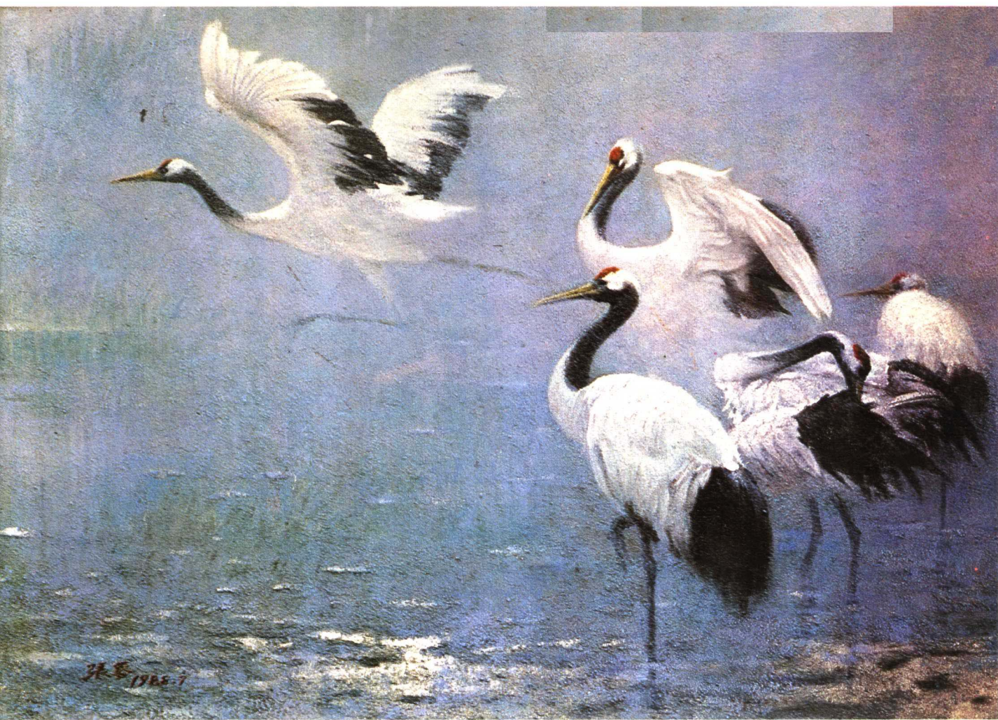
晨 雾 (70.5×100cm) 1988年 Morning Haze.