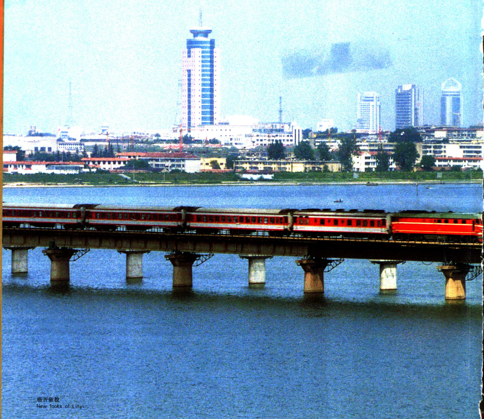
临沂新貌 New looks of Linyi