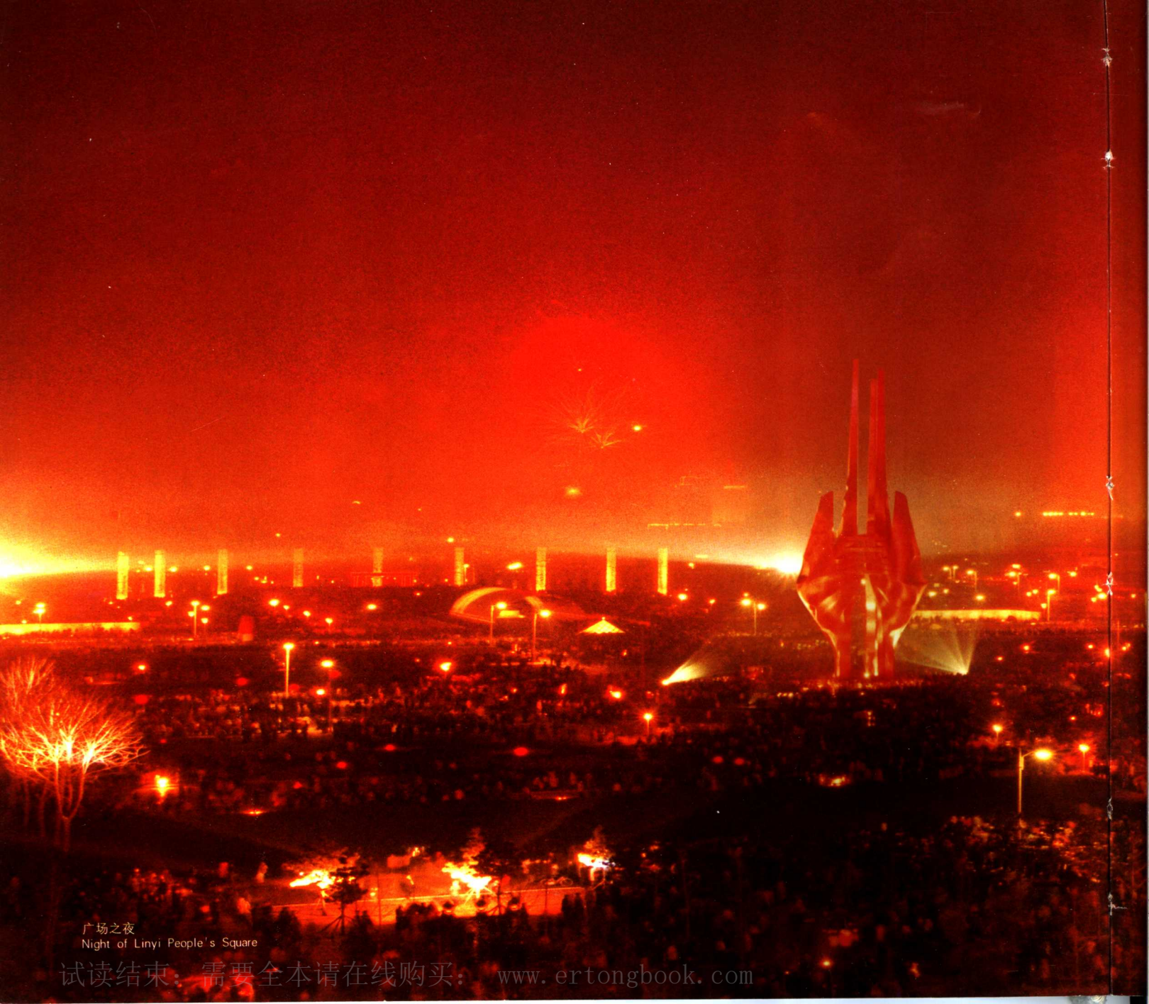
广场之夜 Night of Linyi People's Square