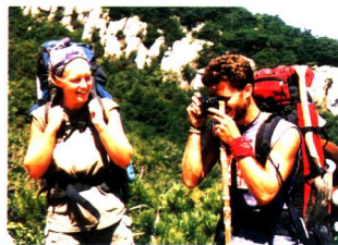
远方游客 Tourists from afar