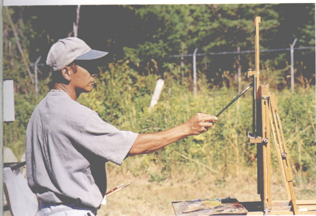
户外写生，美，蒙大拿州，2003年夏 Plein Air Painting, Summer at Montana, USA. 2003