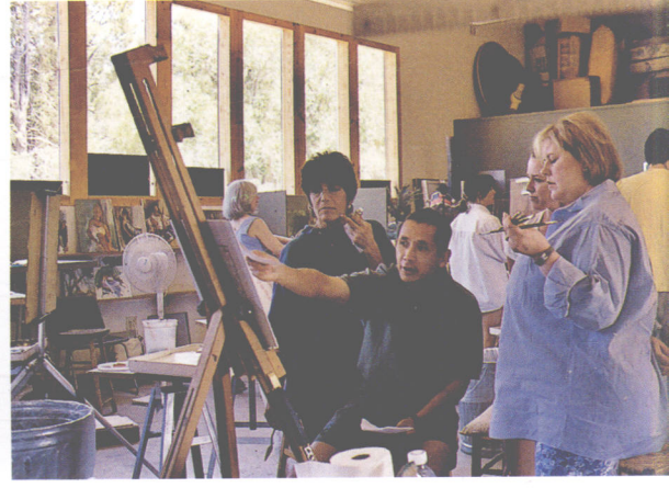
在美国新墨西哥州陶斯费迅艺术工作室油画短期训练班教学，2002年 Teaching at Fechin Painting Workshop, 2002