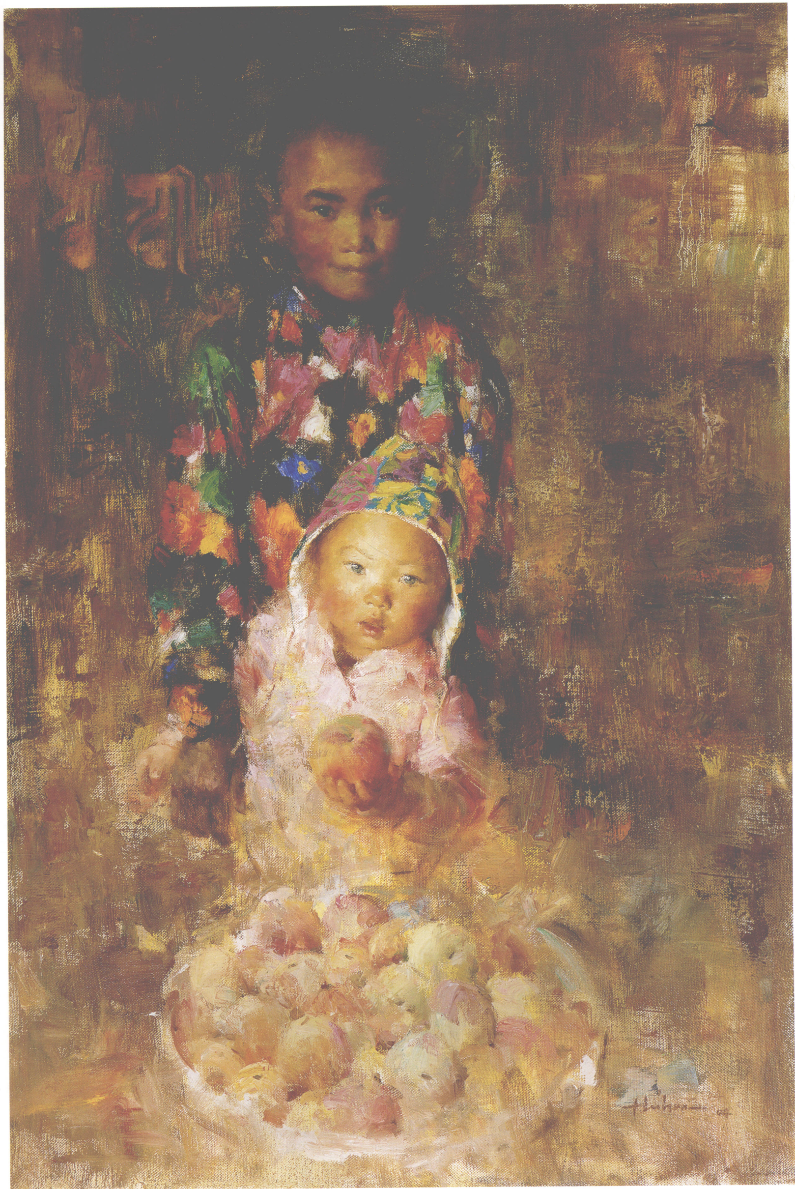
6. 桃子 油画 91cm × 61cm 2004年 Peach Oil 36in × 24in 2004