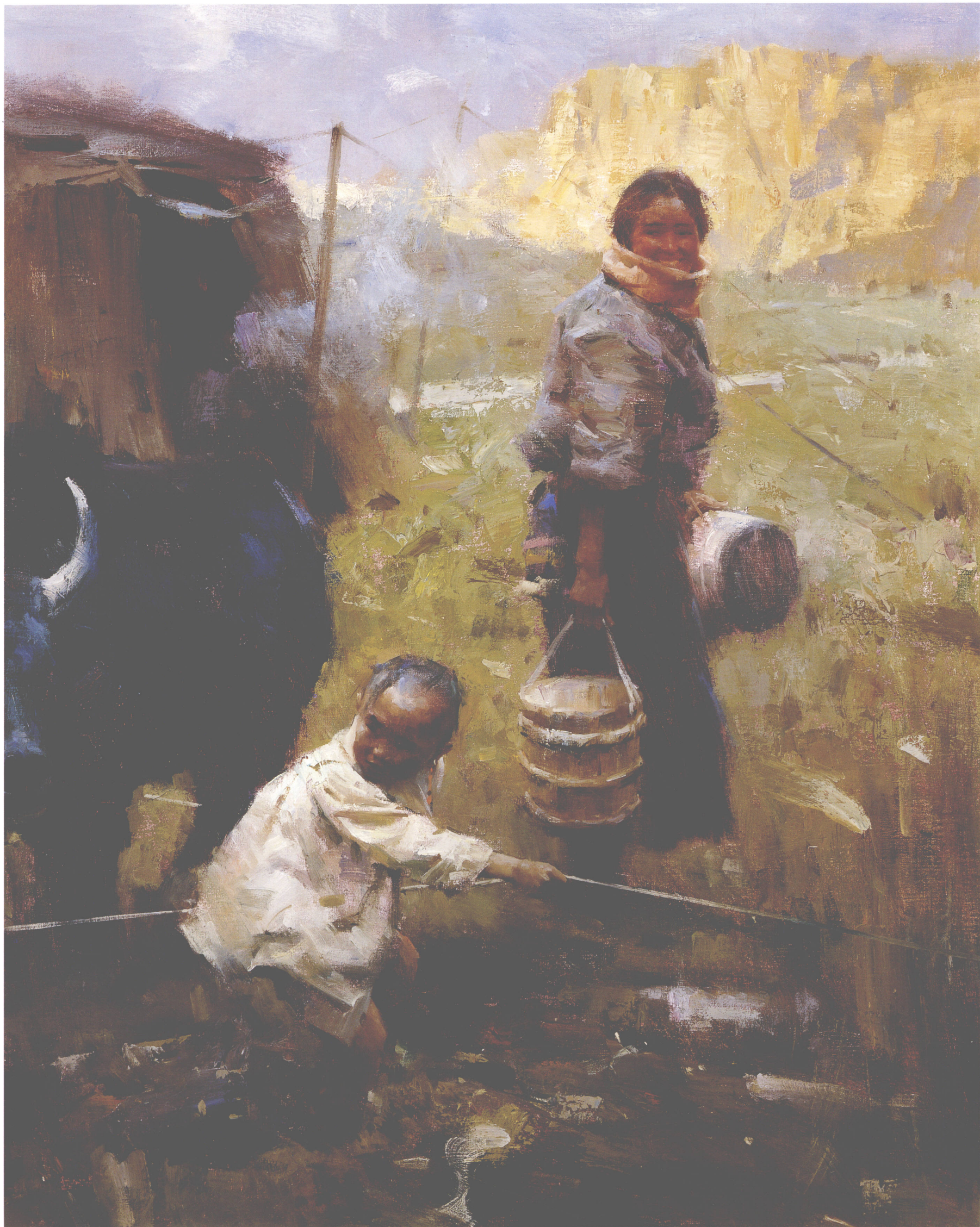
7.帮手 油画 76cm × 61cm 2002年 Helper Oil 30in × 24in 2002