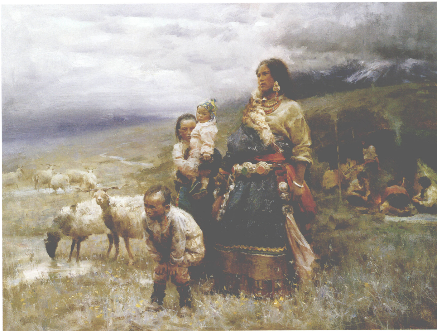
4. 牧归 油画 76cm × 102cm 2002 年