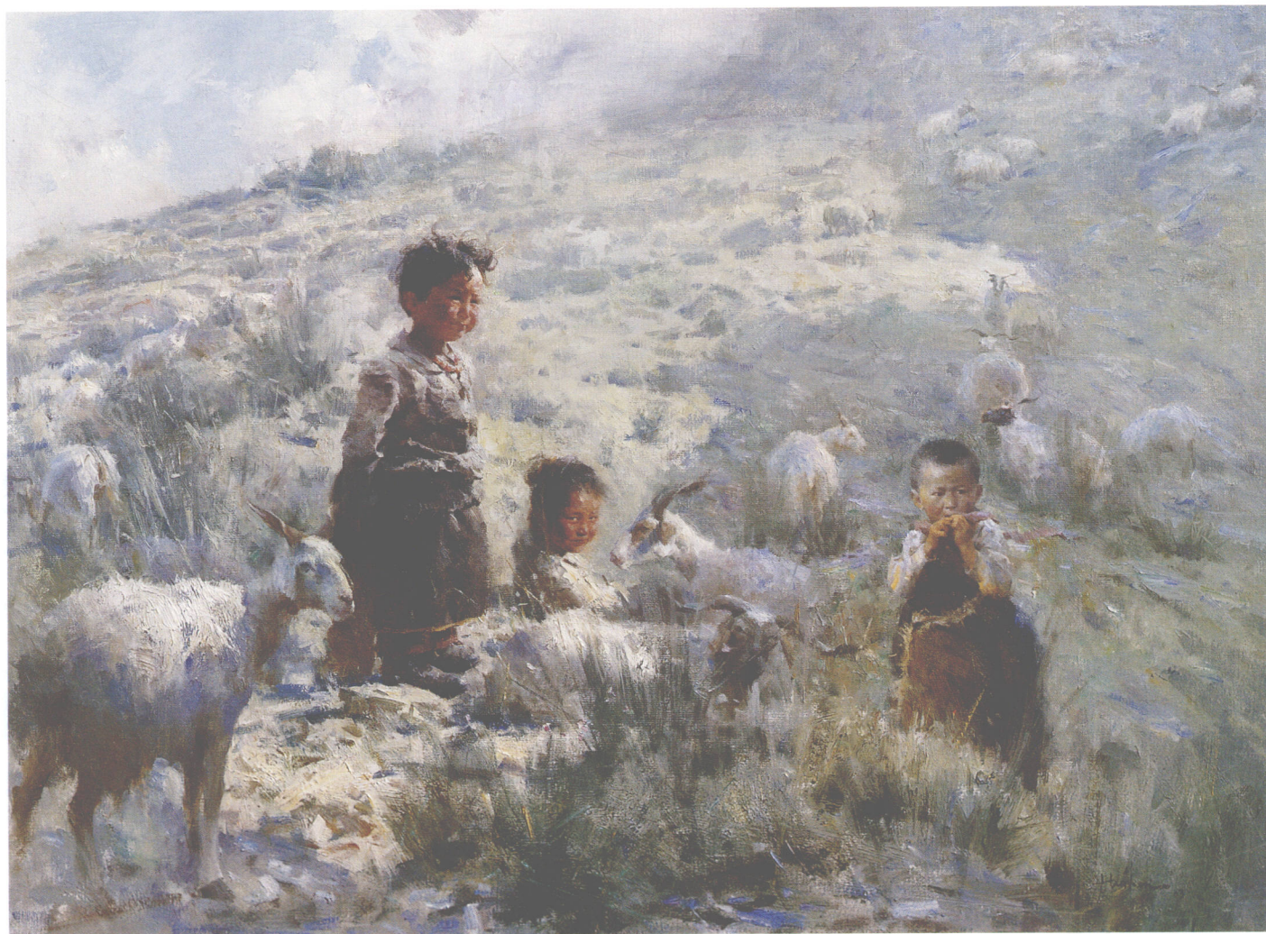
5. 童年 油画 76cm × 102cm 2003 年

Art of the West Publisher's Chioce Award, Artist for the new Century Invitational Exhibition, Bennington Center for the Arts, Bennington, Vermont, 2002