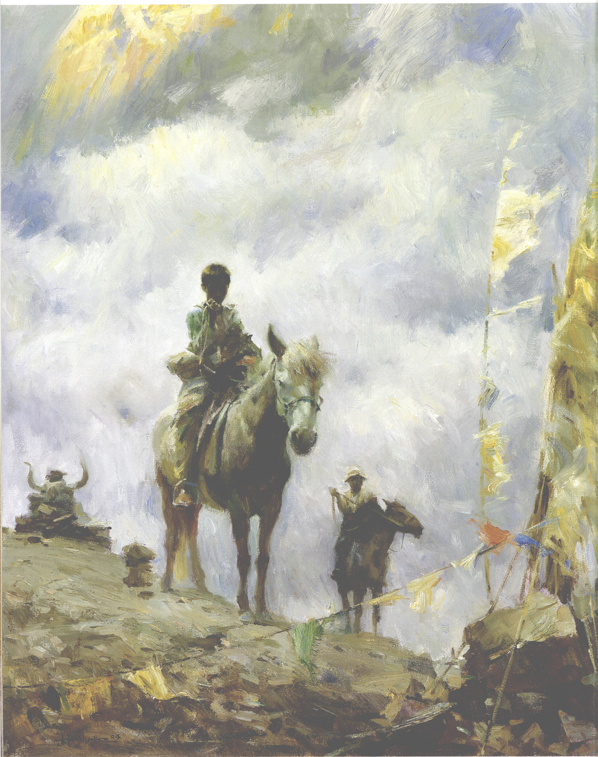
9. 山口的经幡 油画 76cm × 61cm 2004年 Pryer Flag on the Pass Oil 30in × 24in 2004