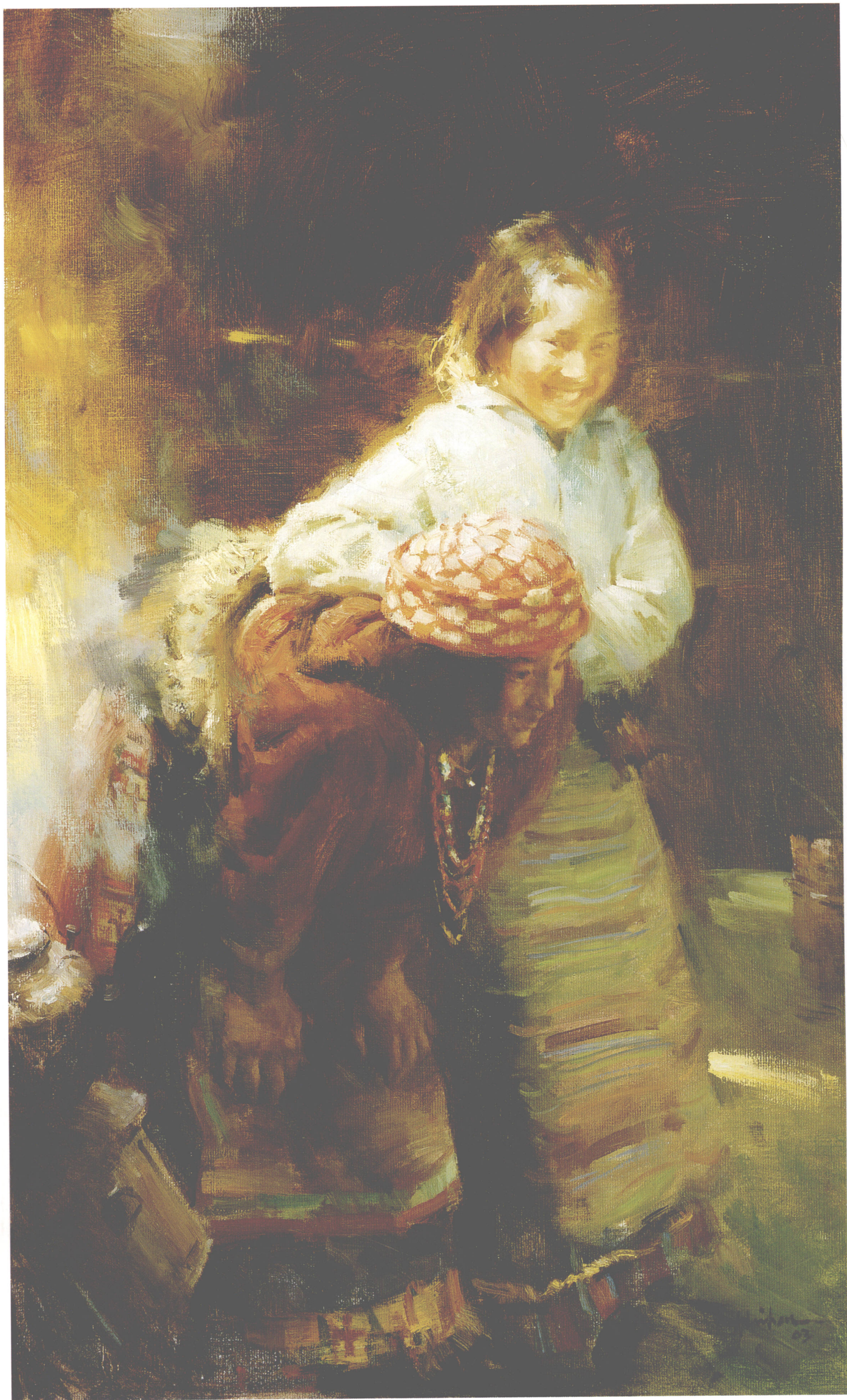
10.瞬间 油画 76cm × 46cm 2003年 Moment Oil 30in × 18in 2003