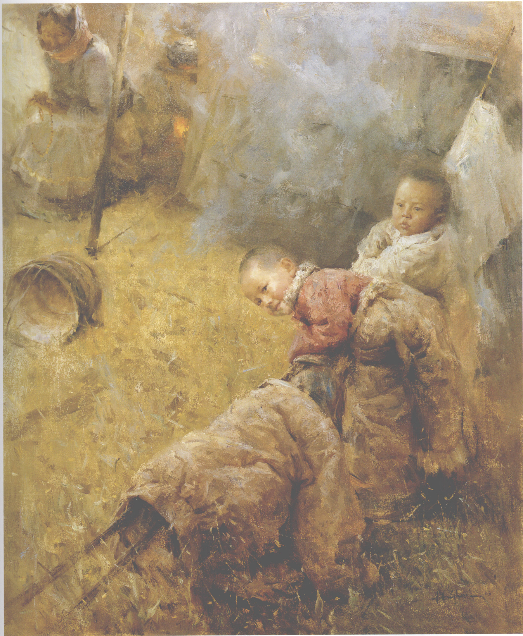
3. 期待 油画 91cm × 76cm 2003年 Anticipation Oil 36in × 30in 2003