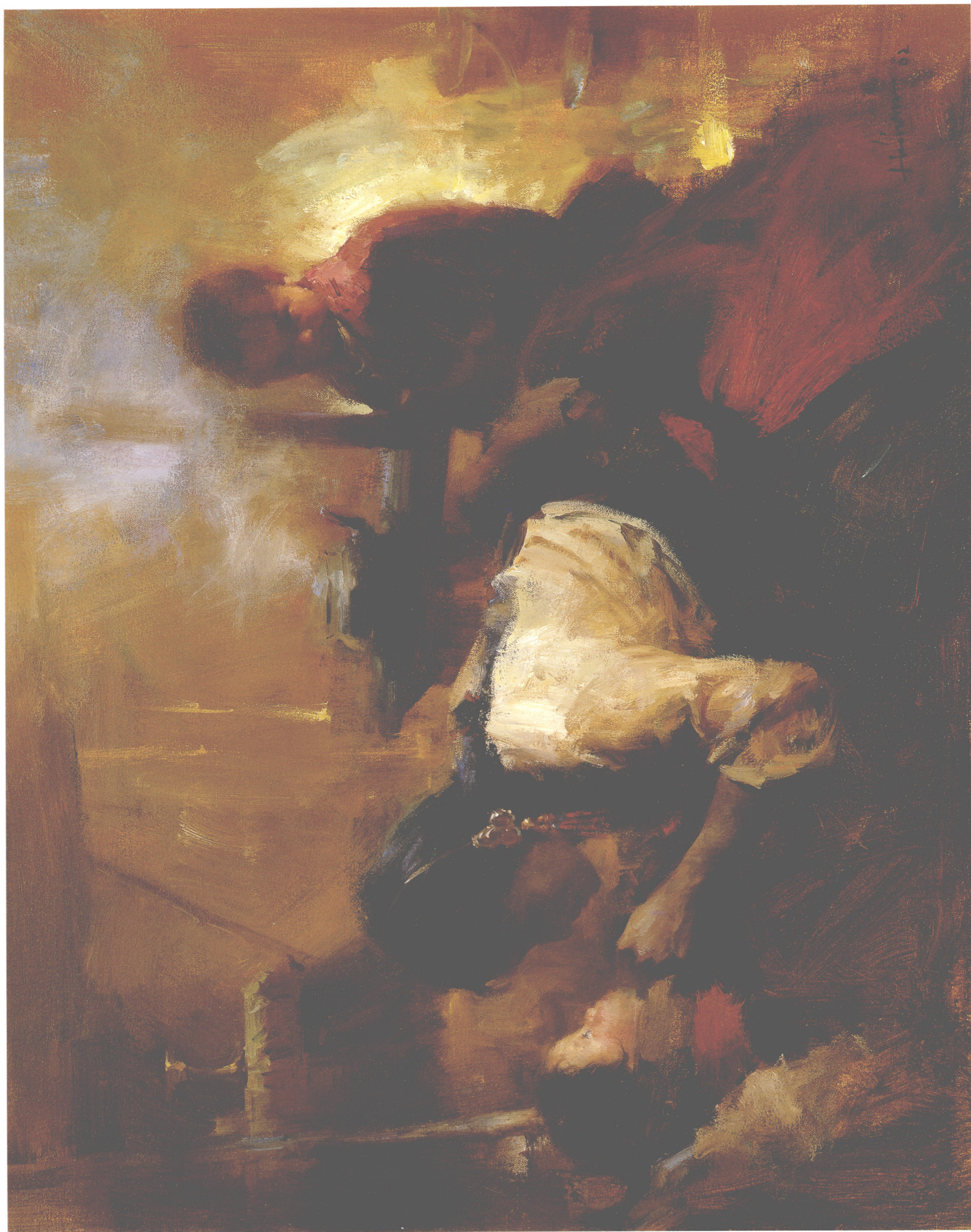
11. 帐篷内 油画 61cm × 76cm 2002 年 Inside Tent Oil 24in × 30in 2002