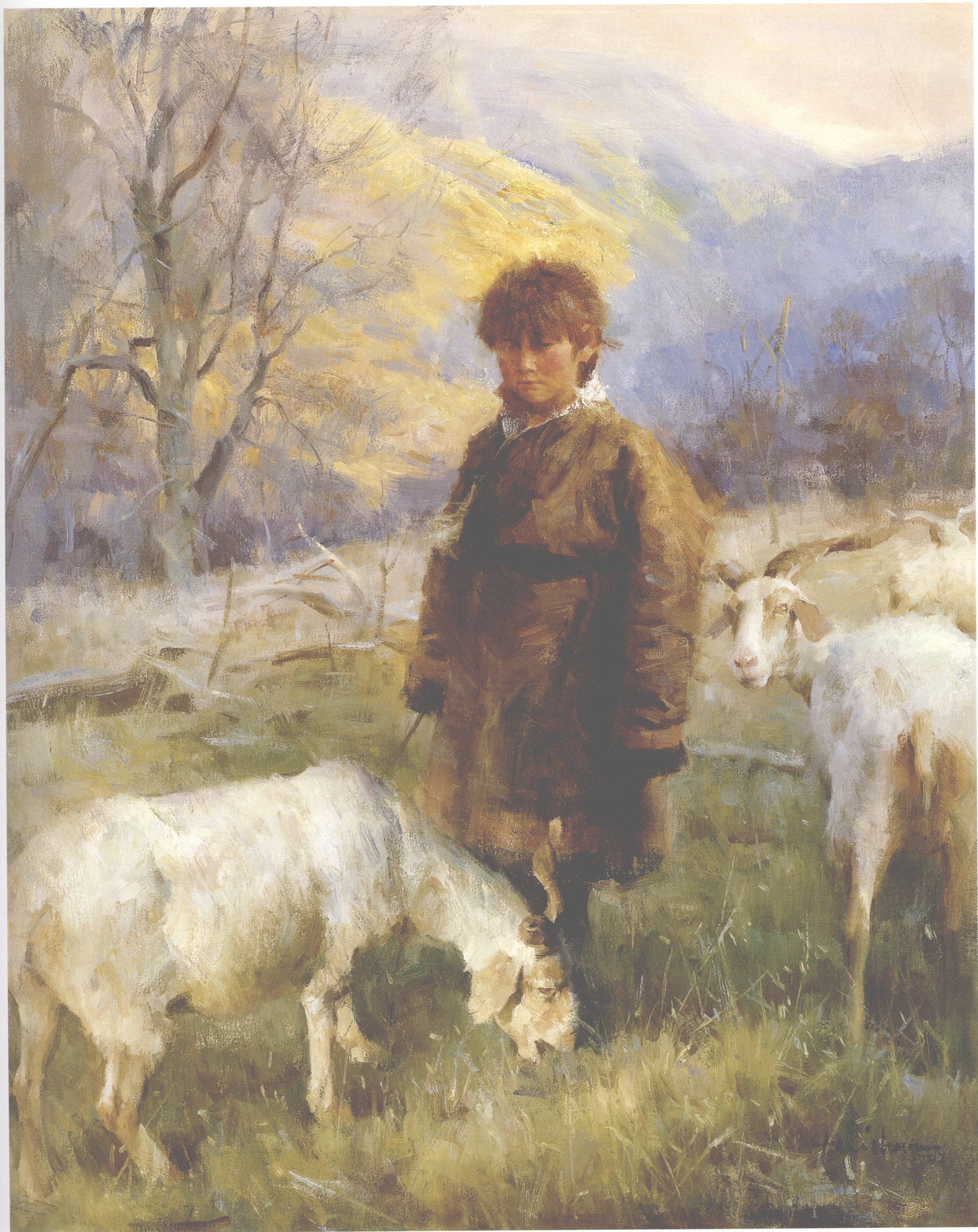
8. 牧童 油画 76cm × 61cm 2002年 Goatherd Oil 30in × 24in 2002