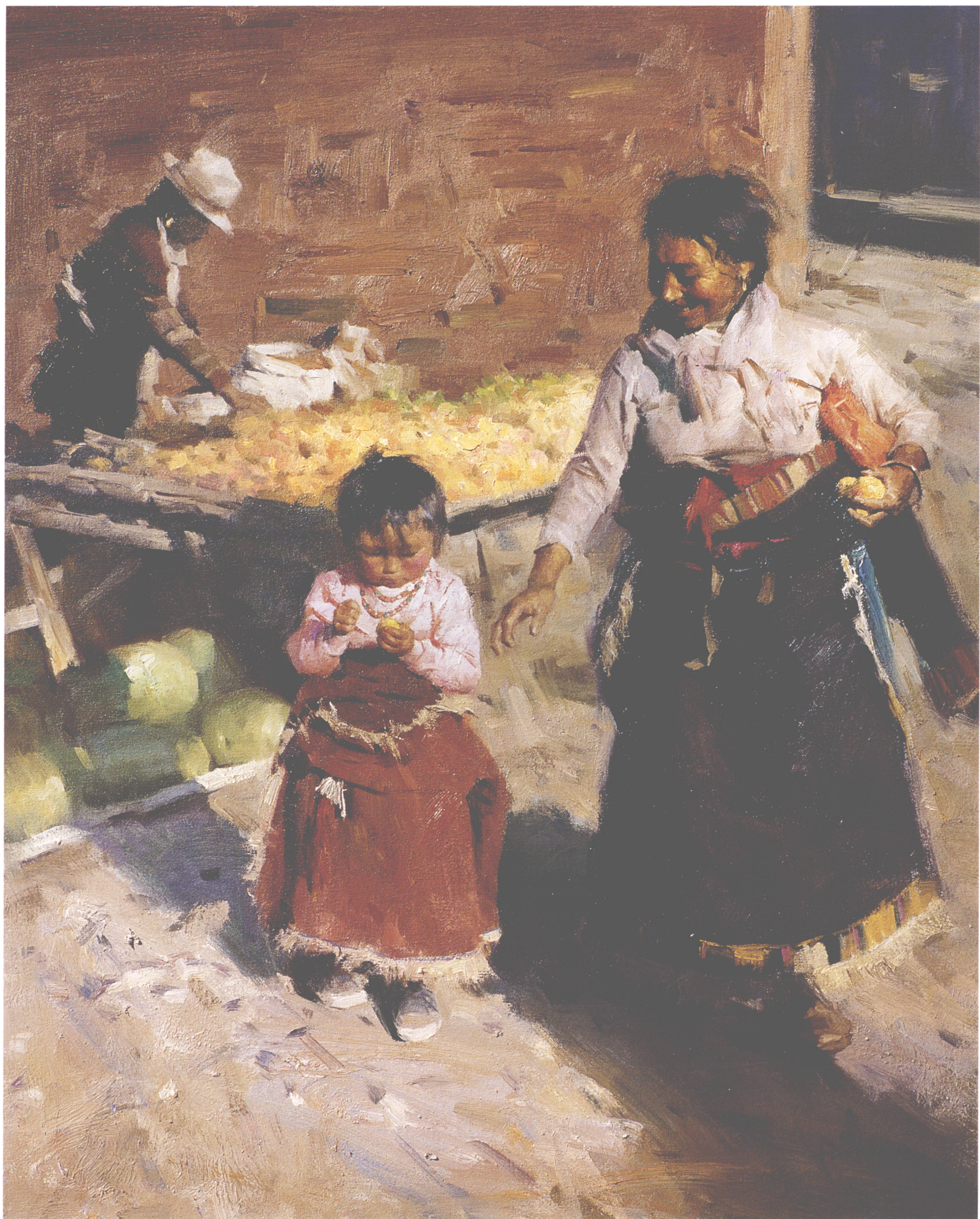
1. 桃子 油画 76cm × 61cm 2001 年 A Peach Oil 30in × 24in 2001