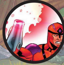
Klaw's sonic blaster