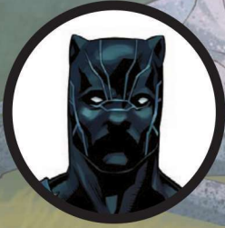
An imposter Black Panther