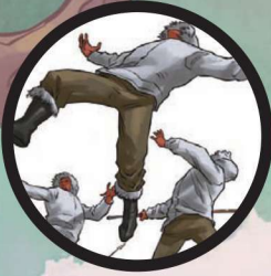
The White Gorilla Cult