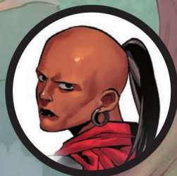
The Dora Milaje